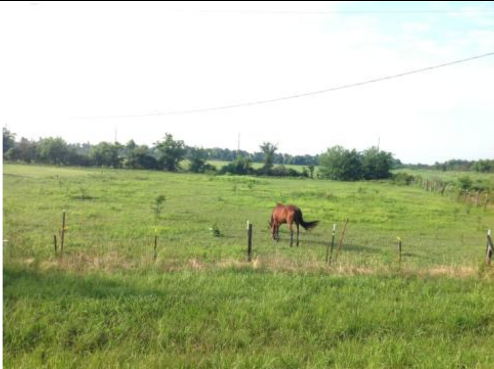
View looking South on site from Parker Road