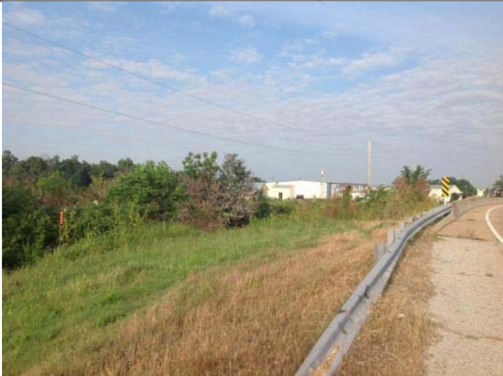
View of S&S Door Company looking west along Parker Rd. /Site on Left