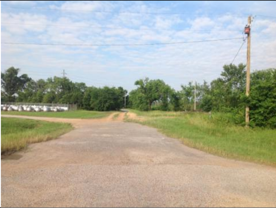
View looking west toward Site