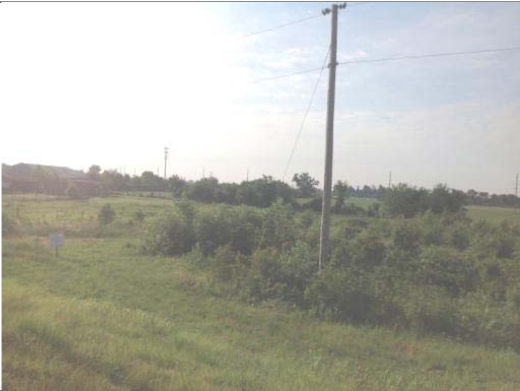
View from Parker Road looking on site