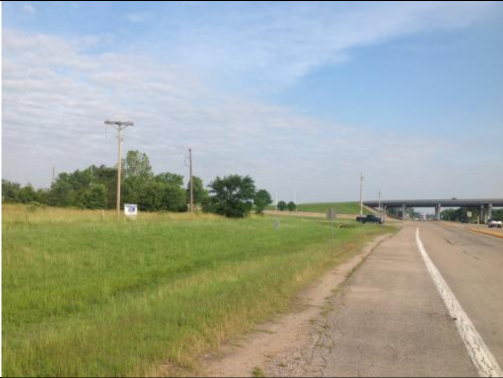
View looking North towards I-63 / I-463 Interchange