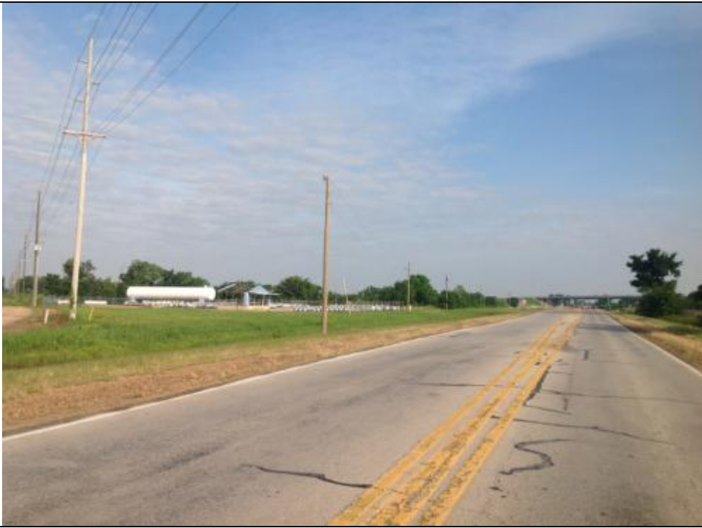
View looking northeast at Gas Utility, south of the site along Hwy. 463