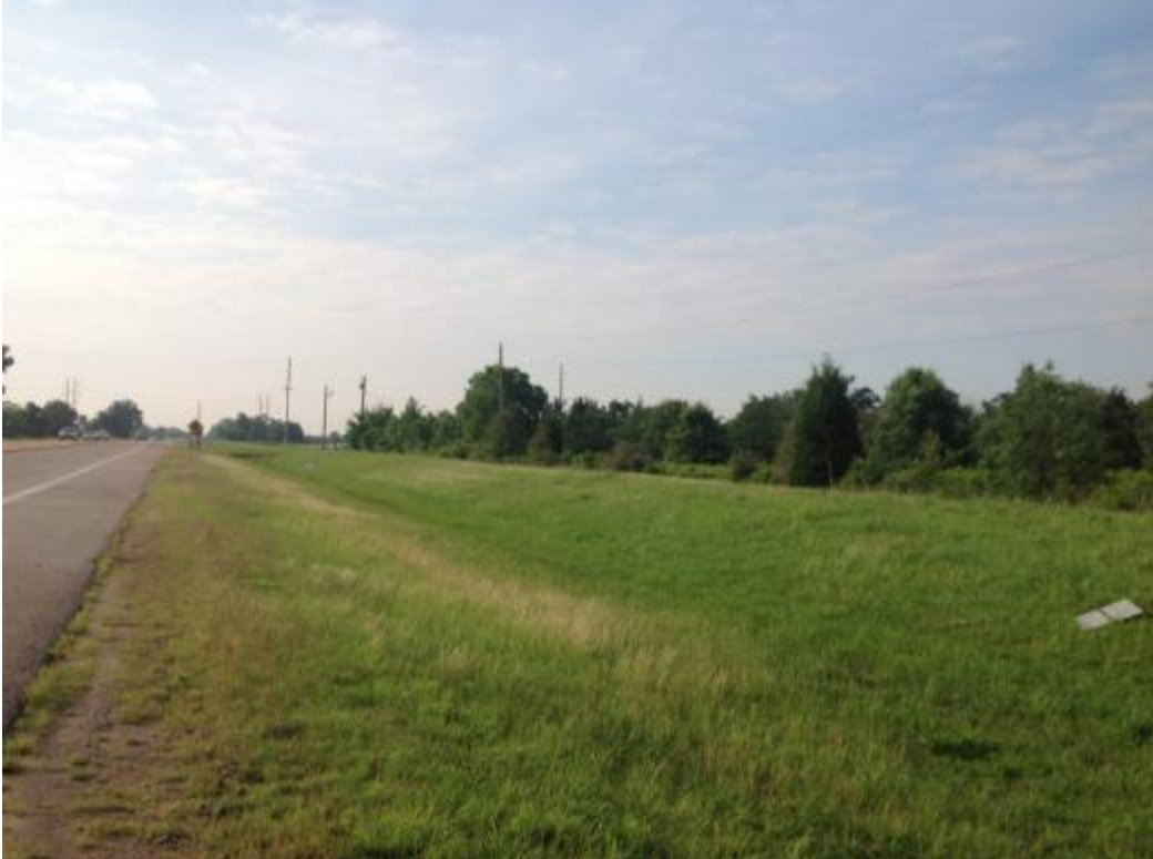
View looking South along I-463, Site on right