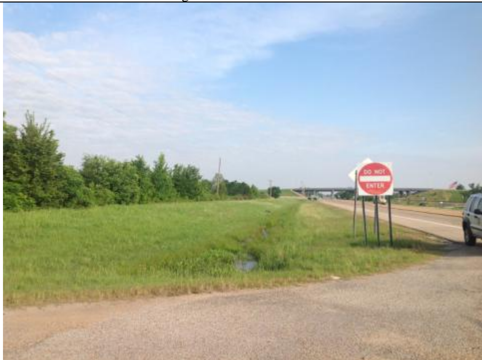
View looking North On Hwy. 463 along Property Frontage from existing drive access.