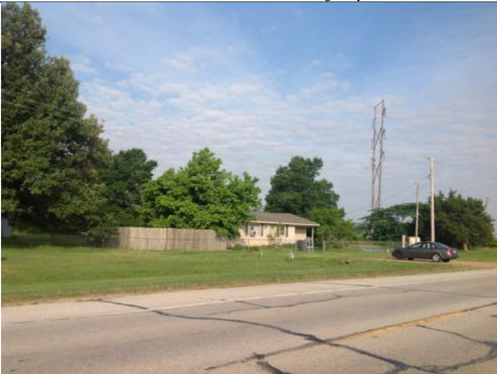
View from uses south of the site along Hwy. 463