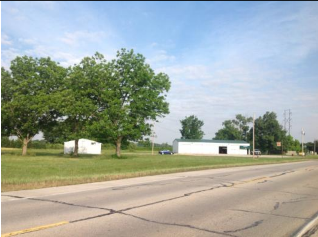
View from uses south of the site along Hwy. 463