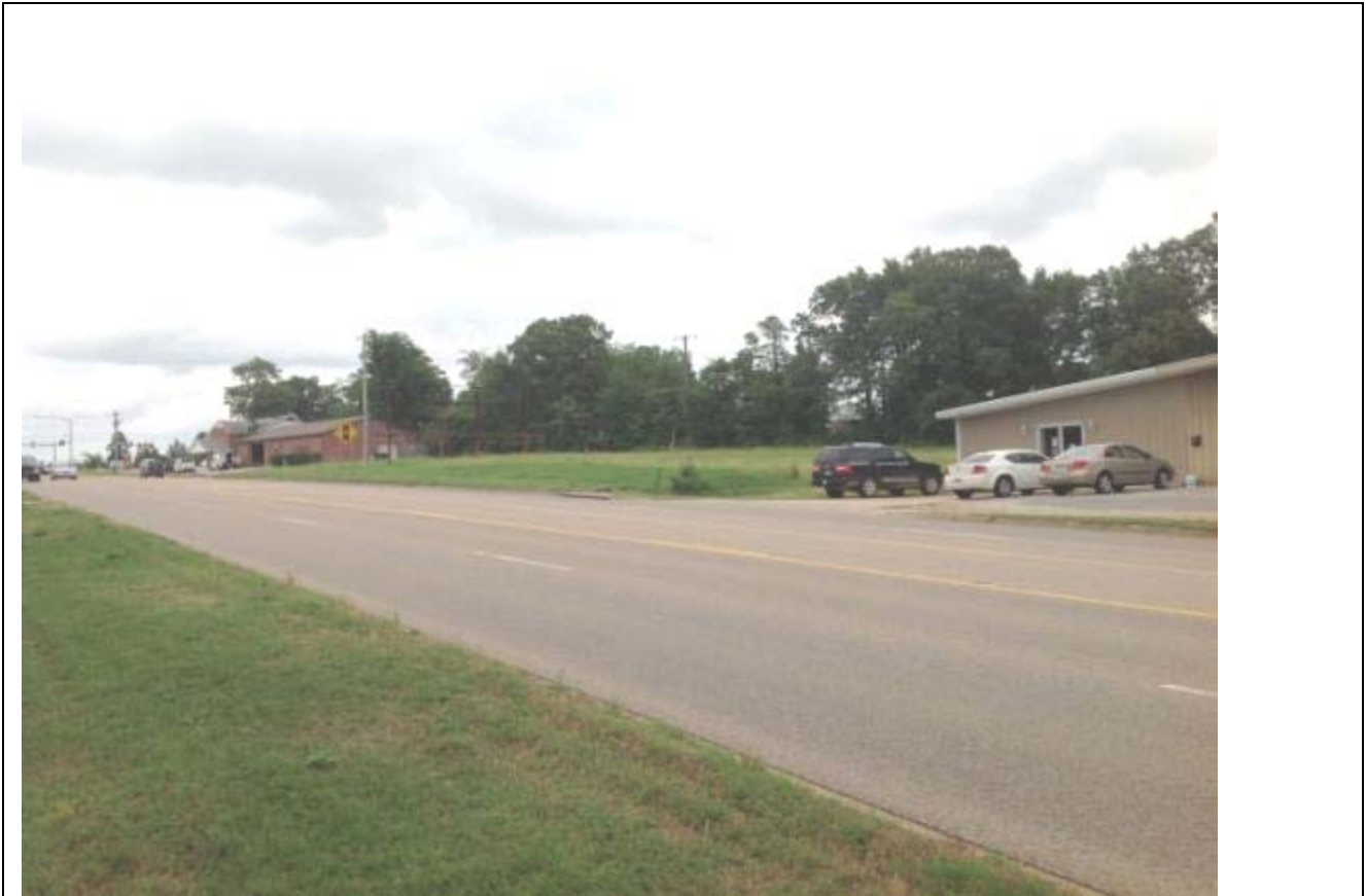
Undeveloped C-3 LUO property located east of site.