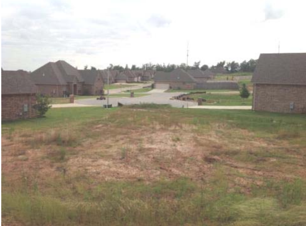
View looking west toward Meadow Wood Subdivision located west of site.