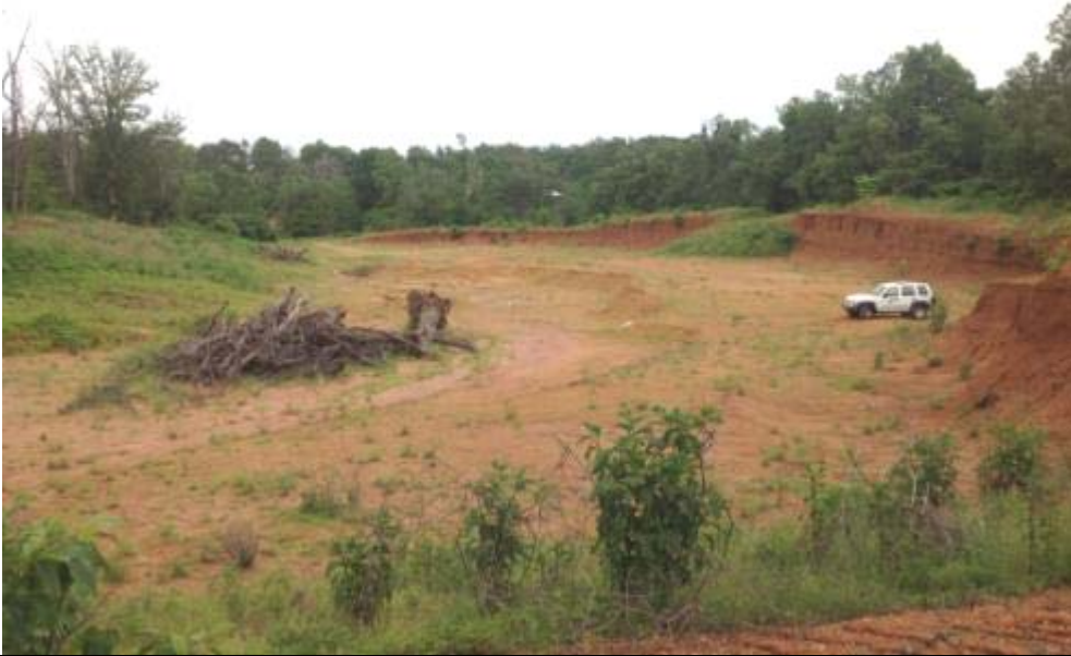
View from western portion of site looking east.