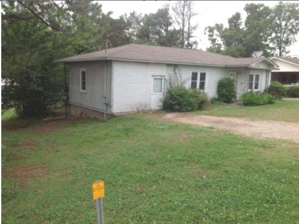
Residence on adjoining R-1 property located north of site.