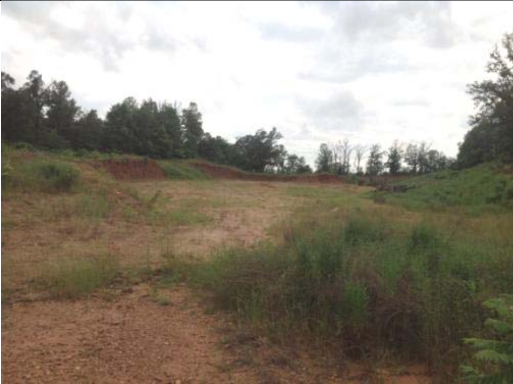
View from eastern portion of site looking west.