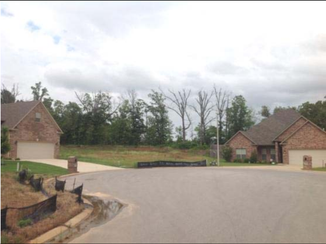
Western property boundary of site from Meadow Wood Subdivision located west of site.