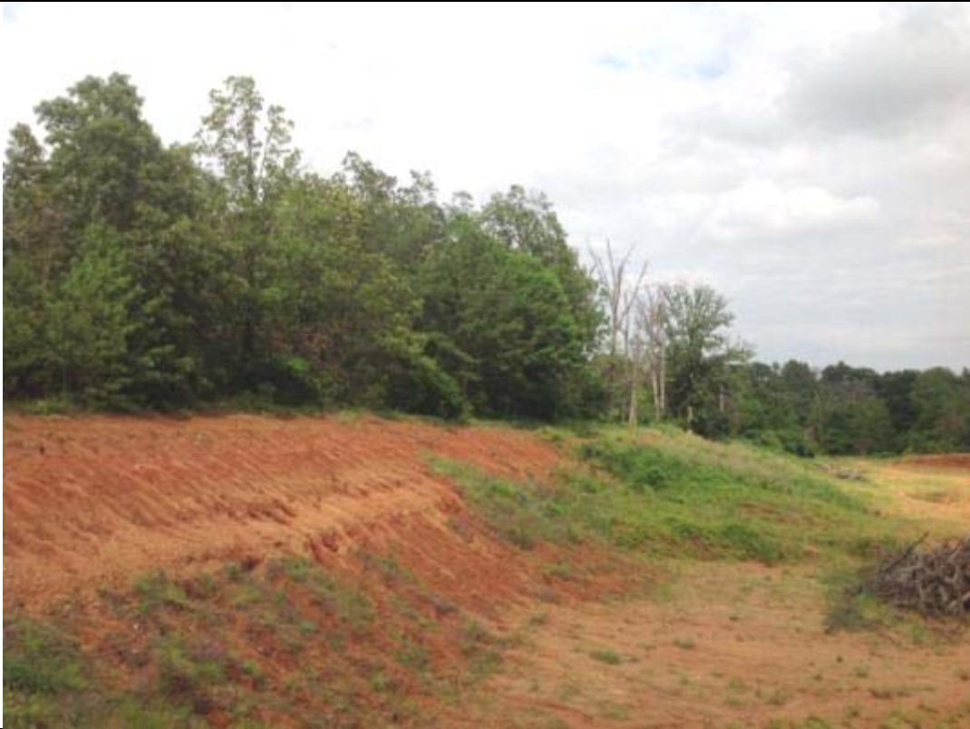
View of northern property boundary looking east.