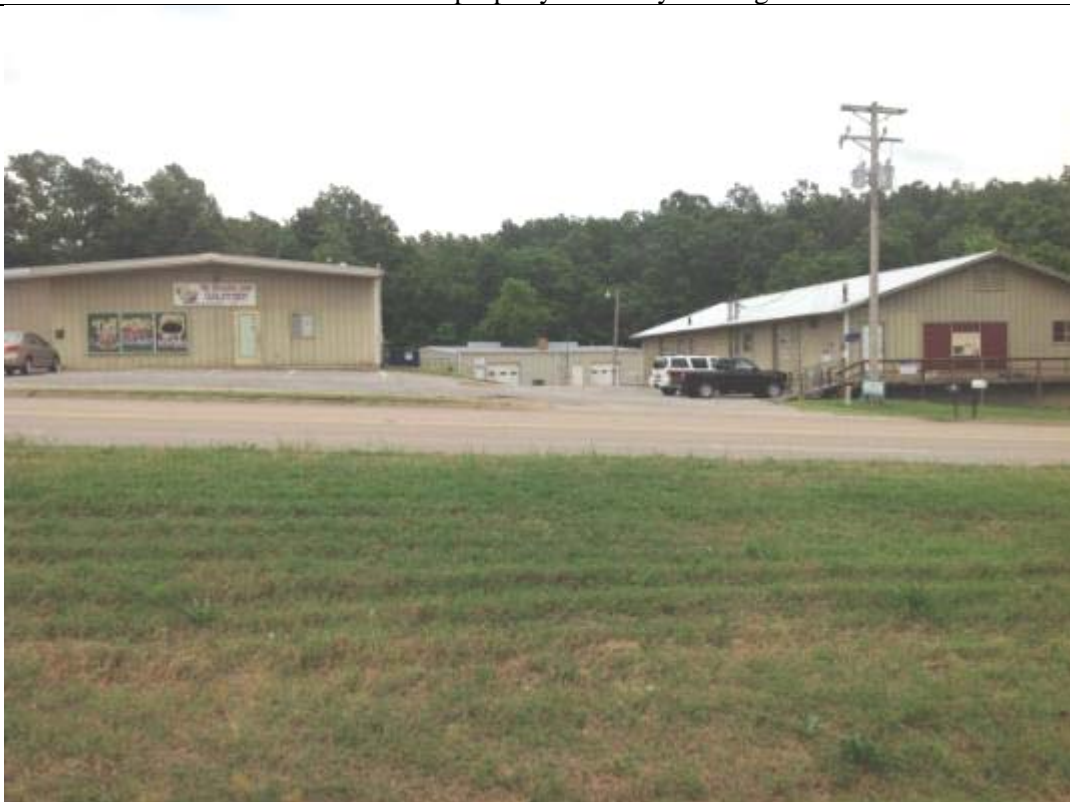
R-1 property located east of site. Jack's Treasures Flea Market, The Treasure Hunt Flea Market, and a body shop to the rear.