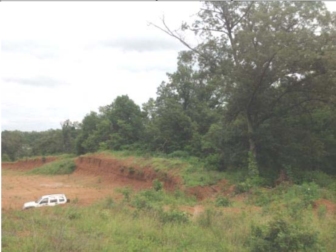
View of southern property boundary looking east.