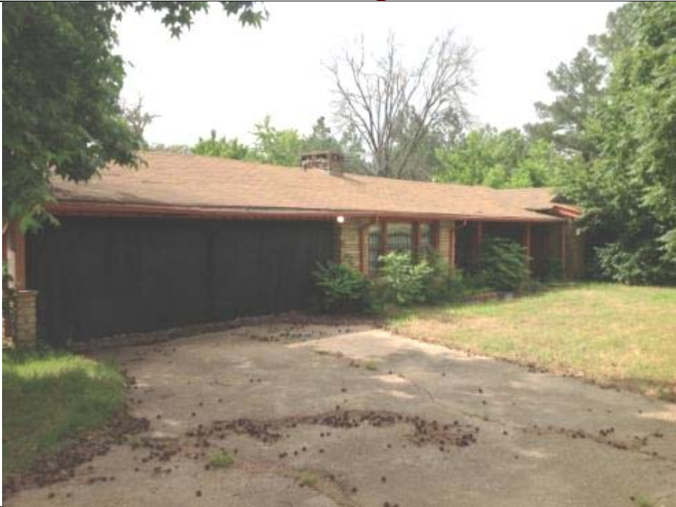
Existing residence on site.