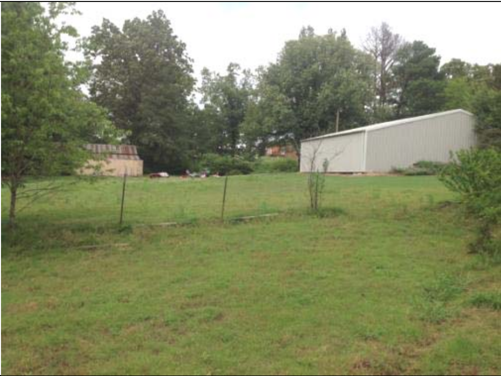
Outbuildings located behind residence on adjoining R-1 property located north of site.