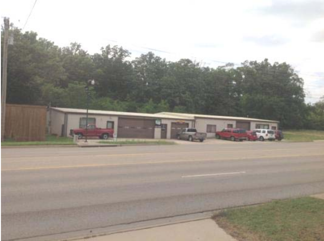
Adjoining C-3 property located south of site. NEA Batteries and McKisson Rentals.