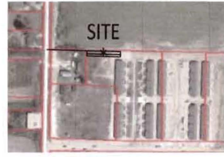
VICINITY MAP (NOT-TO-SCALE)