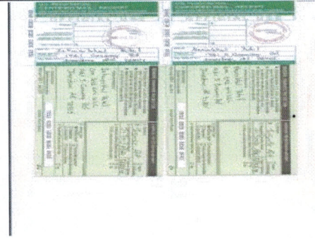
photo taken: 06/02/2014 - Certified_mail_receipt200Certified_mail_receipt.jpg