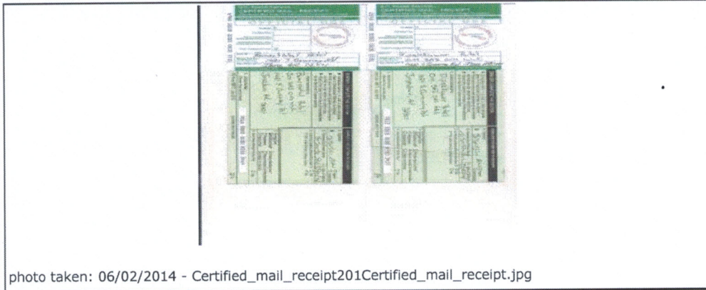
photo taken: 06/02/2014 - Certified_mail_receipt201Certified_mail_receipt.jpg

City of Jonesboro Code Enforcement File # 1421 S Caraway Road