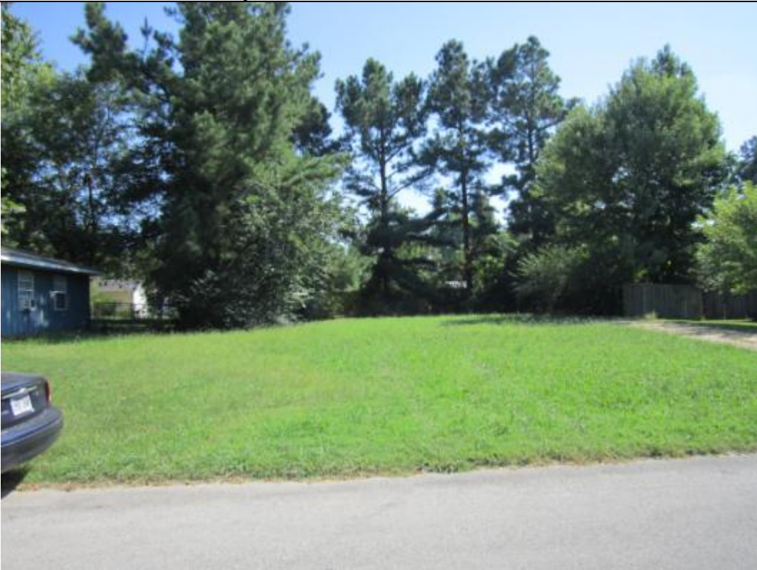
Vacant property located east of site.