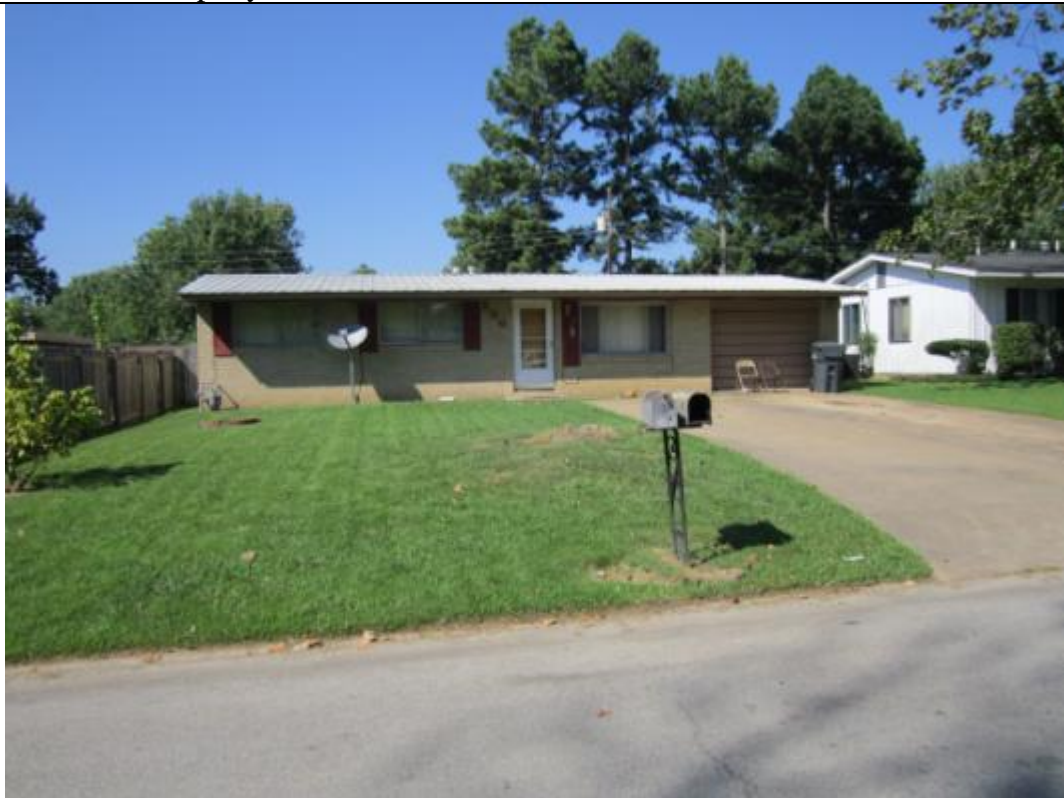
Property located south of site at 300 West Roseclair St.