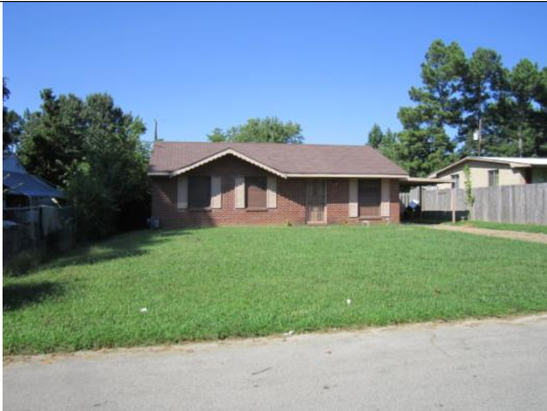
Property located southwest of site at 304 West Roseclair St.