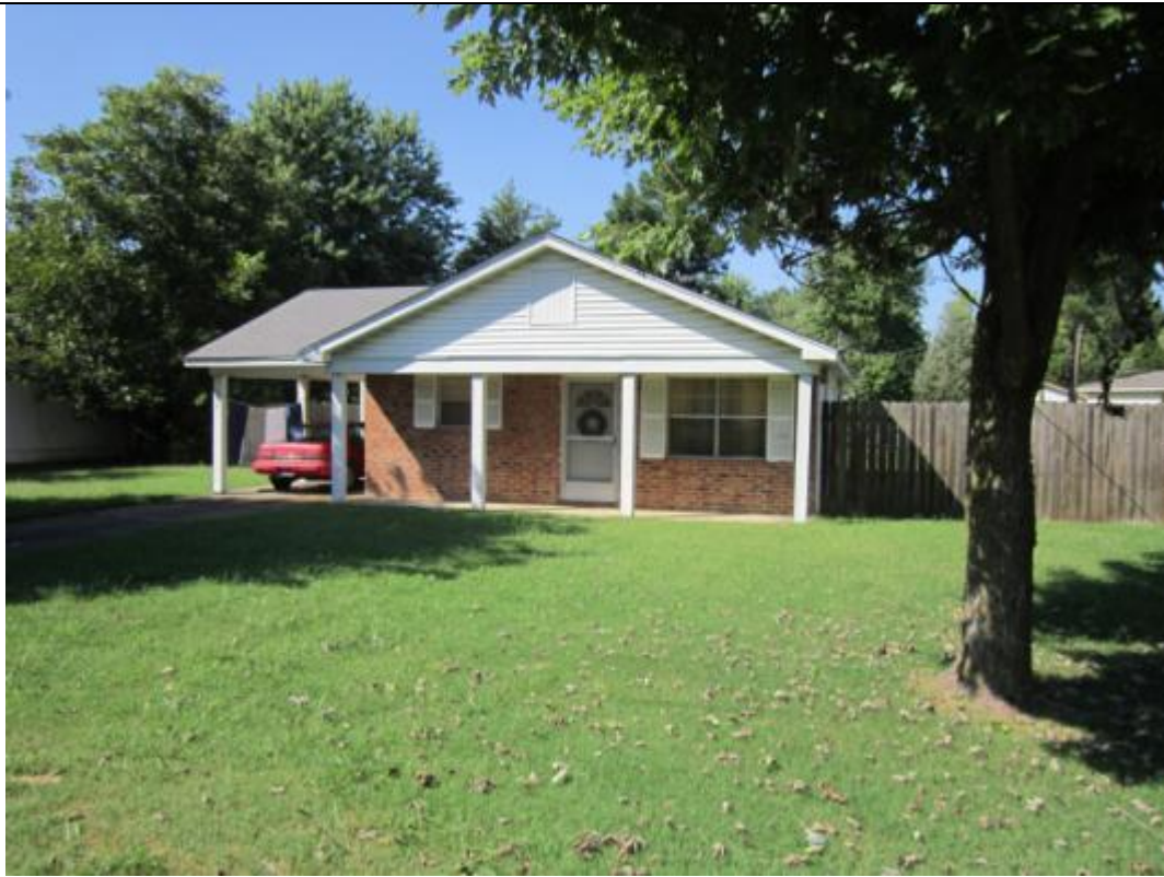
Property located northwest of site at 308 Gilbert St.