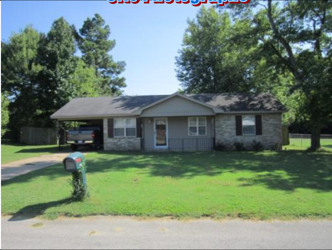
Subject site located at 305 Gilbert St.