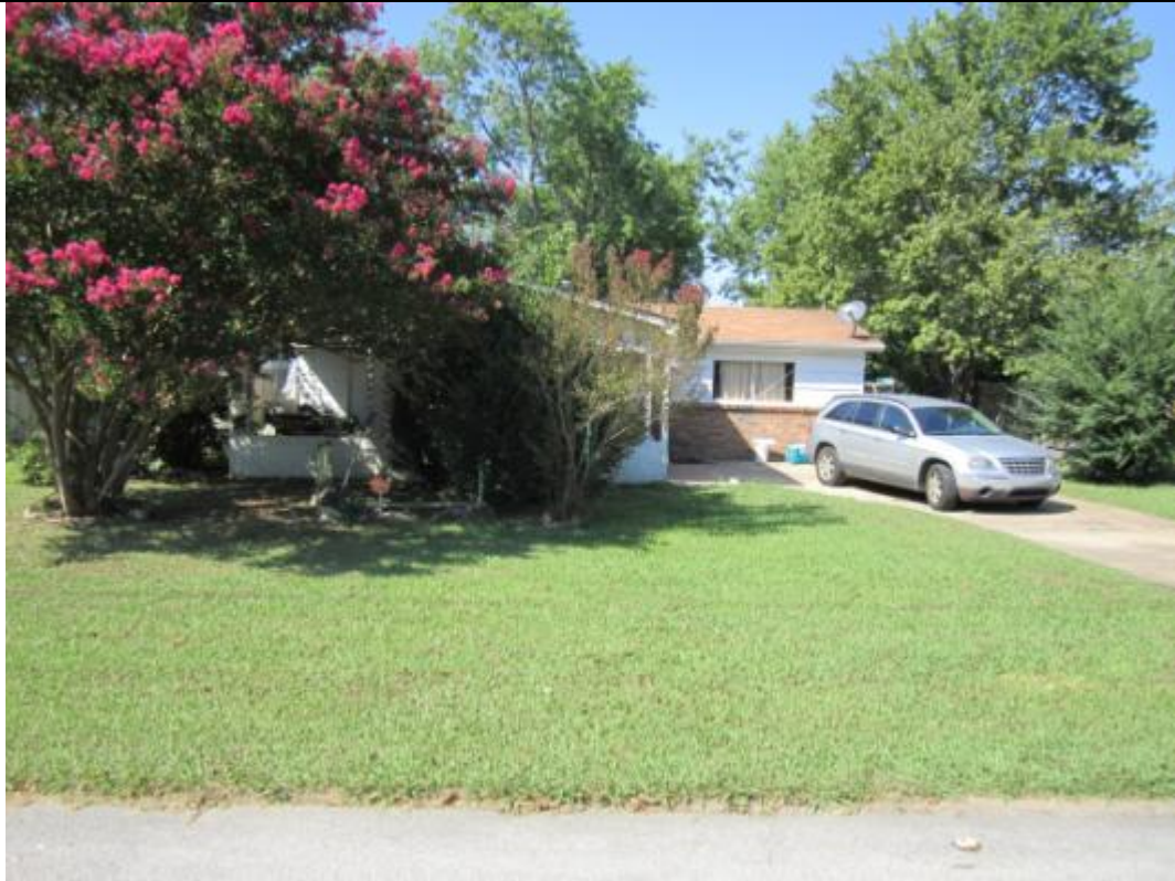
Property located northeast of site at 300 Gilbert St.