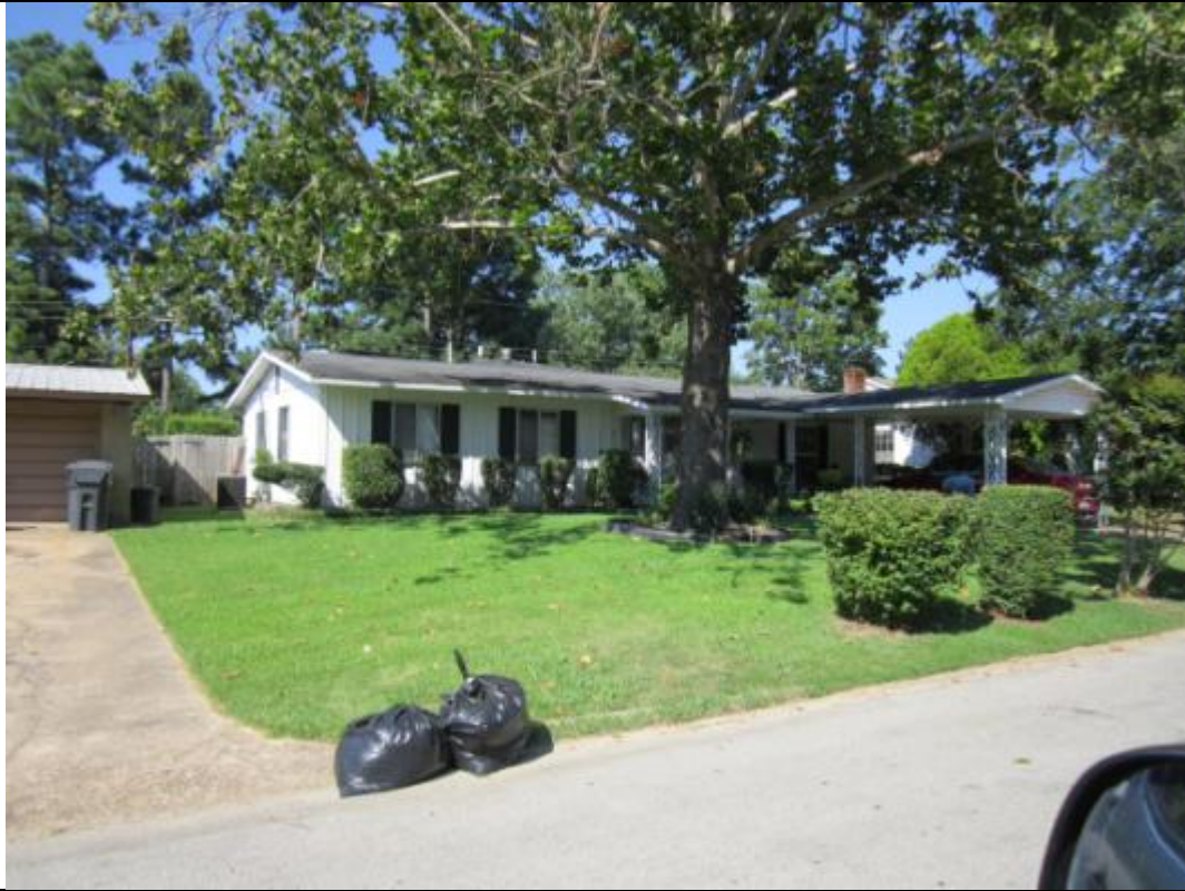
Property located southeast of site at 214 West Roseclair St.