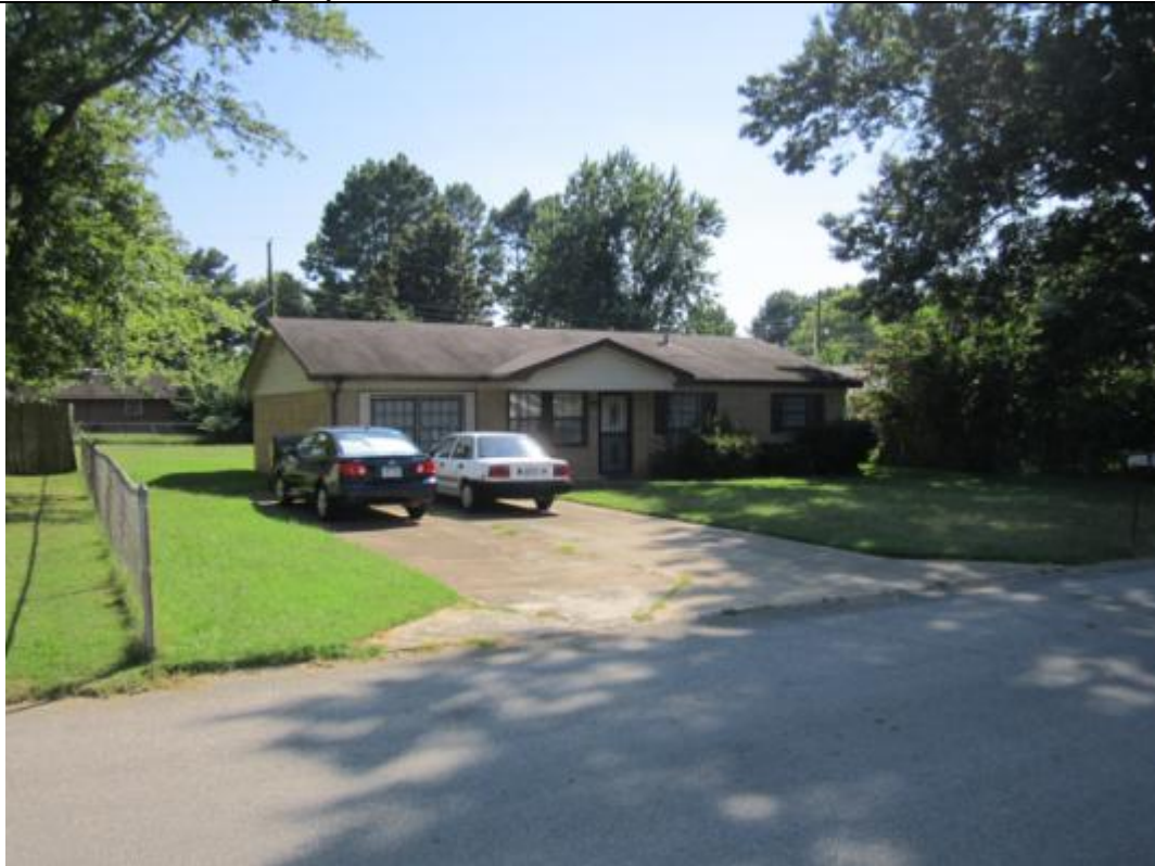
Property located west of site at 309 Gilbert St.