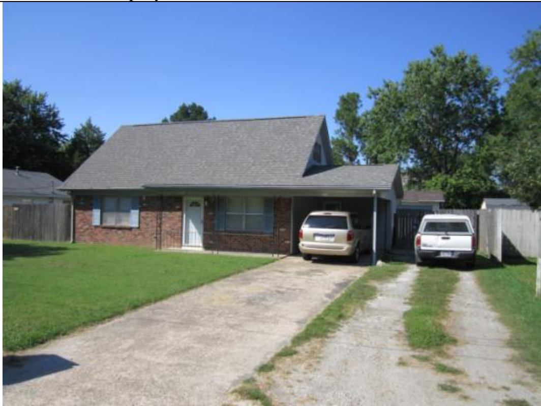
Property located north of site at 304 Gilbert St.