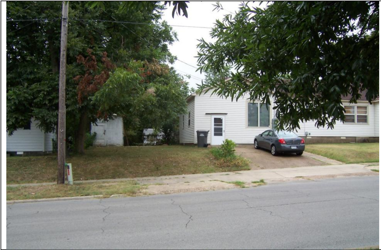
View of subject property.