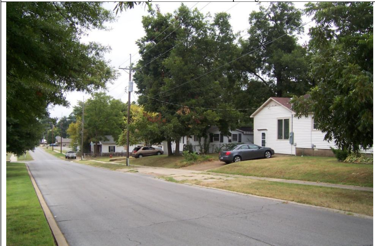
View looking east of subject property.