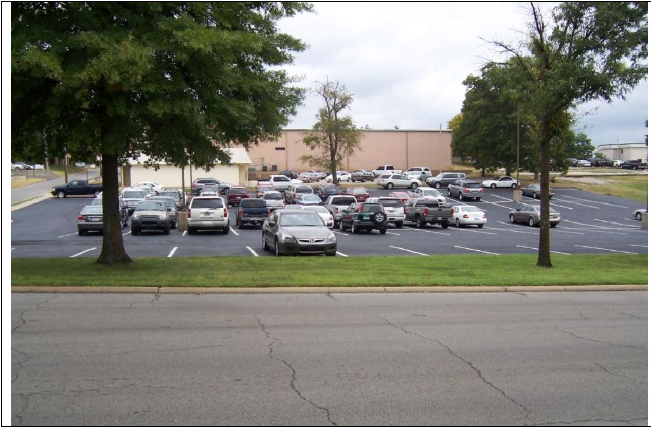
View looking north of St. Bernard's parking lot.