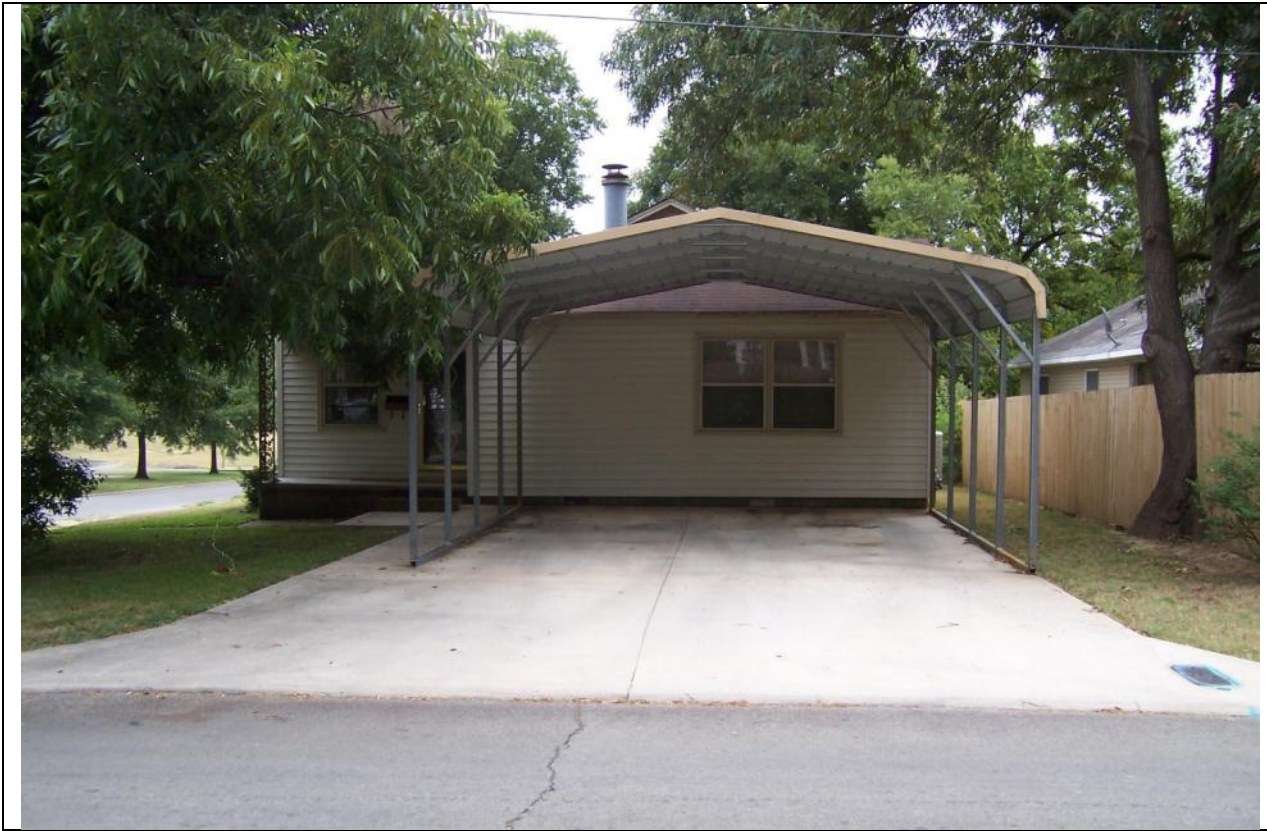
View of subject property (Cobb St.)