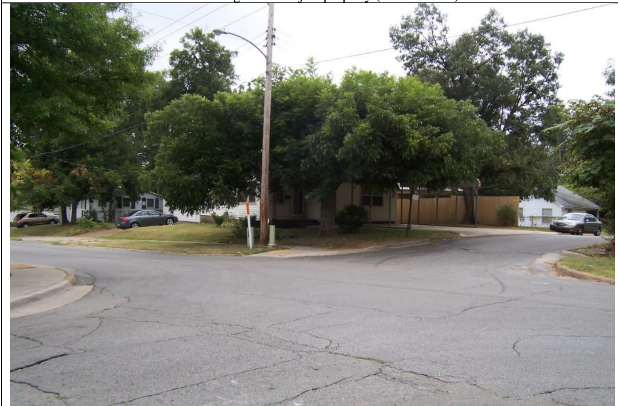
View looking southeast of subject property.