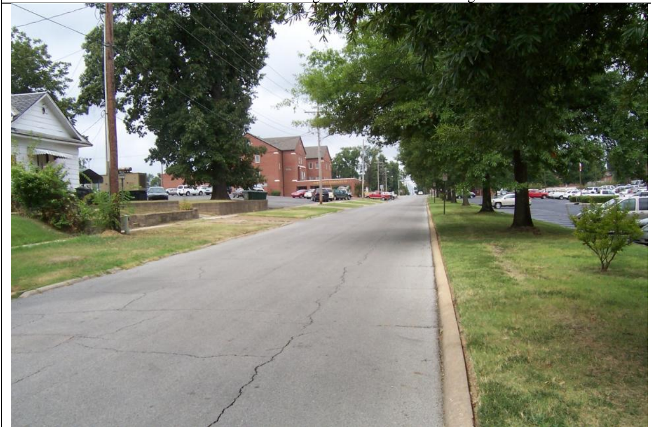
View looking west along Oak Street.