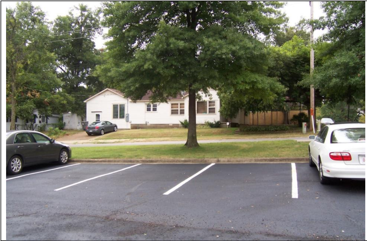
View looking at the subject property (Oak St. view)