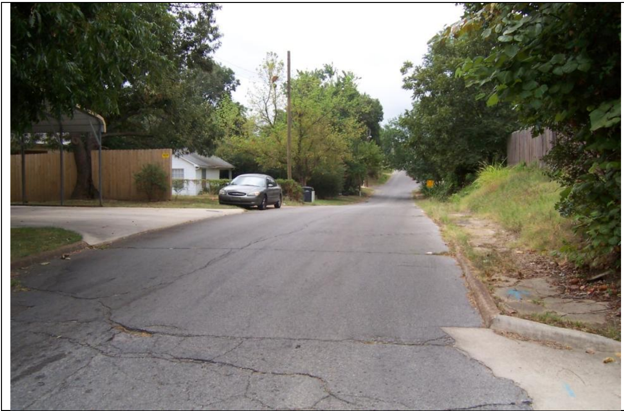
View looking south along Cobb St. of property frontage.