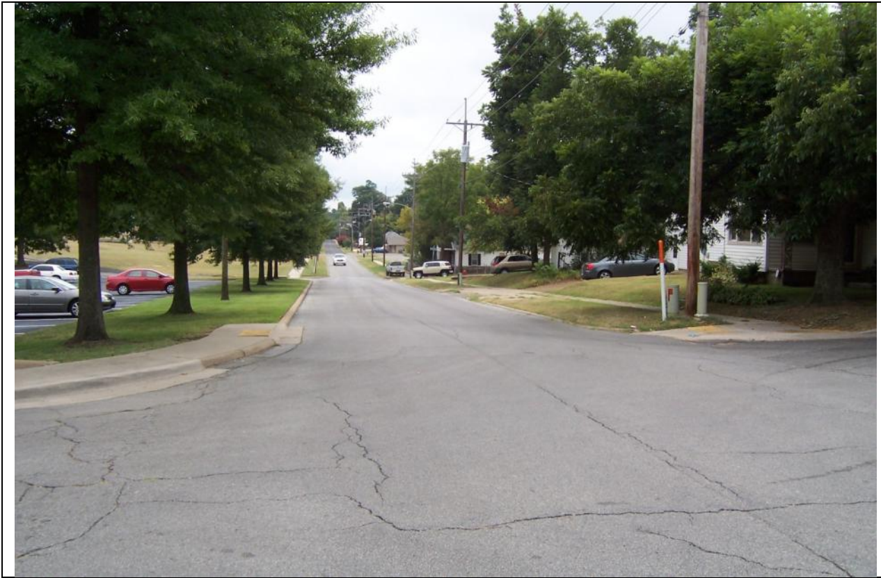
View looking east along subject site street frontage.