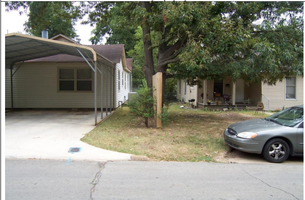
View of abutting property on Cobb St.