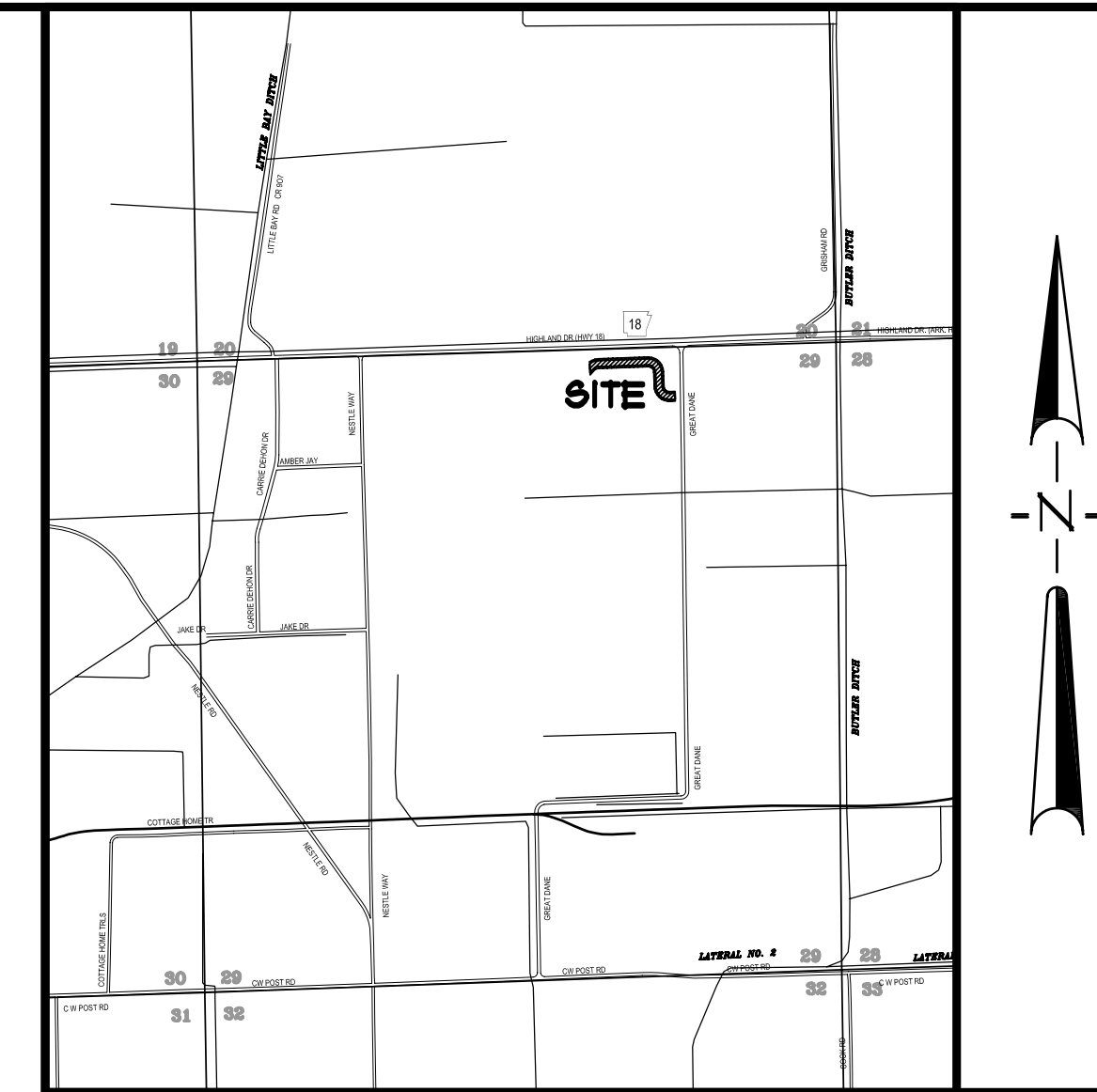
VICINITY SKETCH NOT TO SCALE