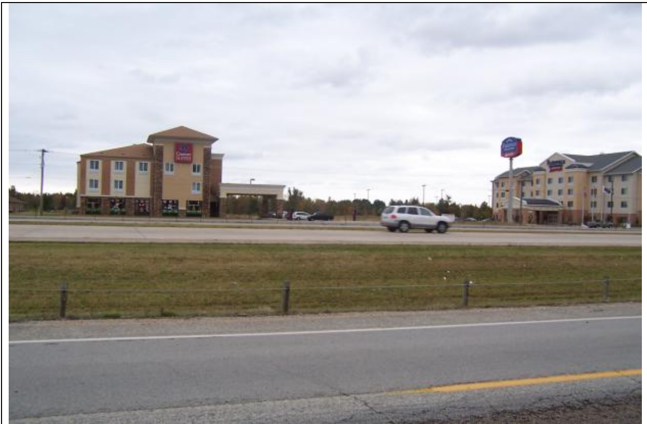
View looking north across from subject property.