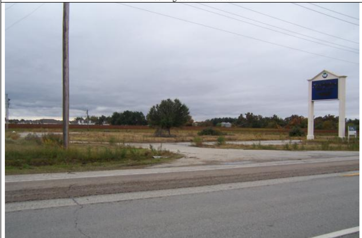
View looking south towards site.