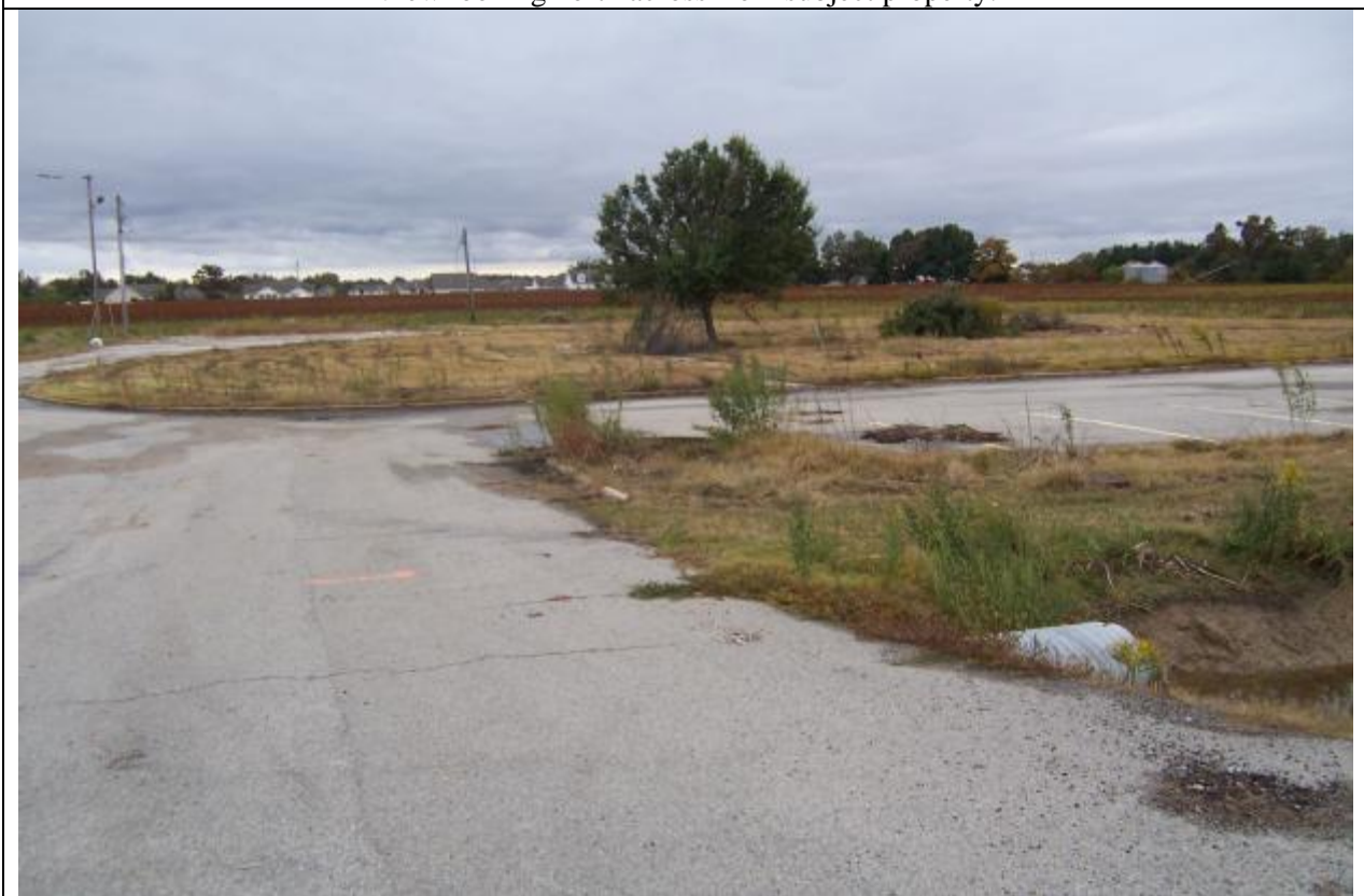
View looking south depicting interior parking and driveways.