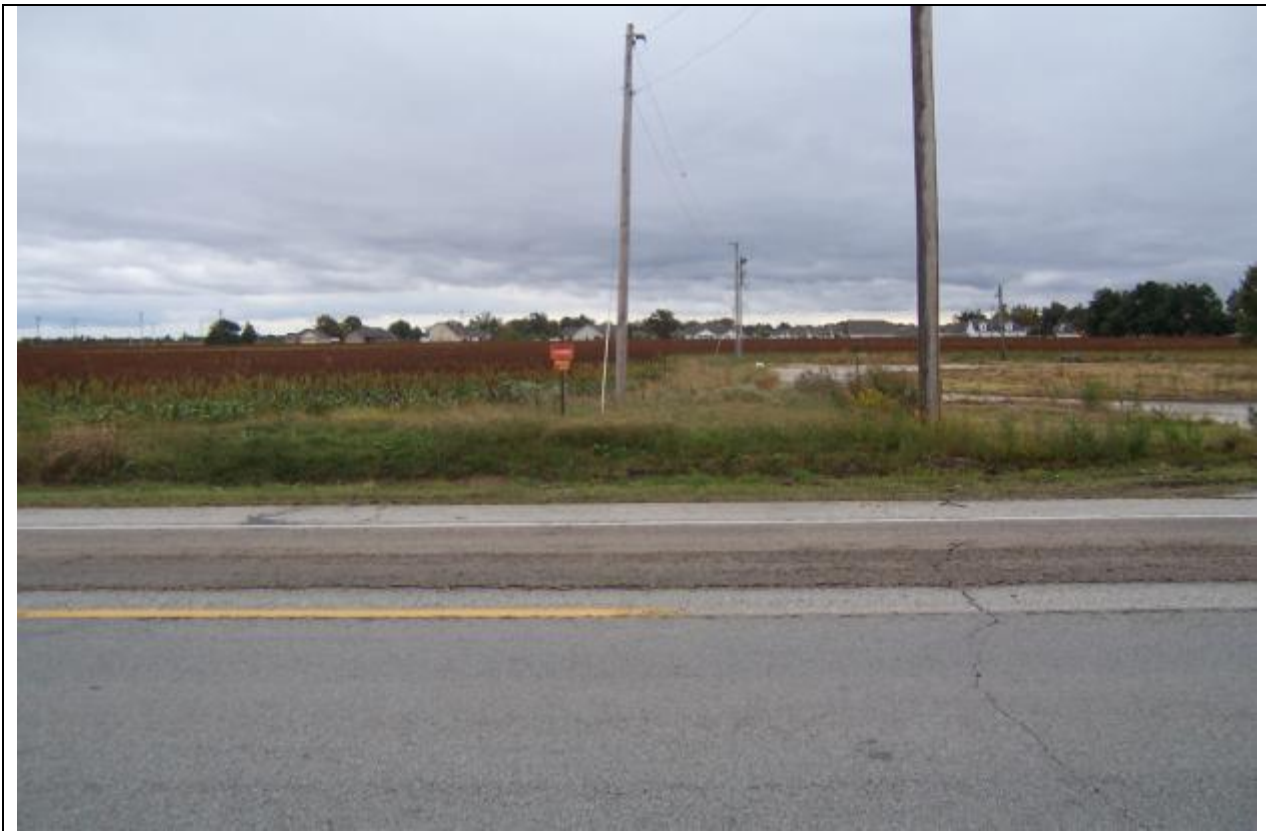
View looking south at the site.