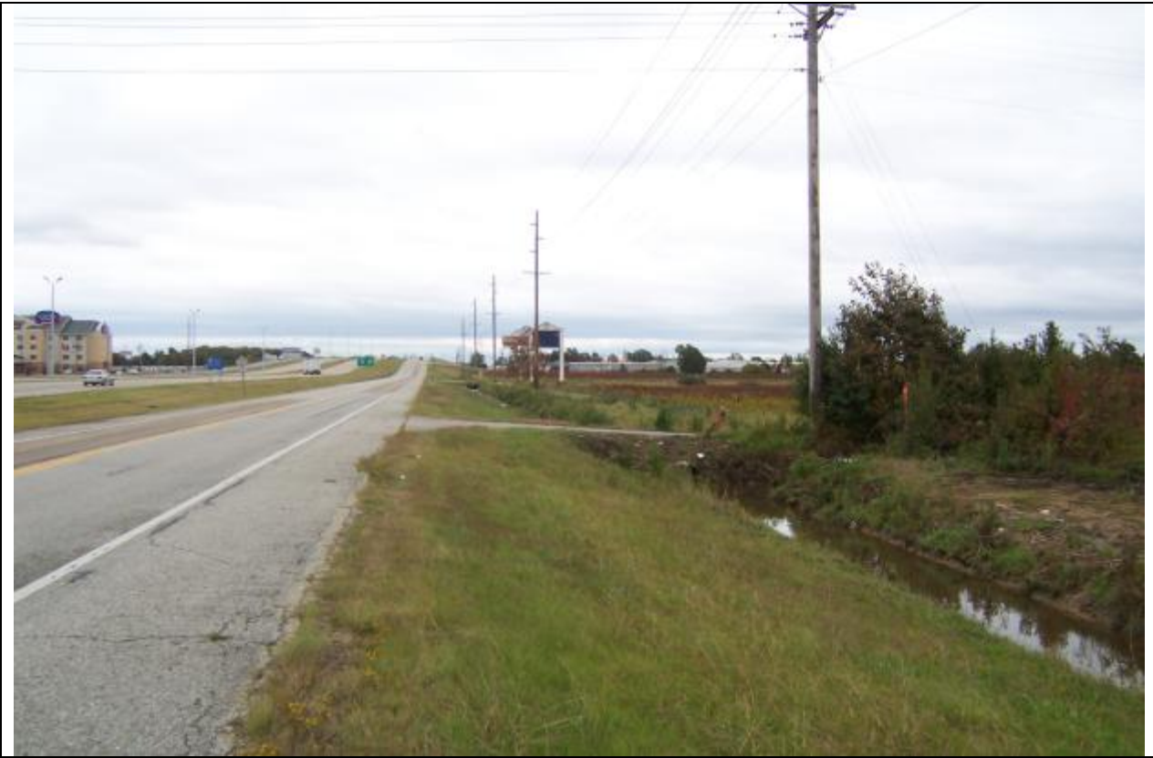
View looking east along frontage of the site.