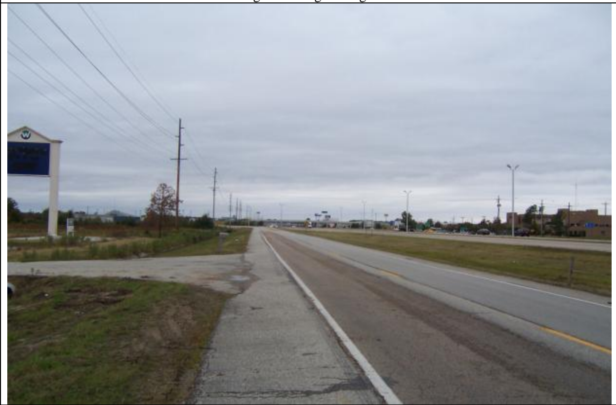
View looking west along Parker Rd.