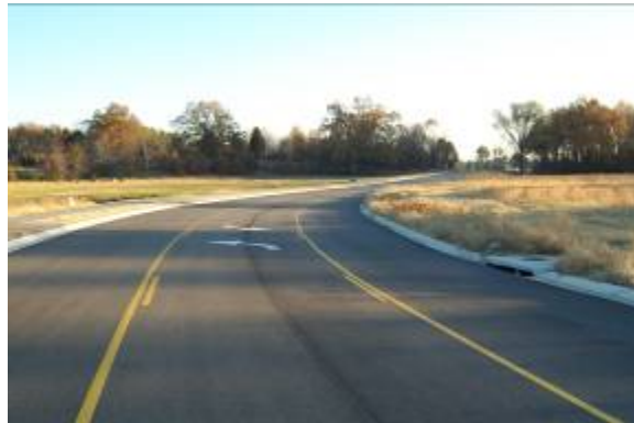
View looking Northwest on Christian Valley Dr.