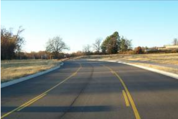
View looking Northwest on Christian Valley Dr.