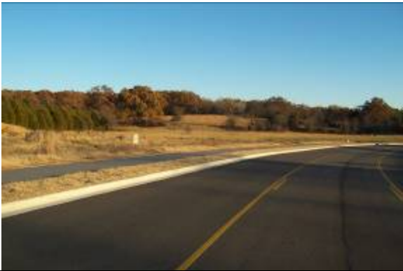
View looking Southeast on Christian Valley Dr. (CVD)