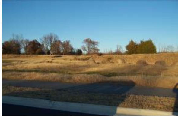
View looking East on Christian Valley Dr.