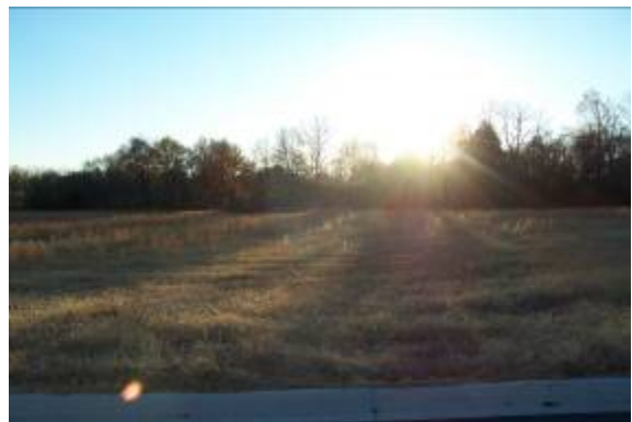
View looking Southwest - Christian Valley Dr.