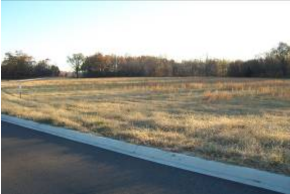
View looking Northeast-Christian Valley Dr.