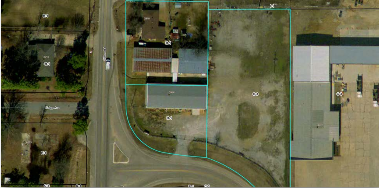
Enlarged Aerial View of Site