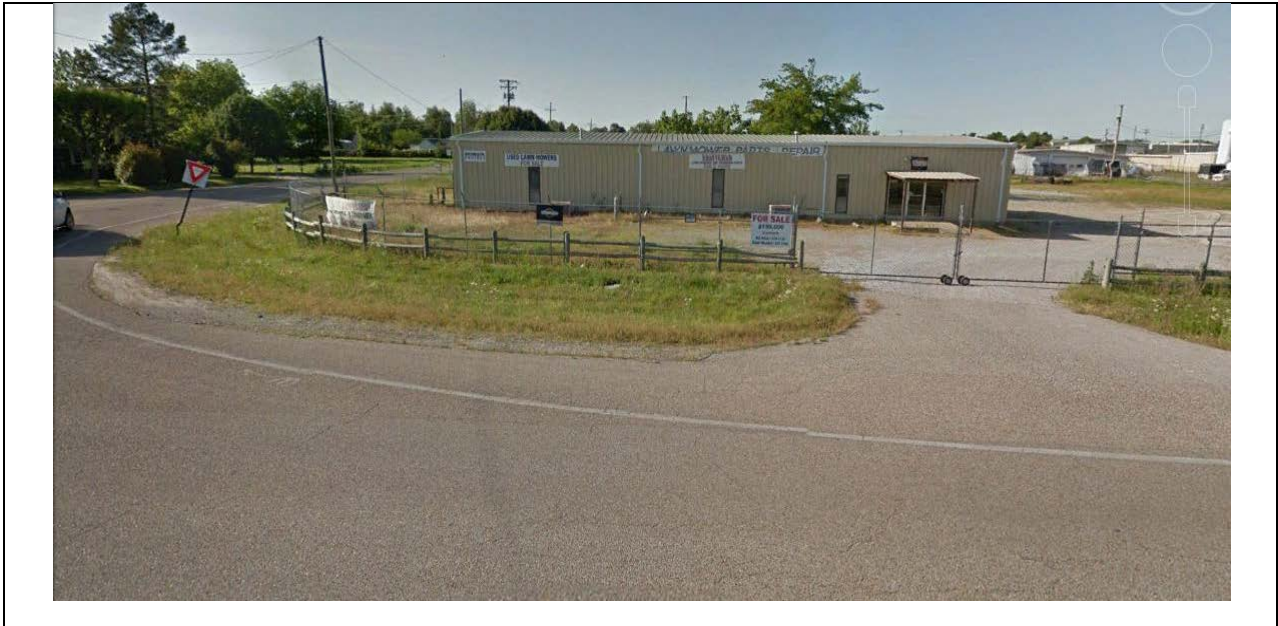
View looking south towards Site