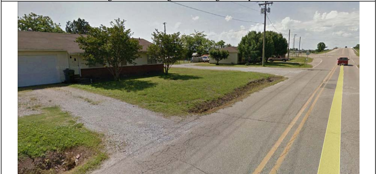
View looking Southeast toward Homes North of the Site