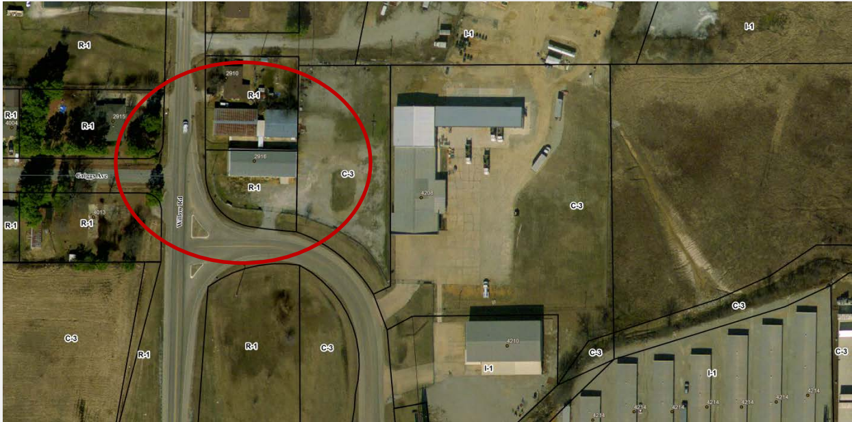
Vicinity & Zoning District Map