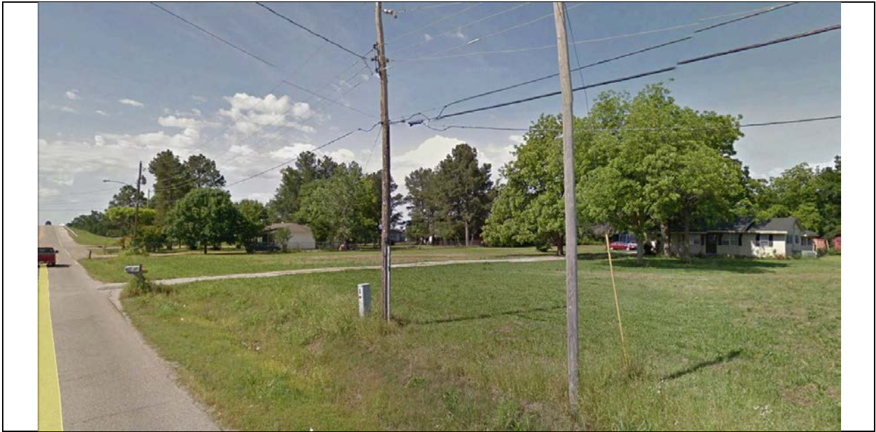
View looking Southwest along Willow, Single Family across the Street