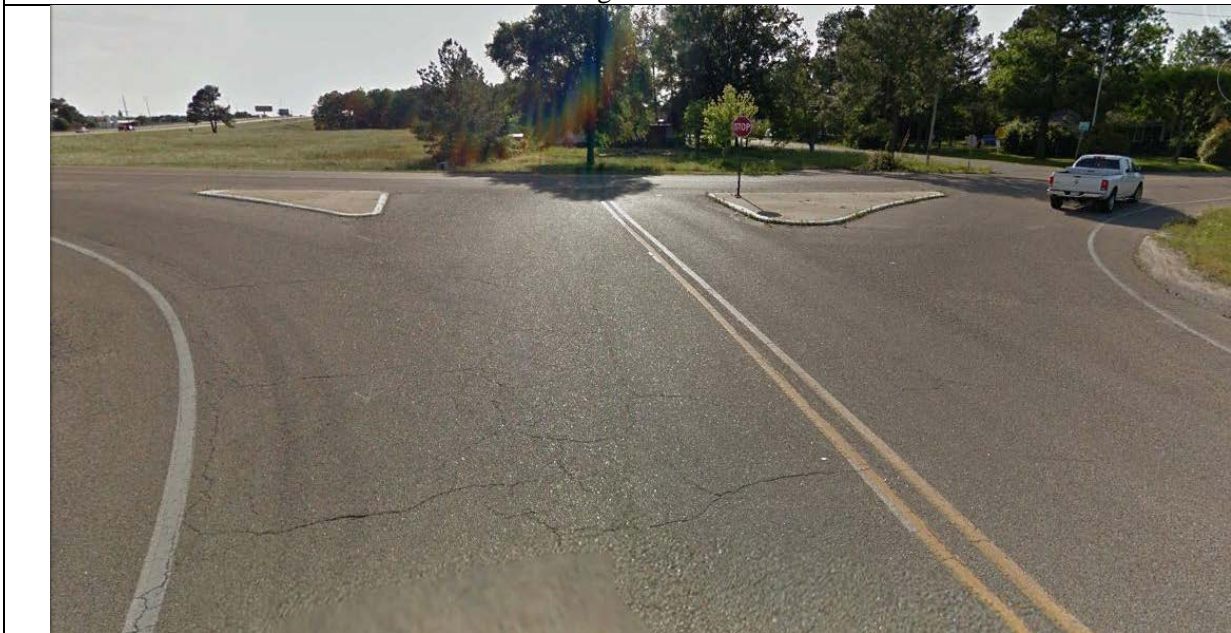
View looking West toward Willow Rd.