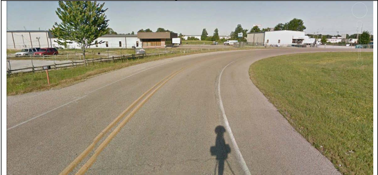
Site looking East from Ramp