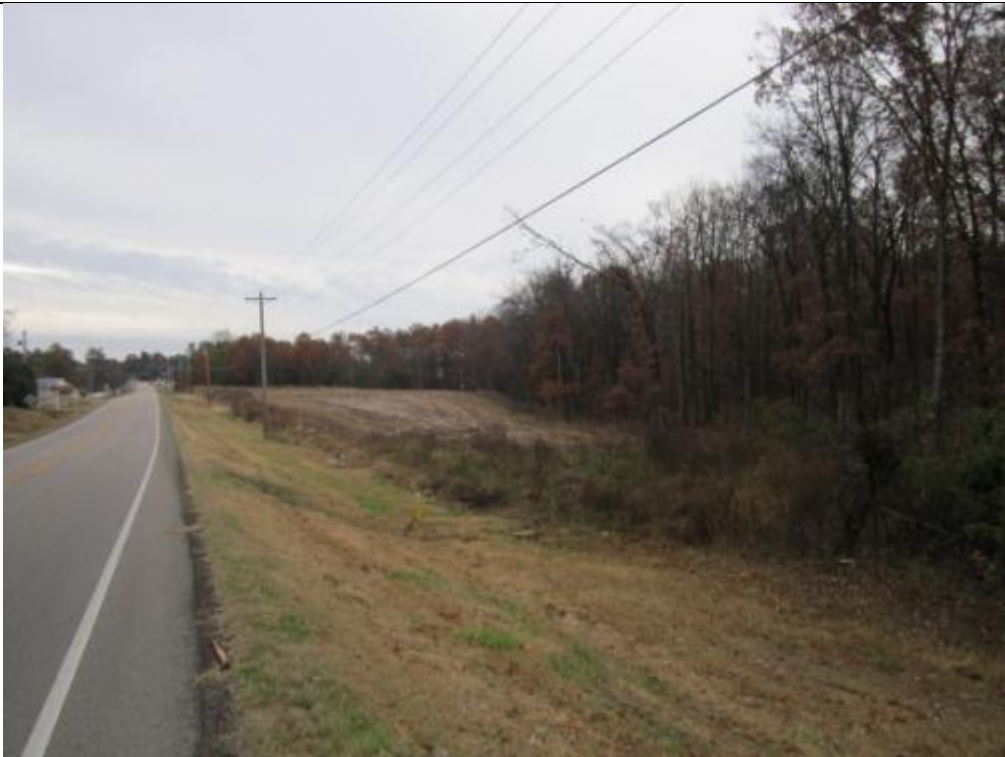
View of C-3 L.U.O. property located to the west of subject site.