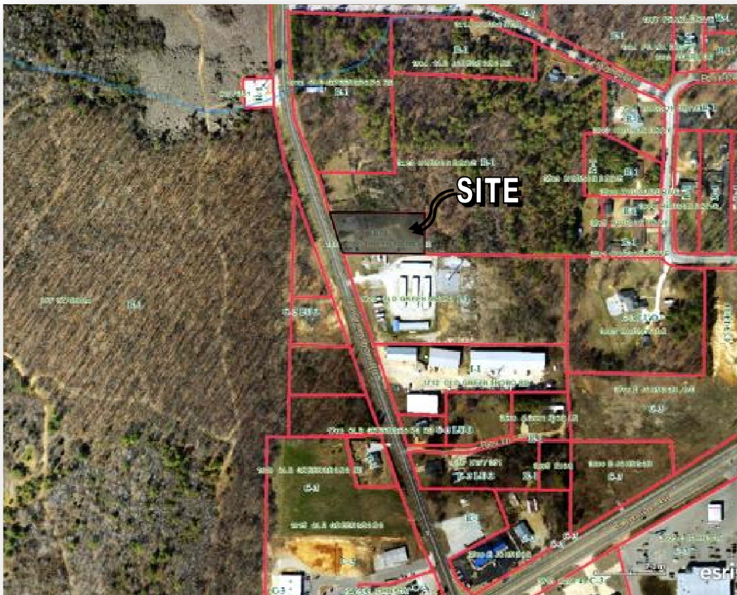
Vicinity Zoning Map