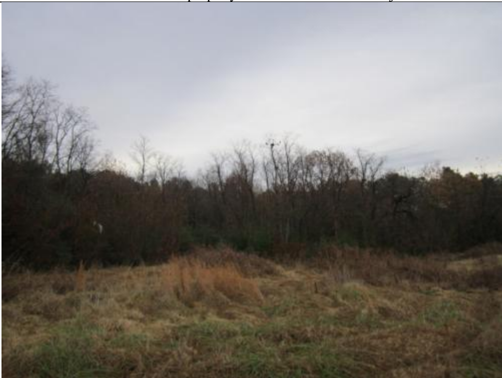
View looking east from subject site toward R-1 property located to the north and east of subject site.