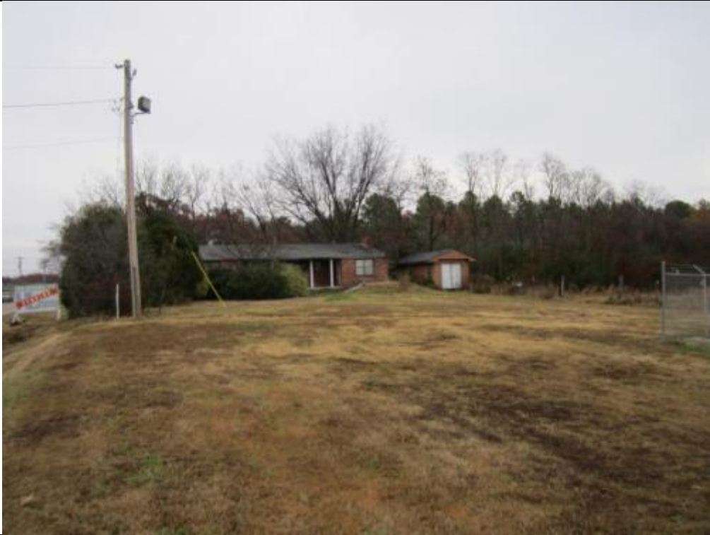
View looking north toward subject site.