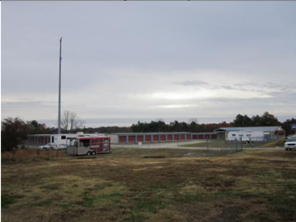
View looking southeast from subject site toward I-1 property located to the south.