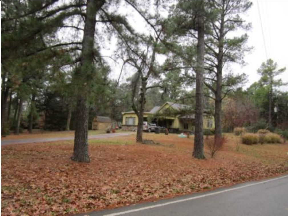
View of the Hudson Dr. frontage for the R-1 property located north and east of the subject site.