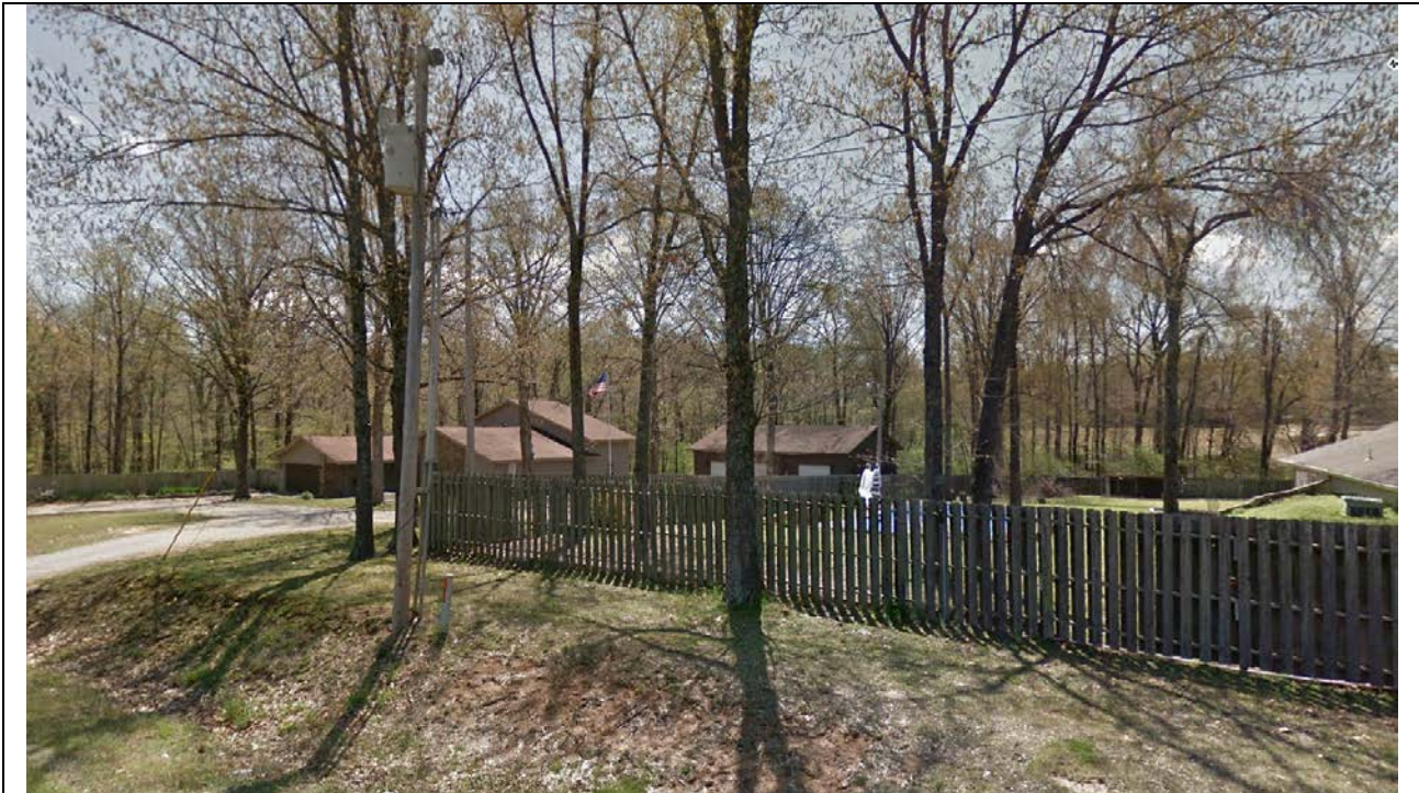
View to the West