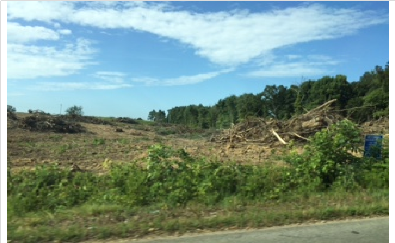
View of the Property