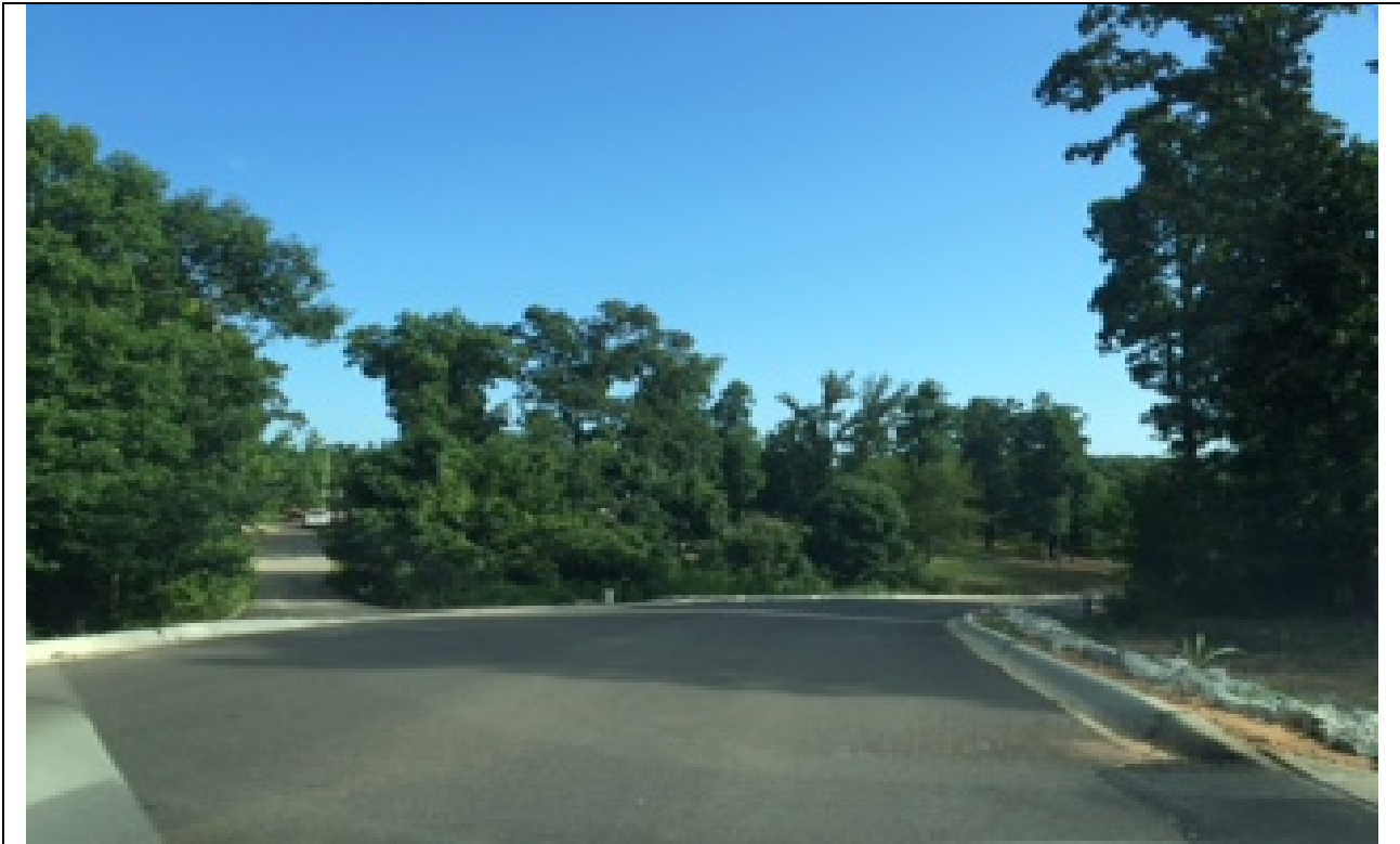
Second access to Sage Meadows – located to the West of the proposed property annexation