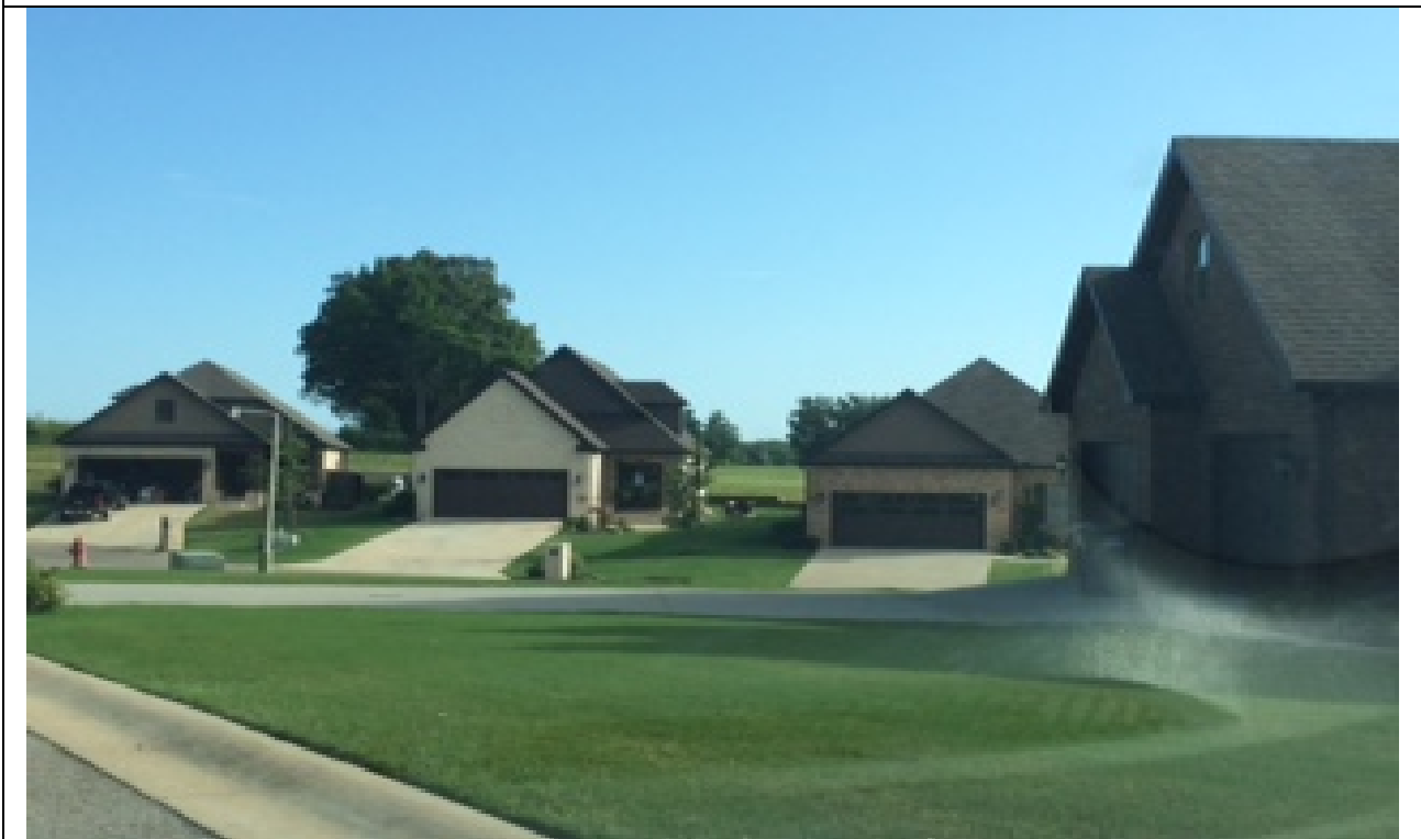
Sage Meadows neighborhood located North of the property