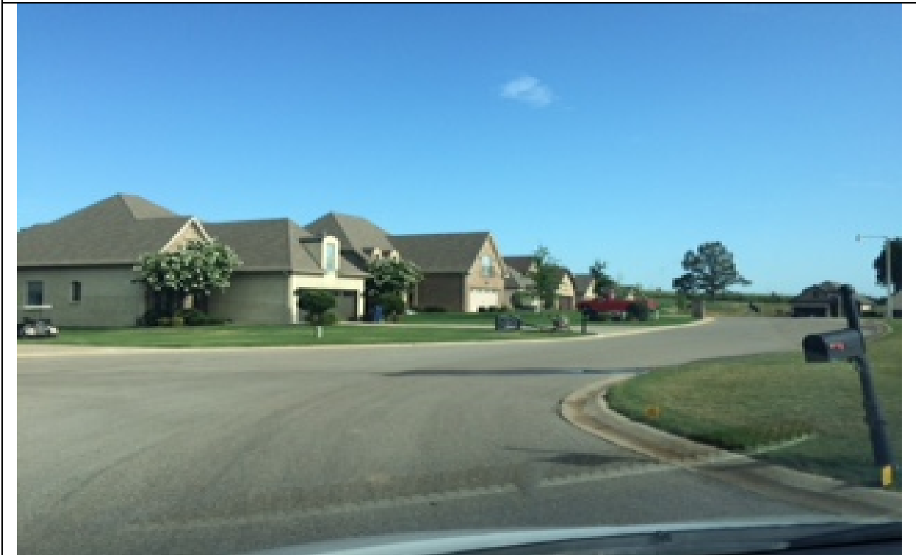
Another section of Sage Meadows located North of the property