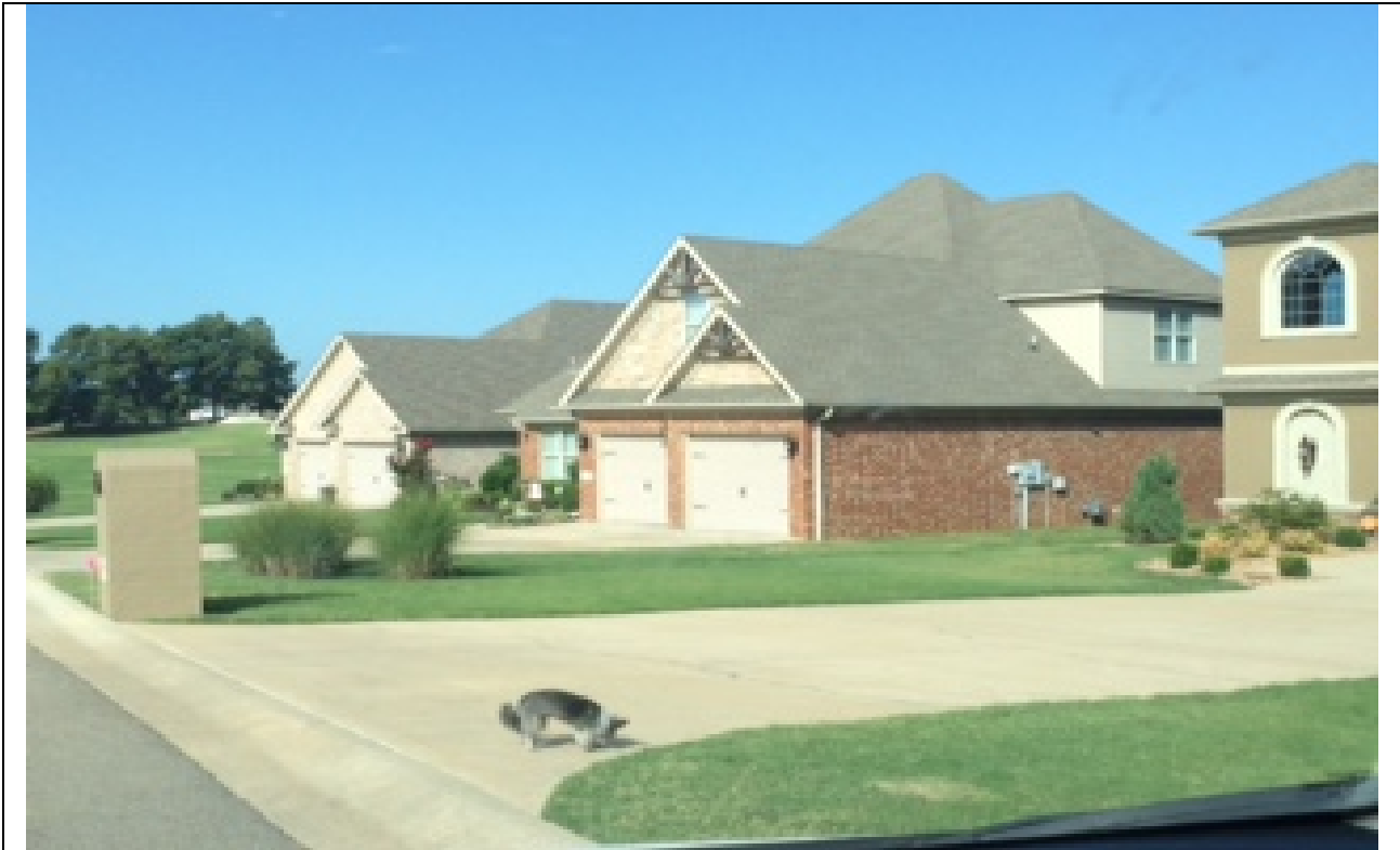
Sage Meadows neighborhood located North of the property