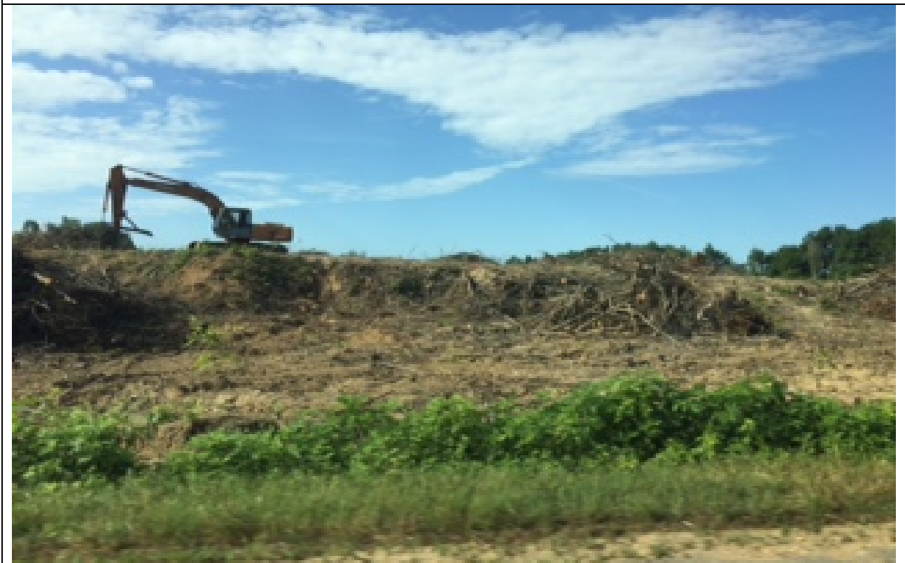
View of the Property