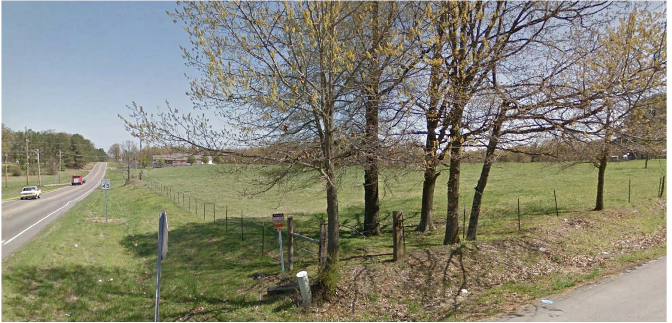
View looking North