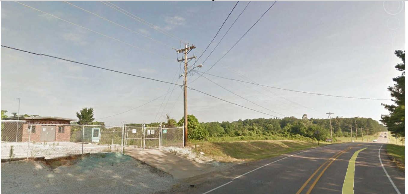
View looking West