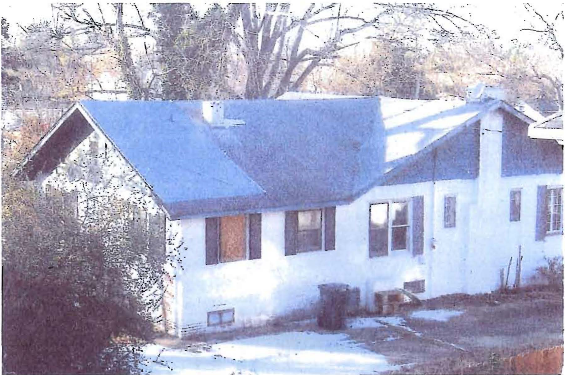
View from my home