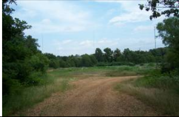
View of abutting property at entrance (East)