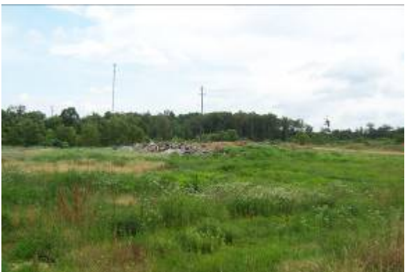
View looking Northeast on site