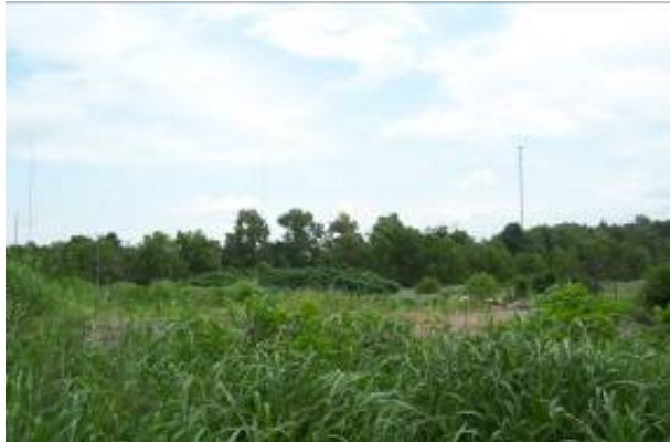
View looking North at Entrance/Casey Springs