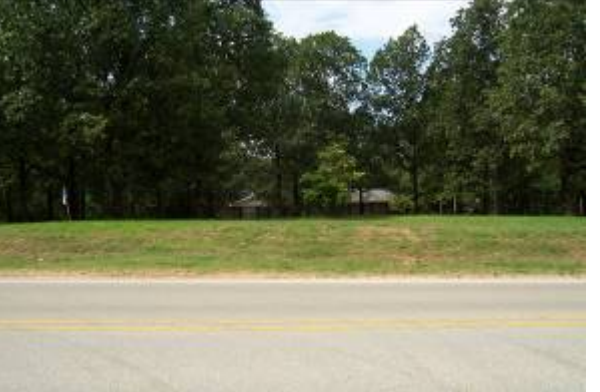
View looking East on site