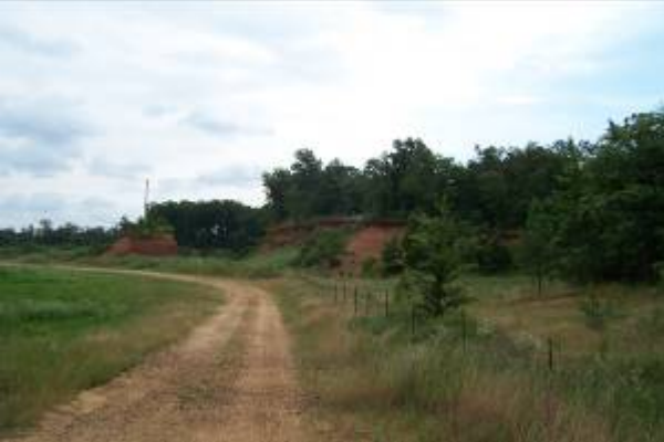
View looking East on site