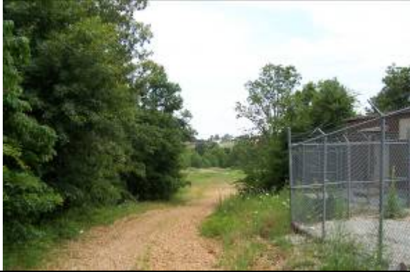
View looking North at Entrance/Casey Springs