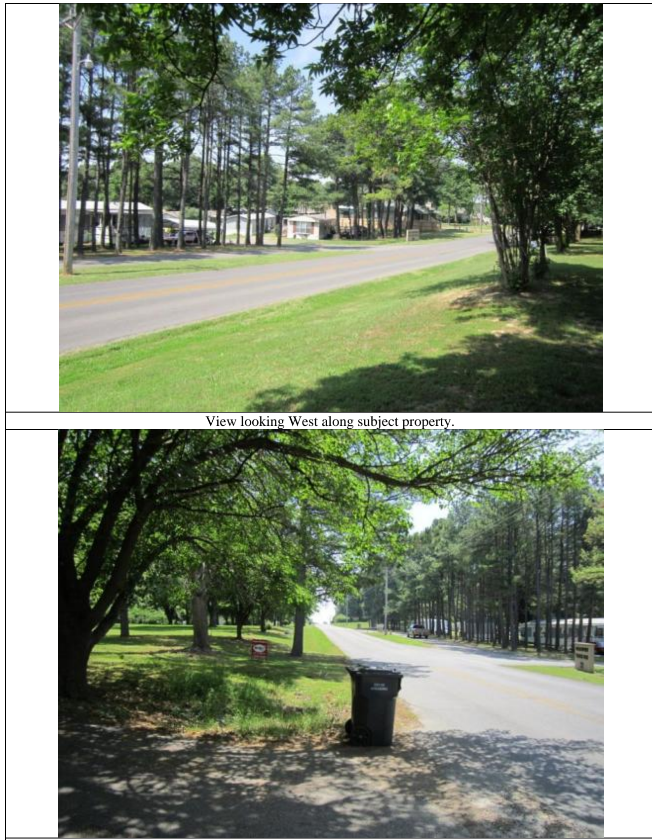
View looking East towards Paragould Dr. subject property to the left.