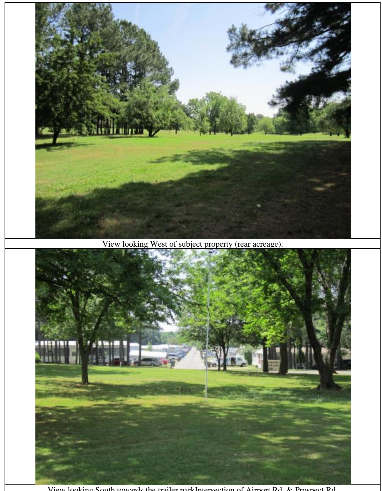
View looking South towards the trailer parkIntersection of Airport Rd. & Prospect Rd.