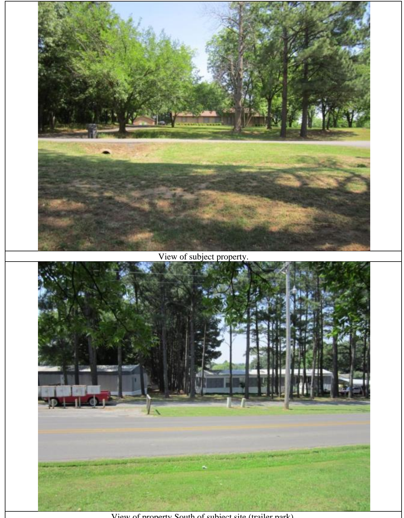
View of property South of subject site (trailer park).