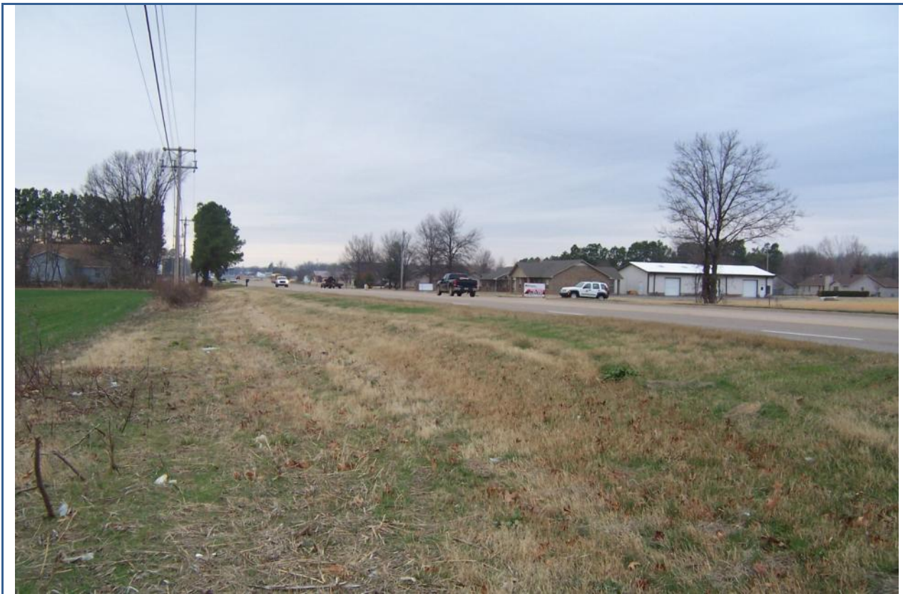
View looking West along South side of Hwy 49S, Site to the right