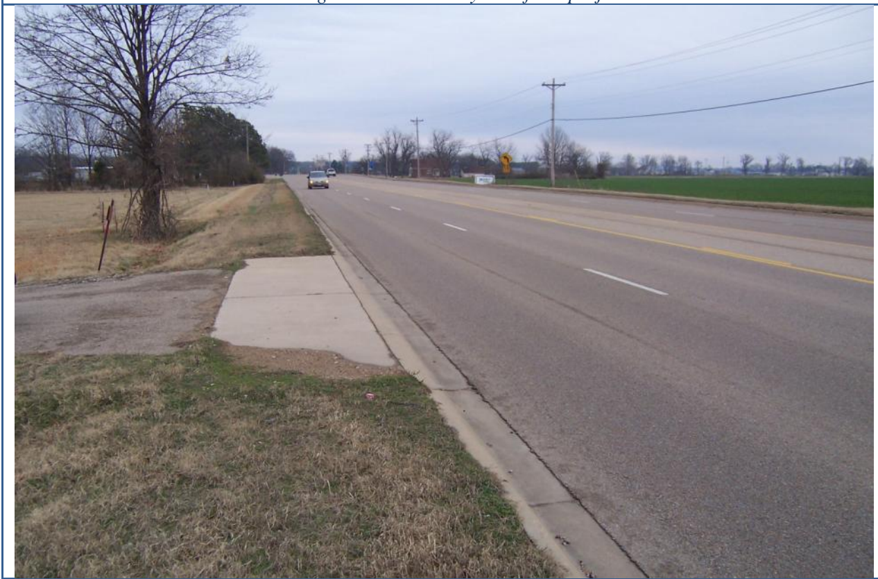
View looking North in between existing structures on subject property..