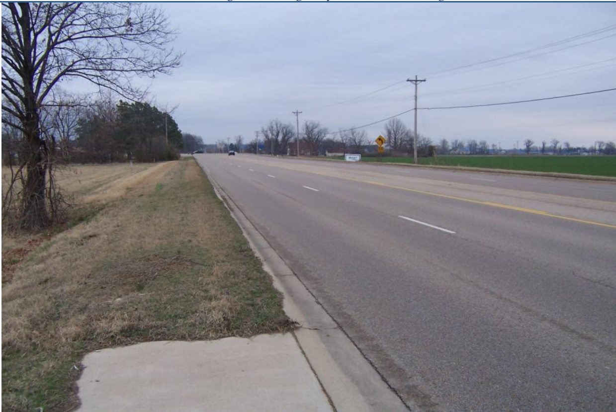
View looking East along Hwy 49S, Site to the left