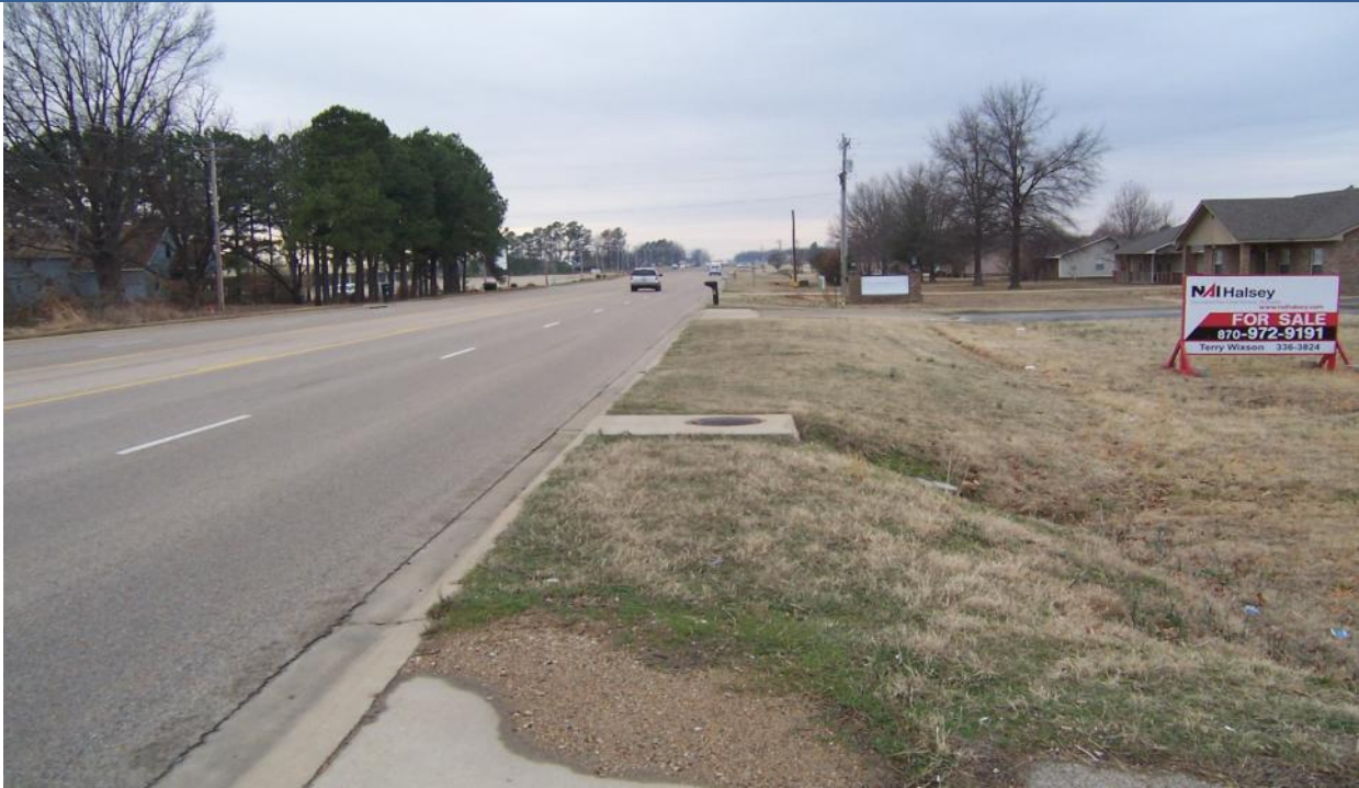
View looking West along Hwy 49S, Site to the right