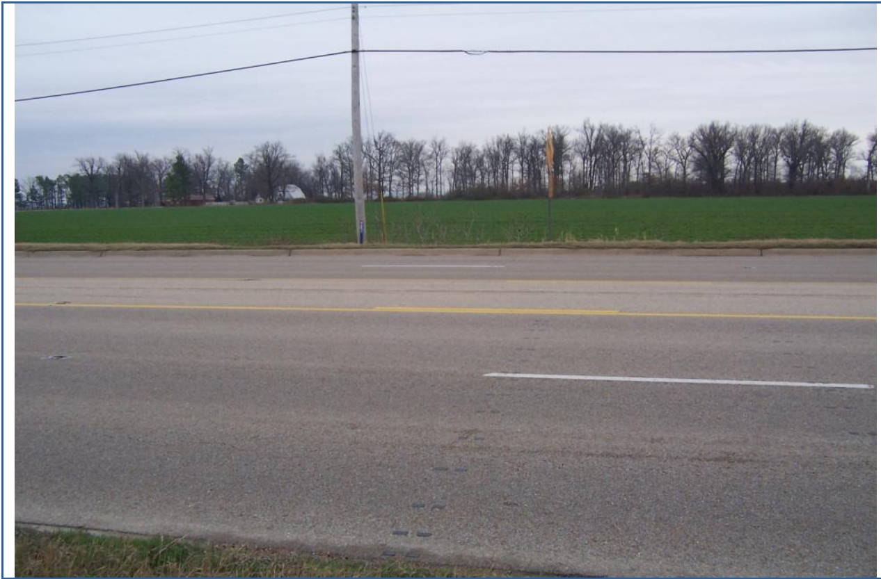
View looking South across Hwy. 49S from project Site