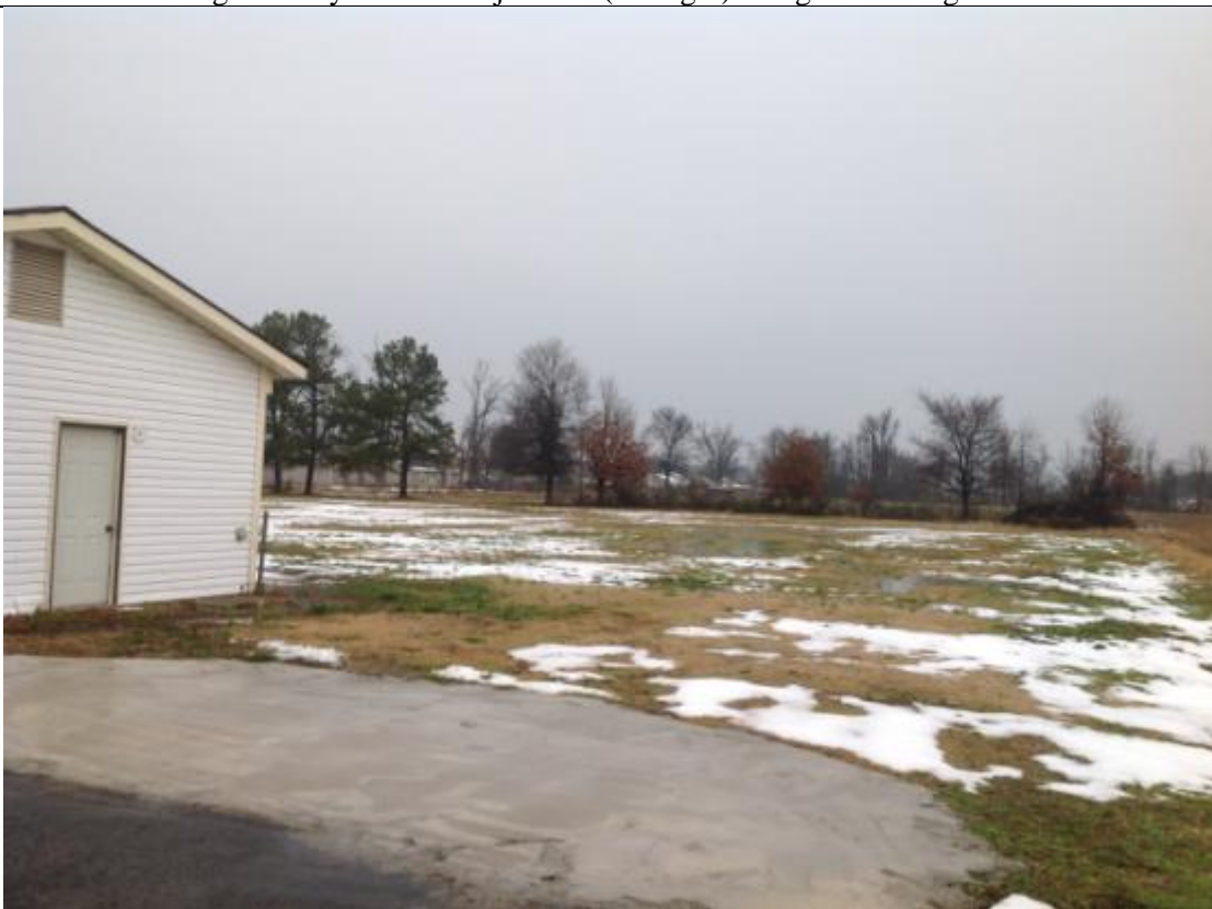
View from adjacent property 5922 N. Johnson looking toward site