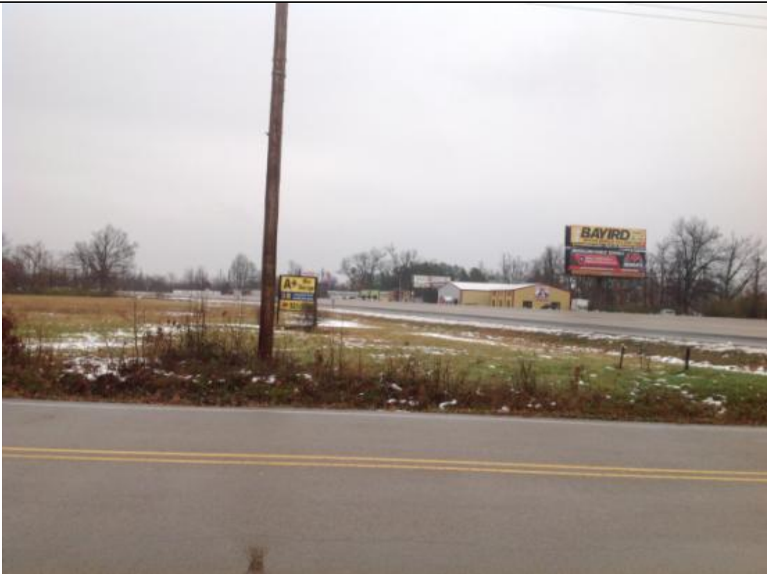
View looking easterly from Clinton School Rd. towards the Farville curve