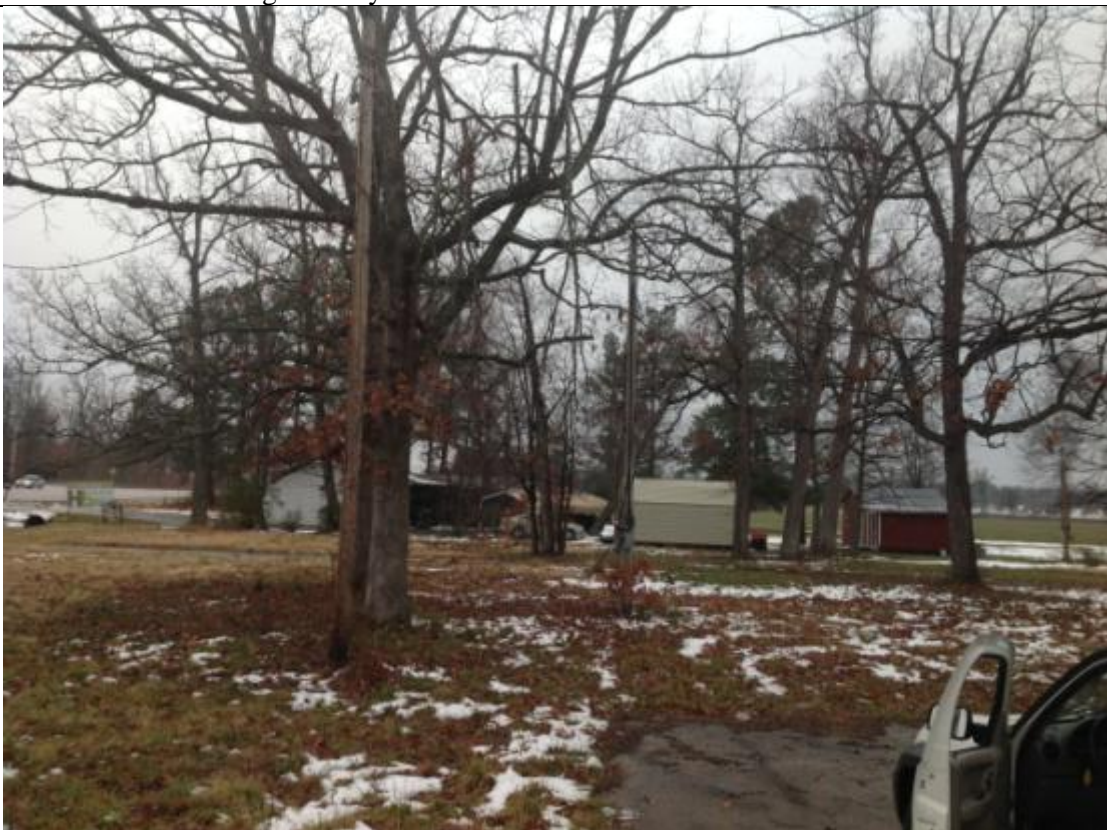
View from Clinton School Road, looking West at neighboring property