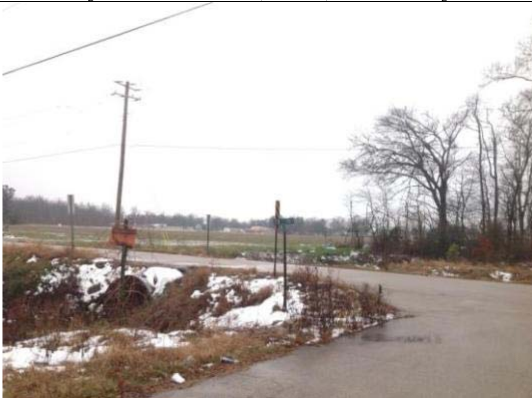
View looking East from the intersection of Sundown Lane and Clinton School Road towards site