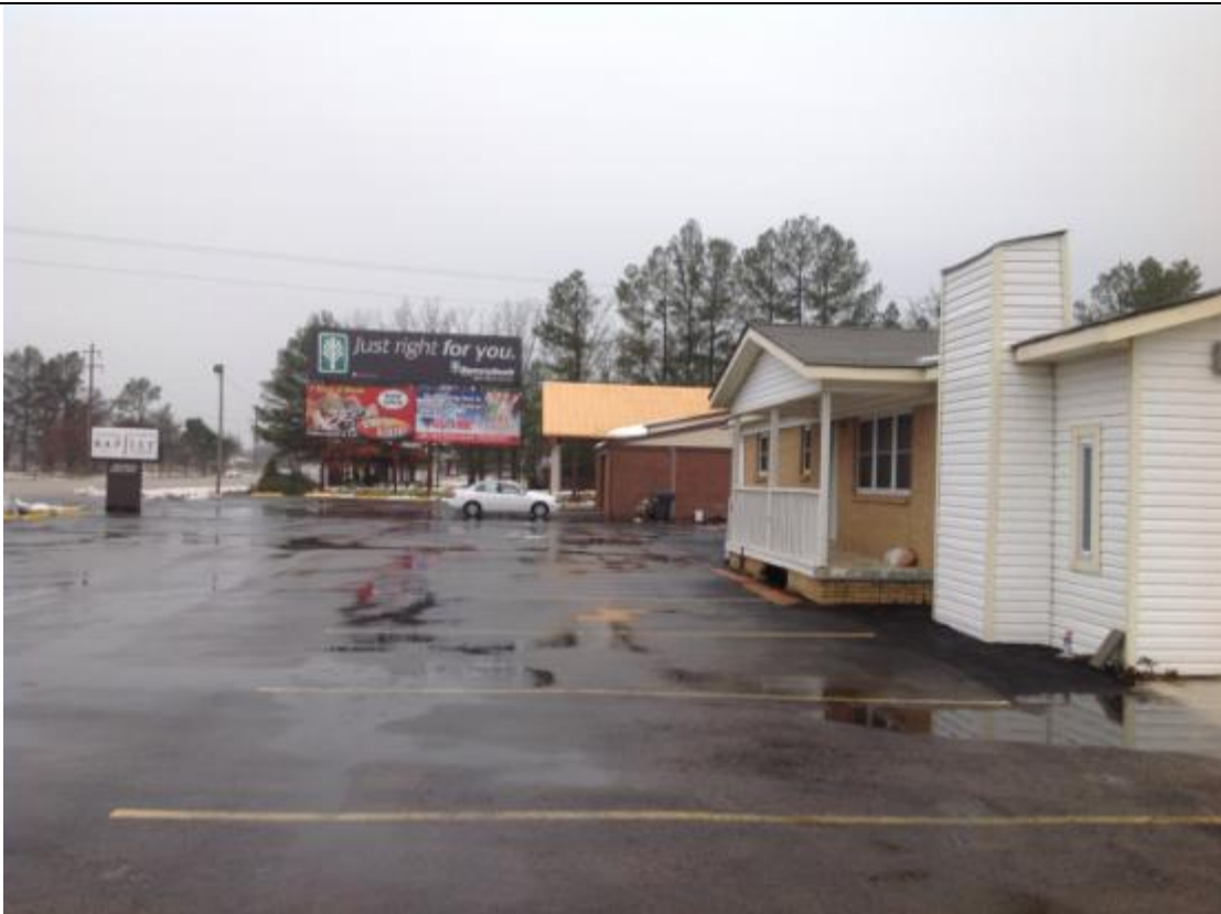
View looking west from adjacent property located at 5922 N. Johnson