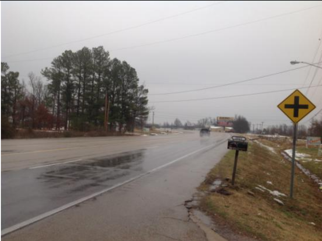
View looking west towards the intersection approach of Clinton School Road and HWY 49 N.