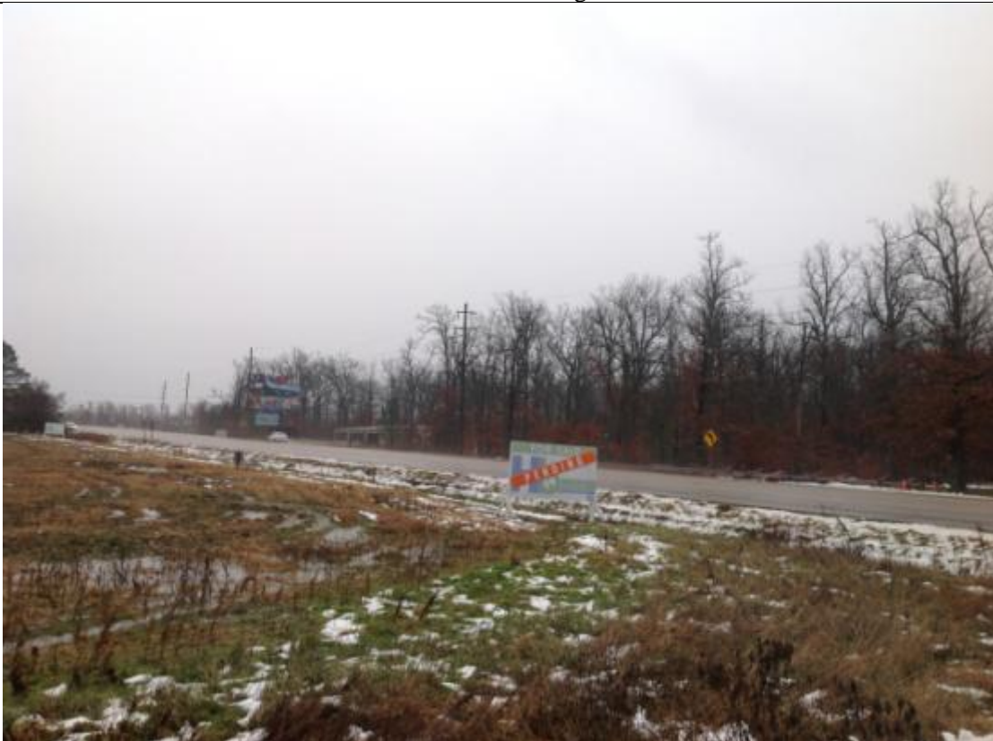
View looking easterly toward subject site frontage along HWY 49 N