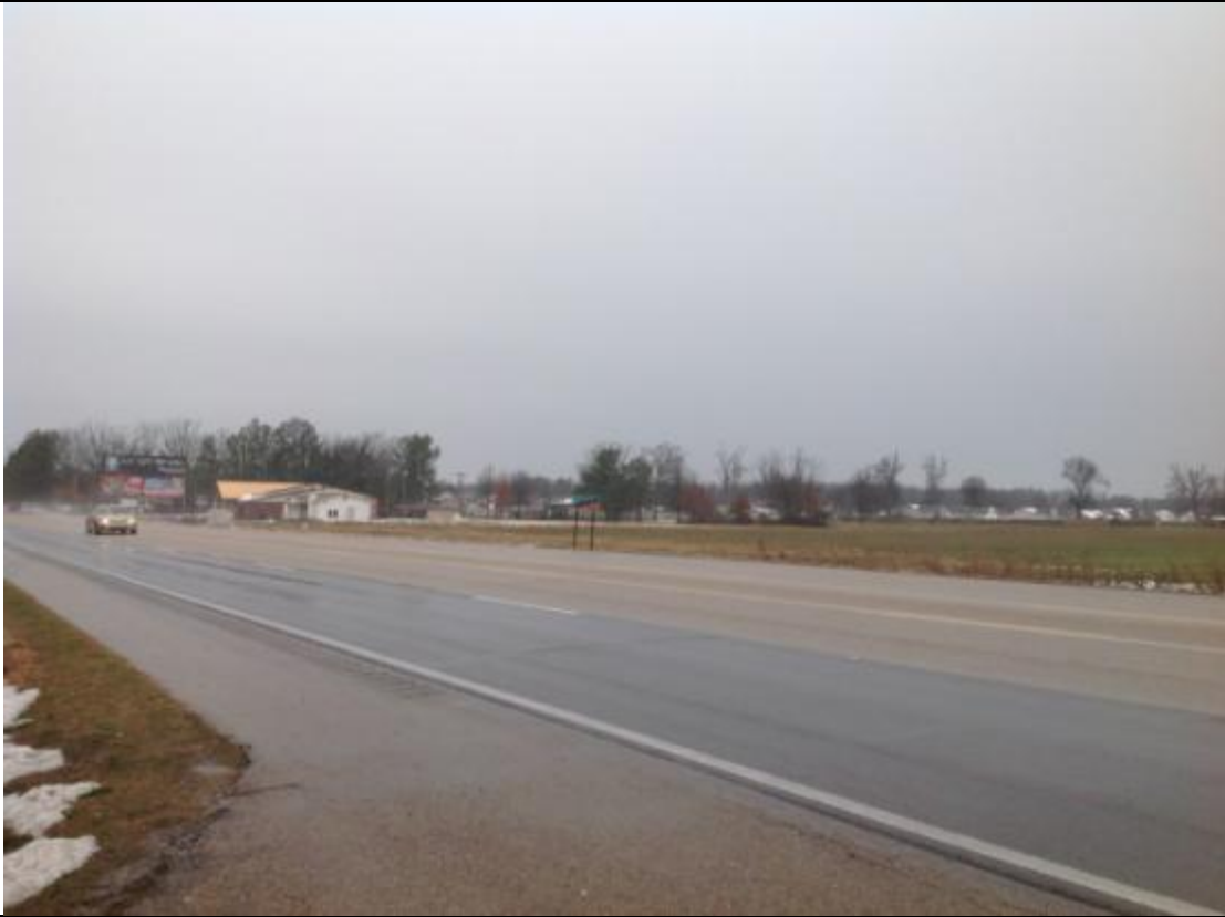
View from south side of HWY 49 N looking Northwest towards the Site