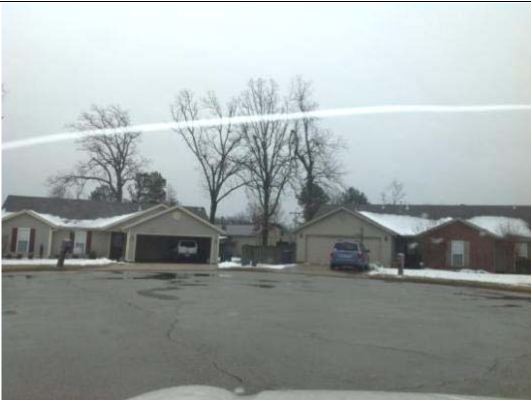
View looking Southeast on Sheffield Dr. (Cul-de-sac) – Windsor Landing Subdivision