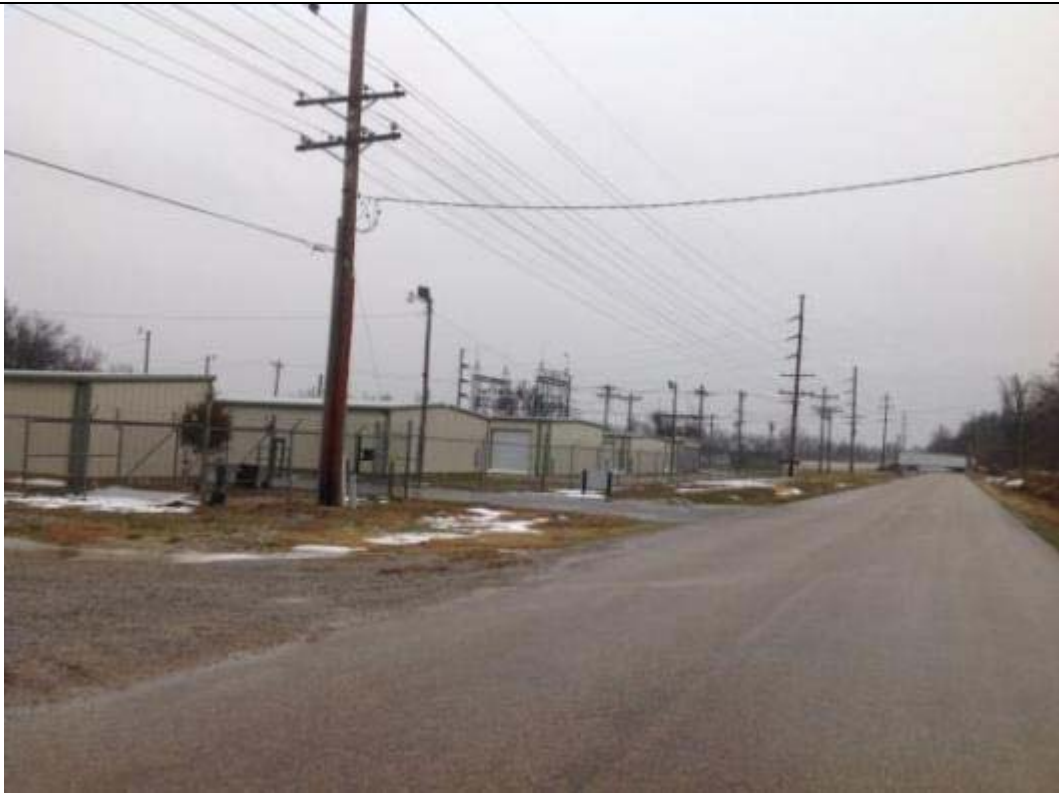
View looking south on Clinton School Road, Storage units are east of site