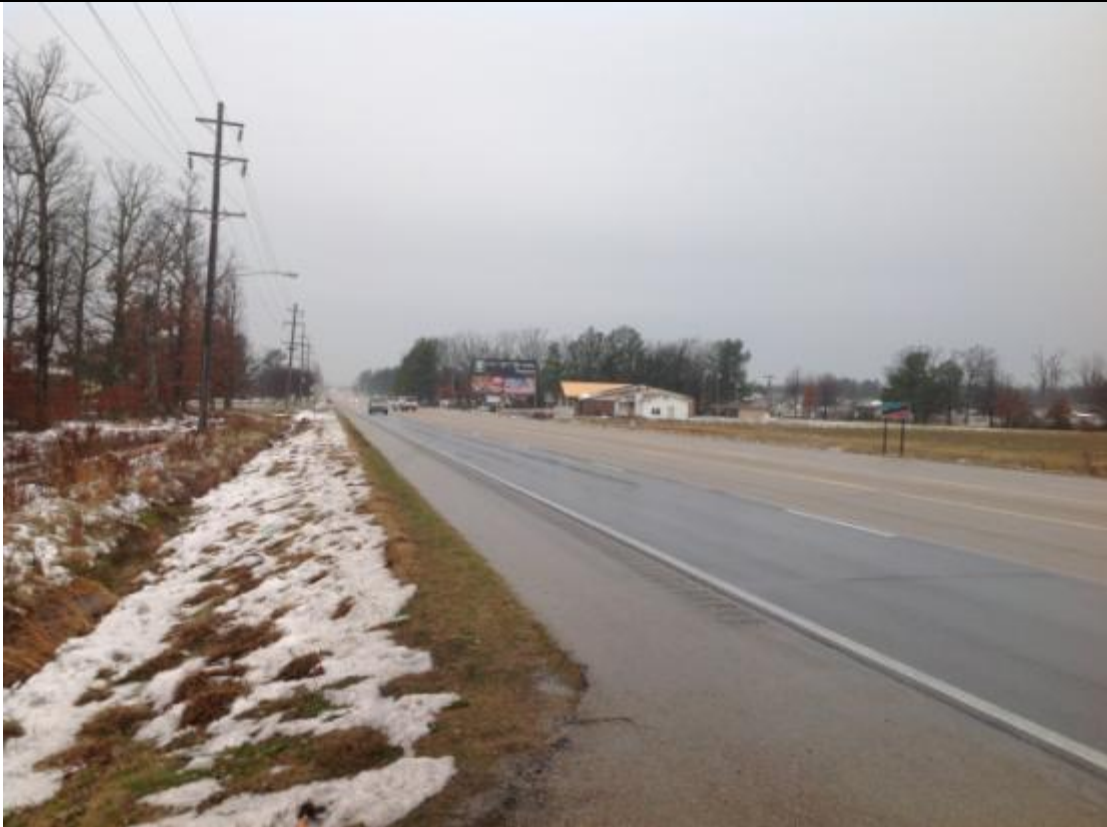
View looking westerly toward subject site (On right) along the frontage of HWY 49 N