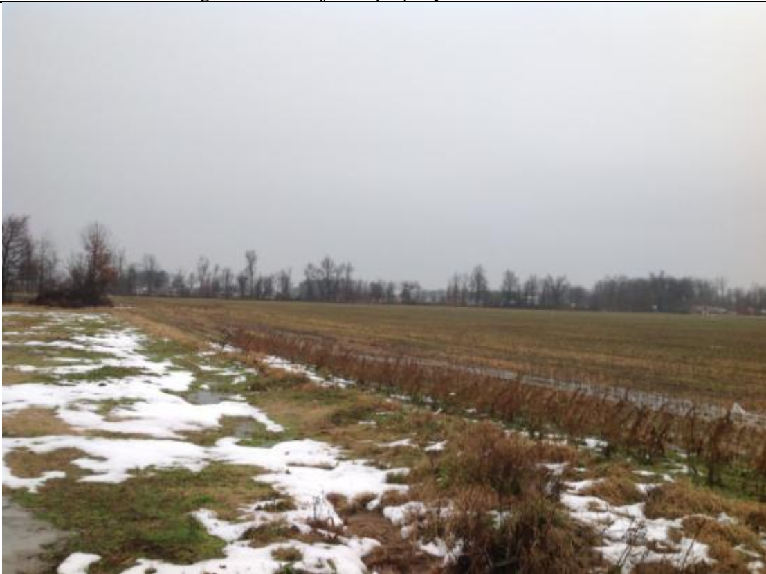
View from adjacent property 5922 N. Johnson looking toward site