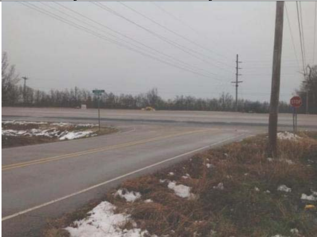
View looking south towards the intersection of HWY 49N and Clinton School Road