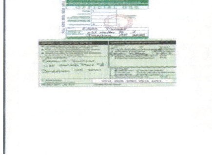
photo taken: 03/04/2014 - Certified_mail_receipt162Certified_mail_receipt.jpg