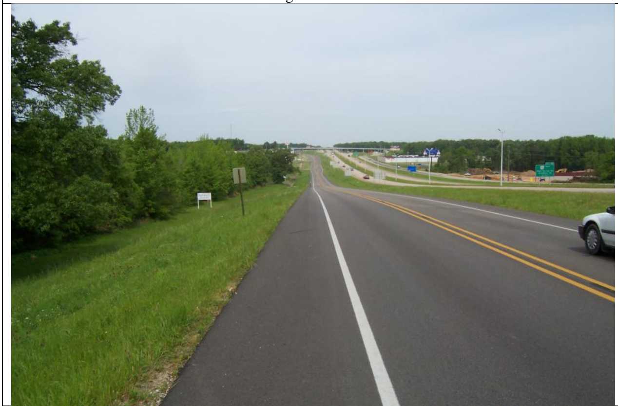
View looking West on Parker Rd.