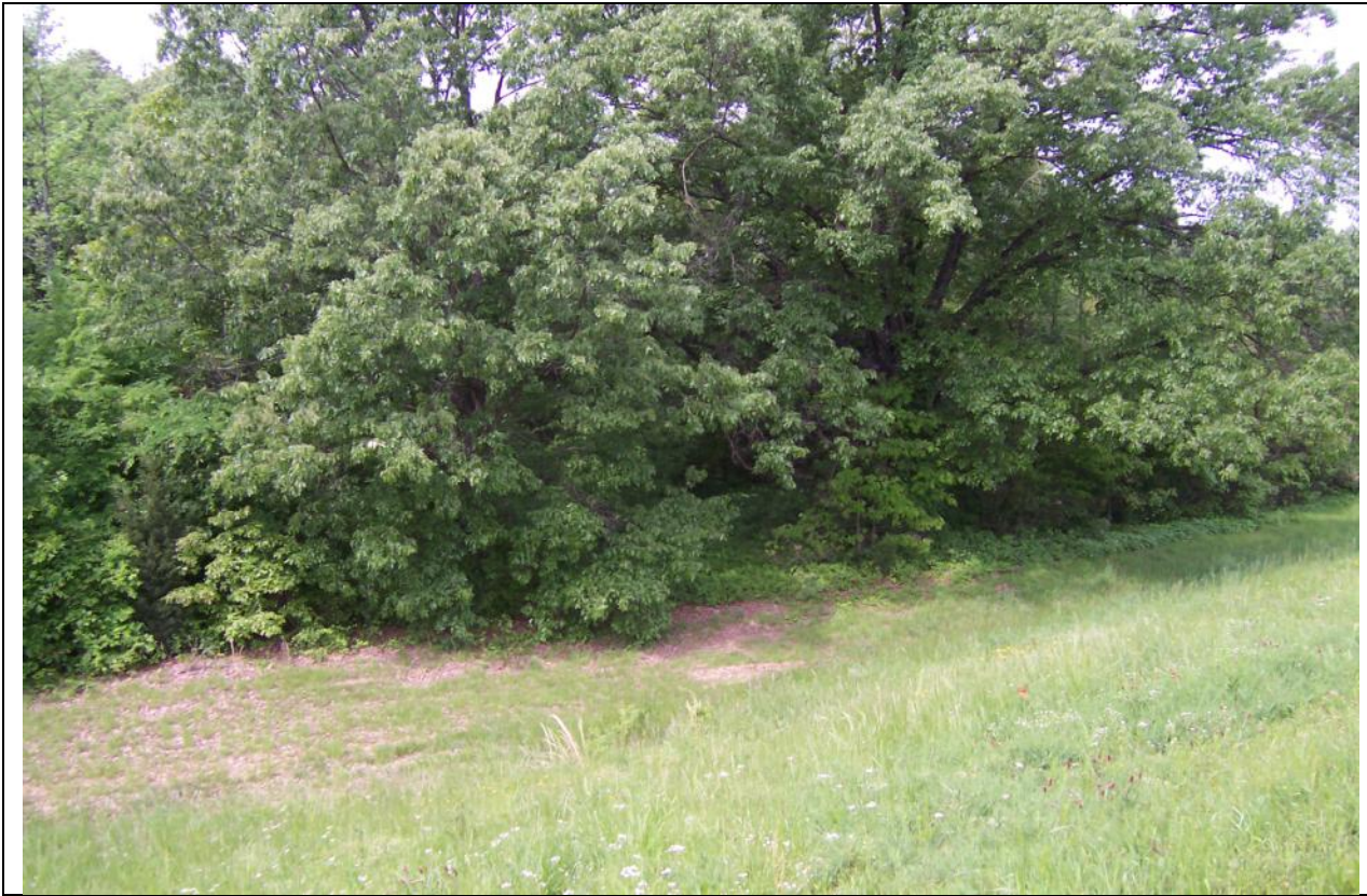
View looking South at project site