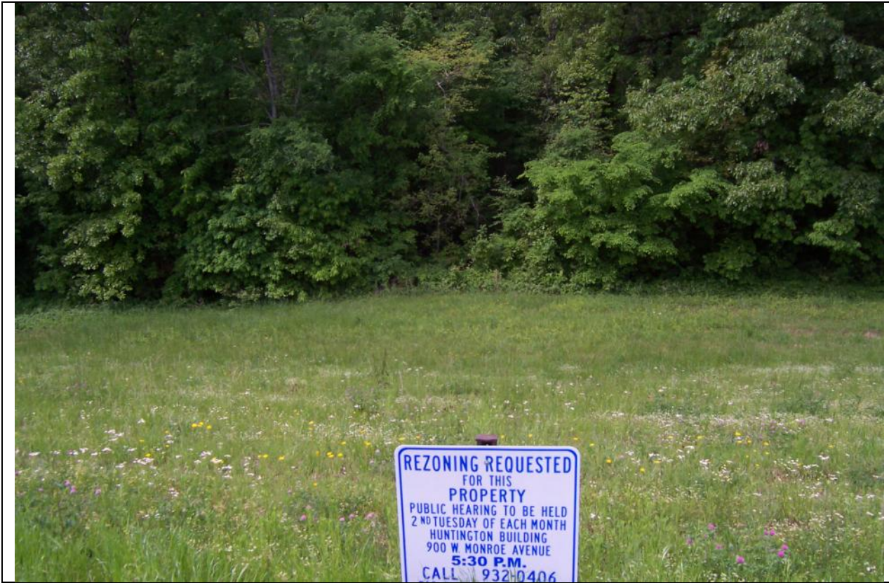
View looking South toward the site