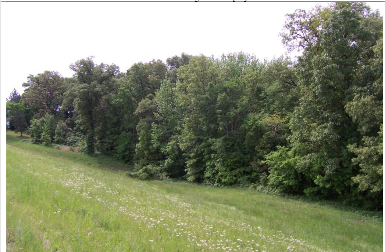
View looking Southeast at project site