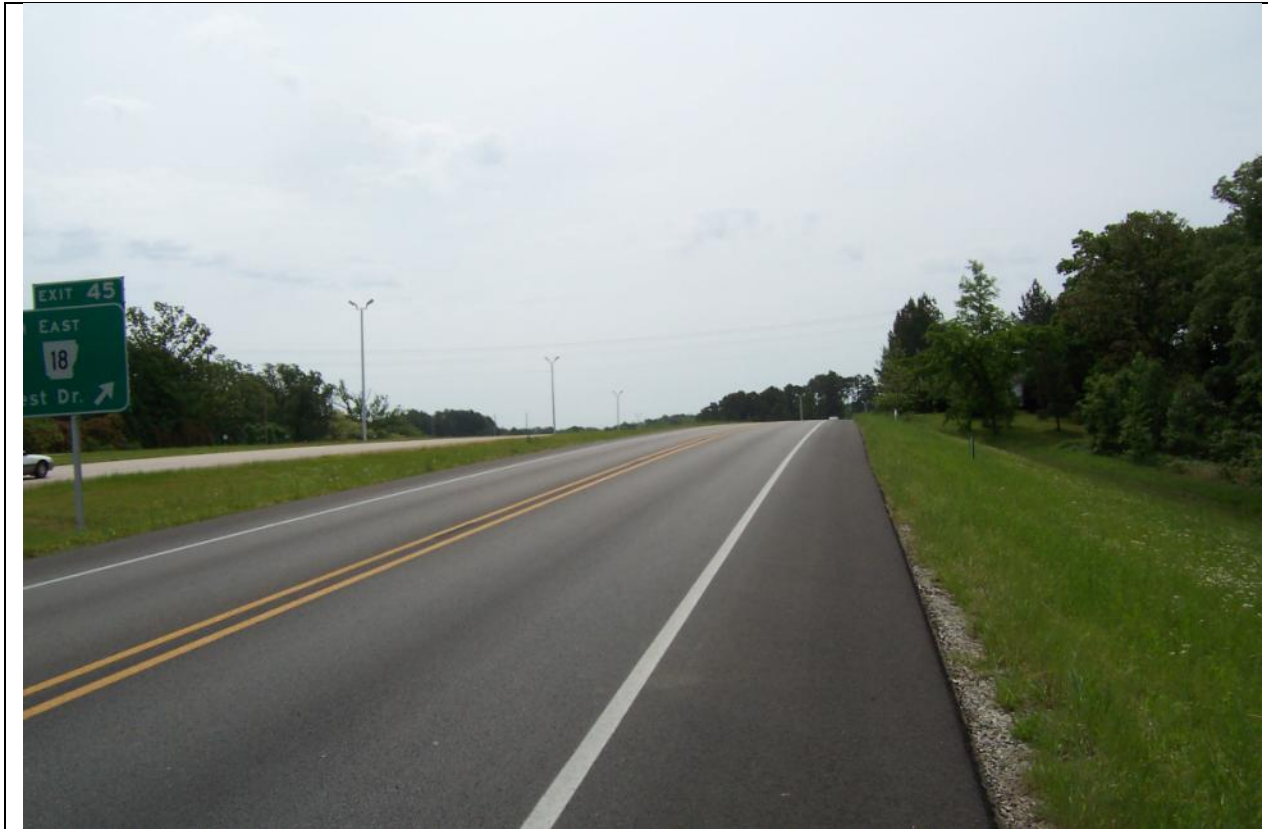
View looking East on Parker Rd.