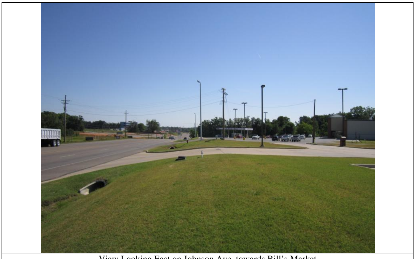
View Looking East on Johnson Ave. towards Bill's Market