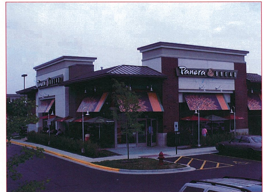
PANERA BREAD STAND ALONE NO SCALE