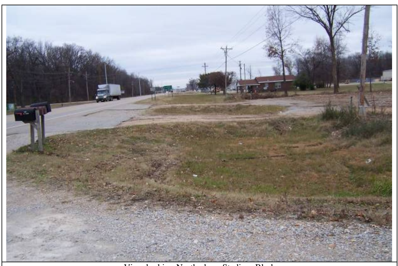
View looking North along Stadium Blvd.