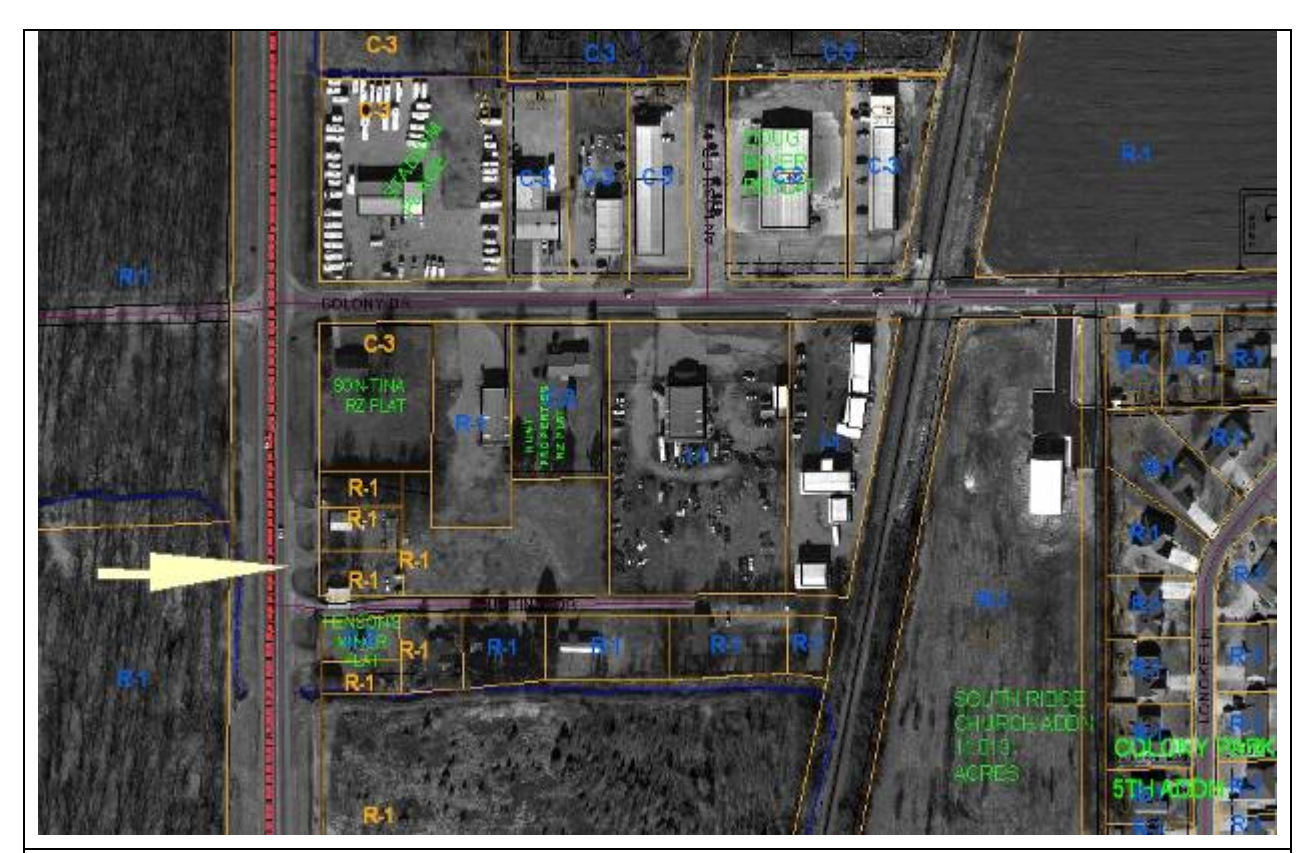
AERIAL & ZONING MAP