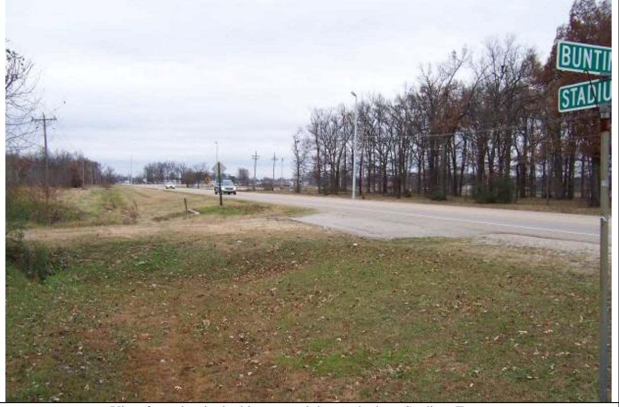
View from the site looking toward the south along Stadium Frontage