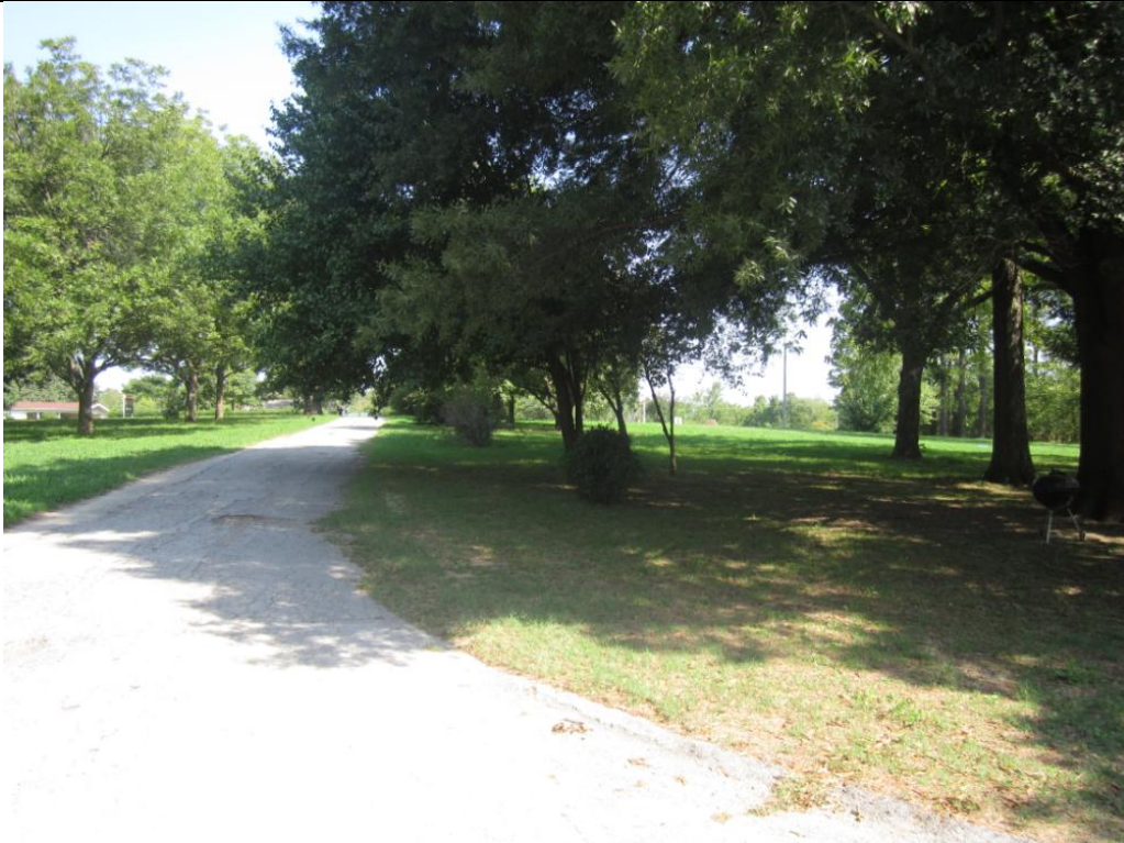
View looking north from site