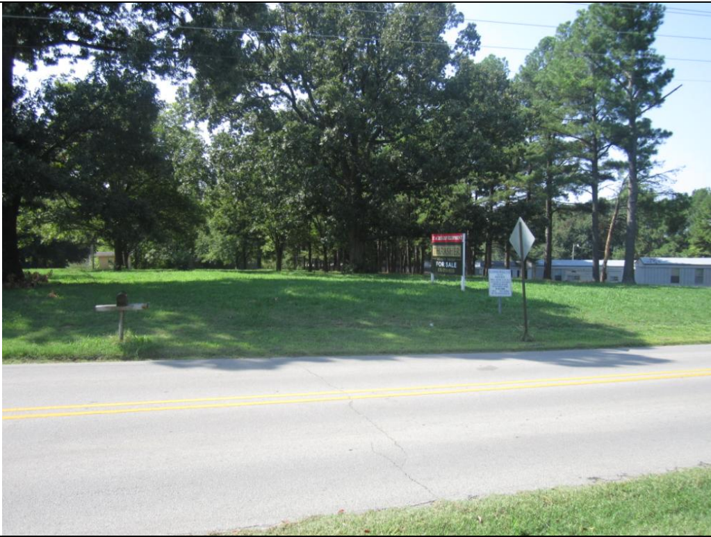
View looking Southwest towards property