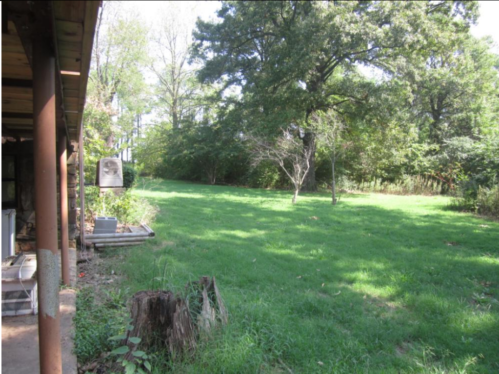
View From Site looking South