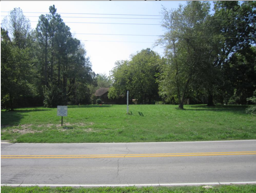
View looking South at subject property.