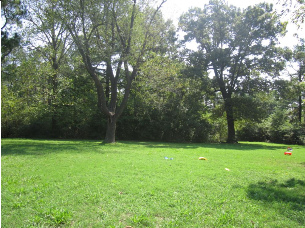
View looking east from site