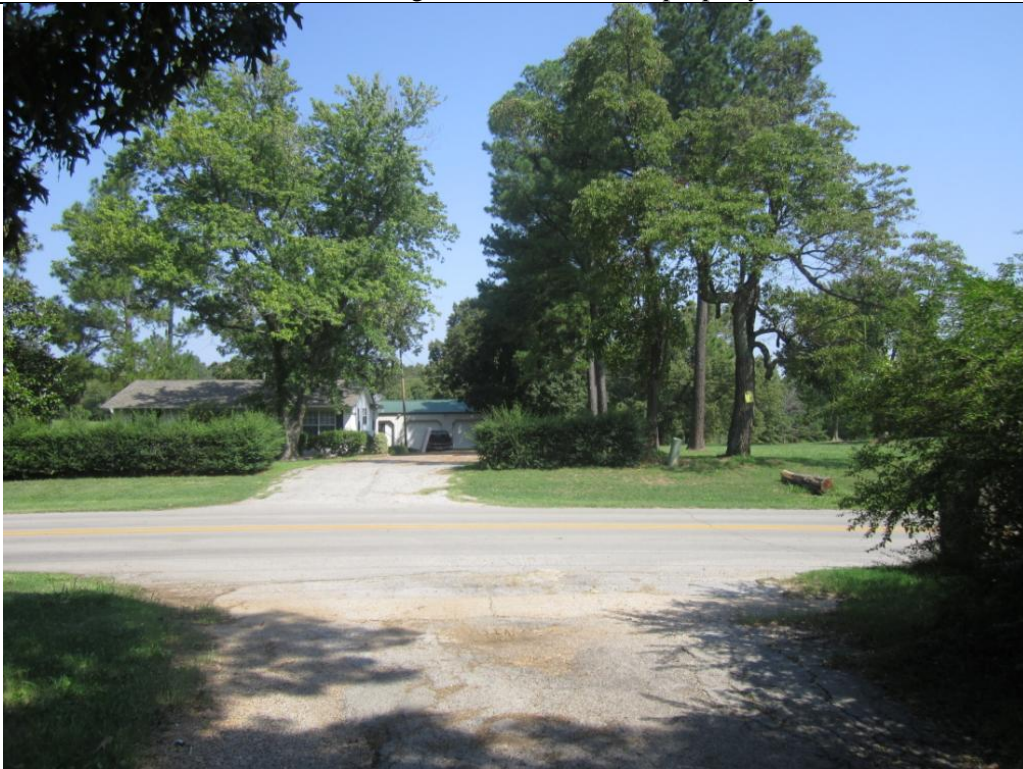
View looking North from property