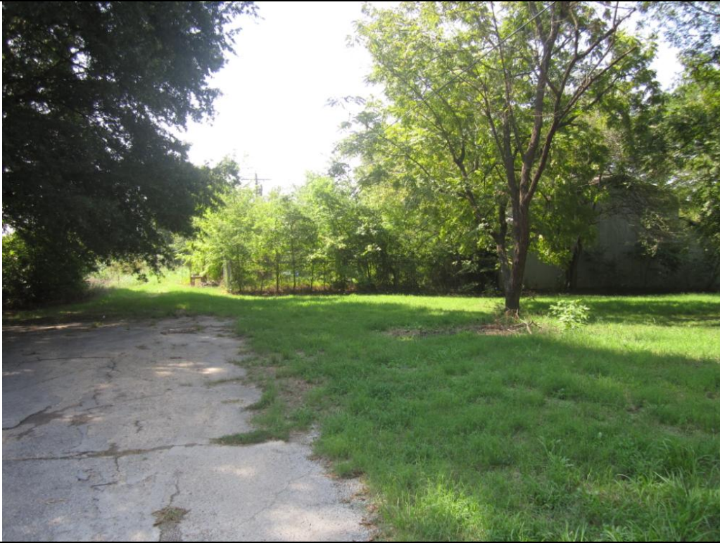
View looking South From Site