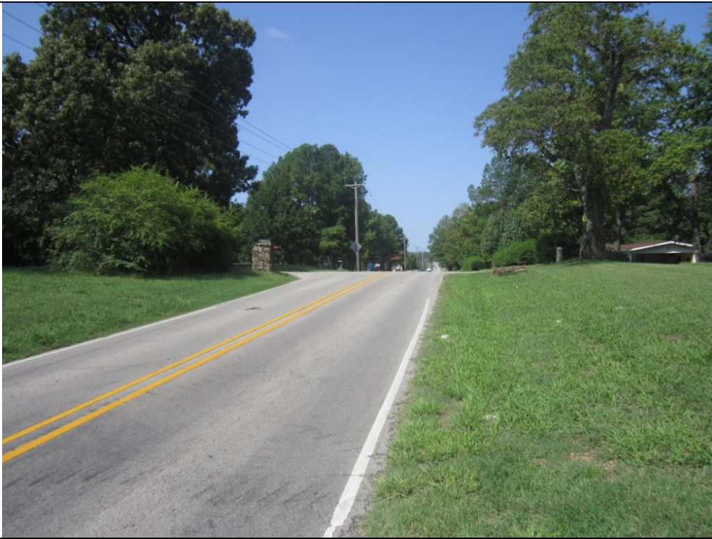
View looking West along Aggie Road