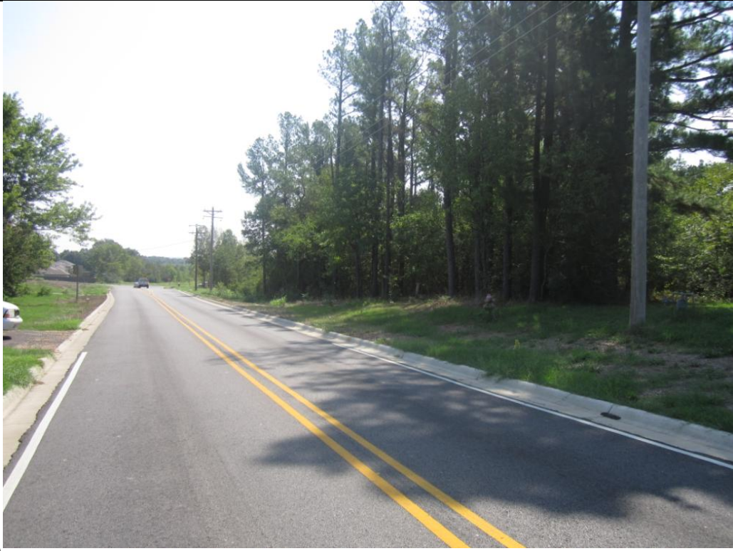
View looking East along Aggie Road