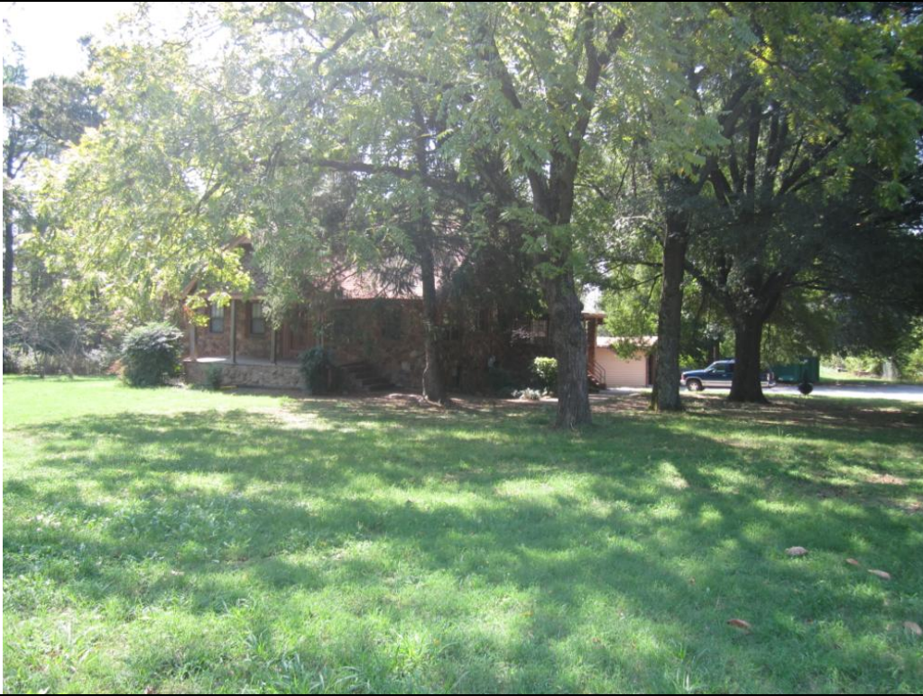
View looking southeast on site