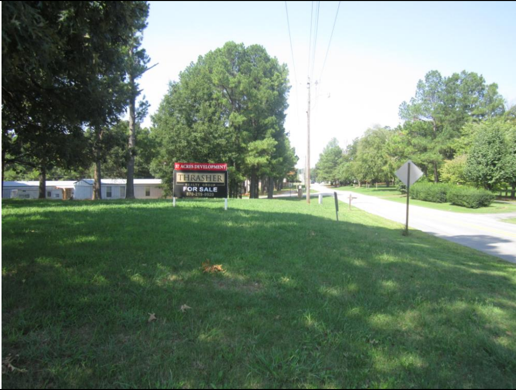
View looking West along Aggie Rd. Frontage