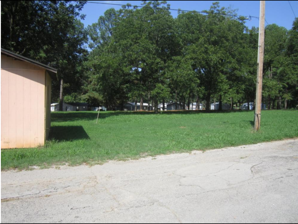
View from Site looking West