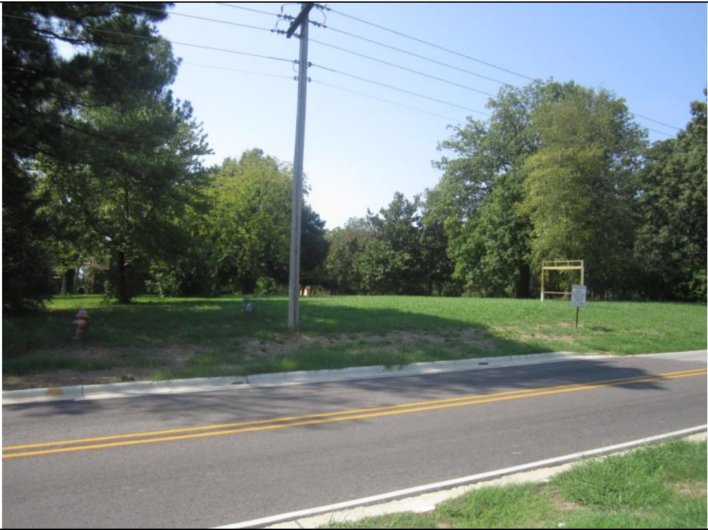
View looking Southwesterly towards subject property