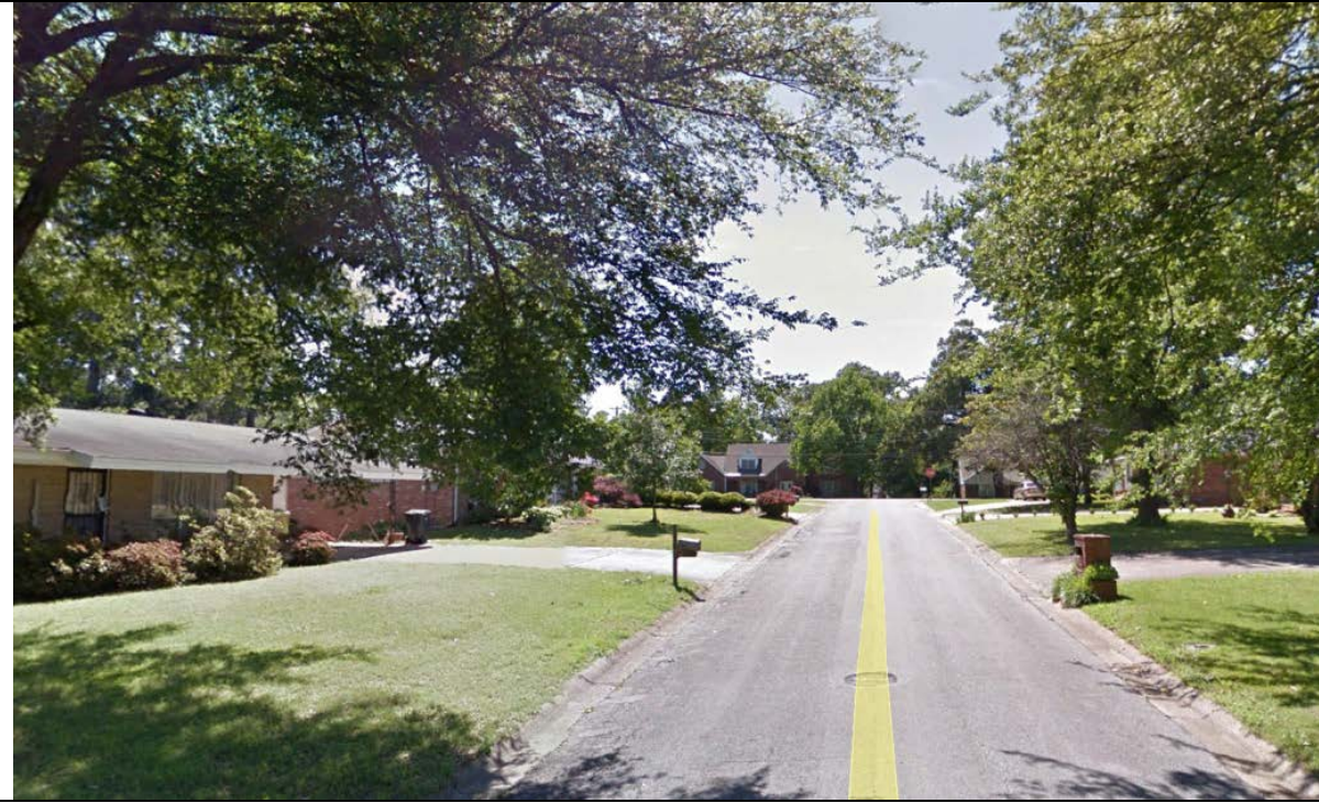
View looking West