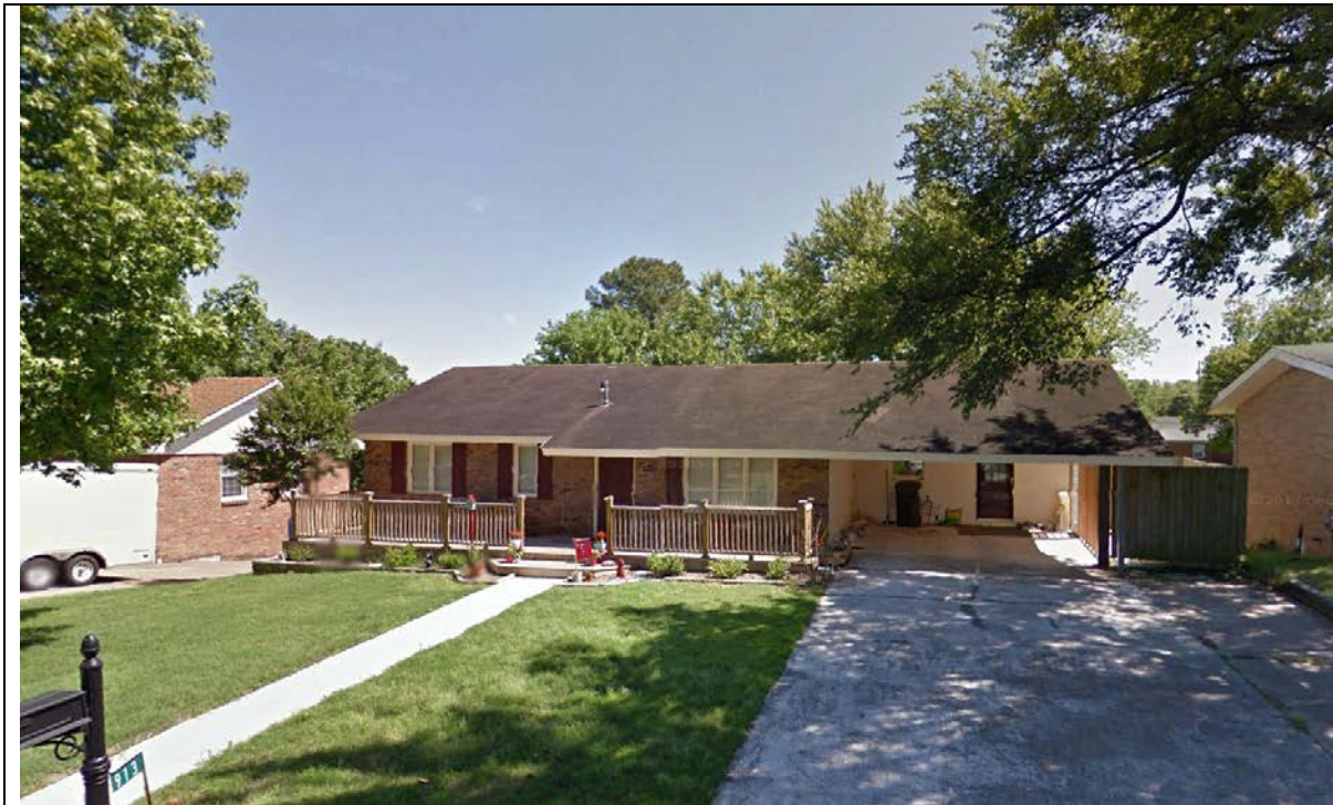
View looking South towards the property