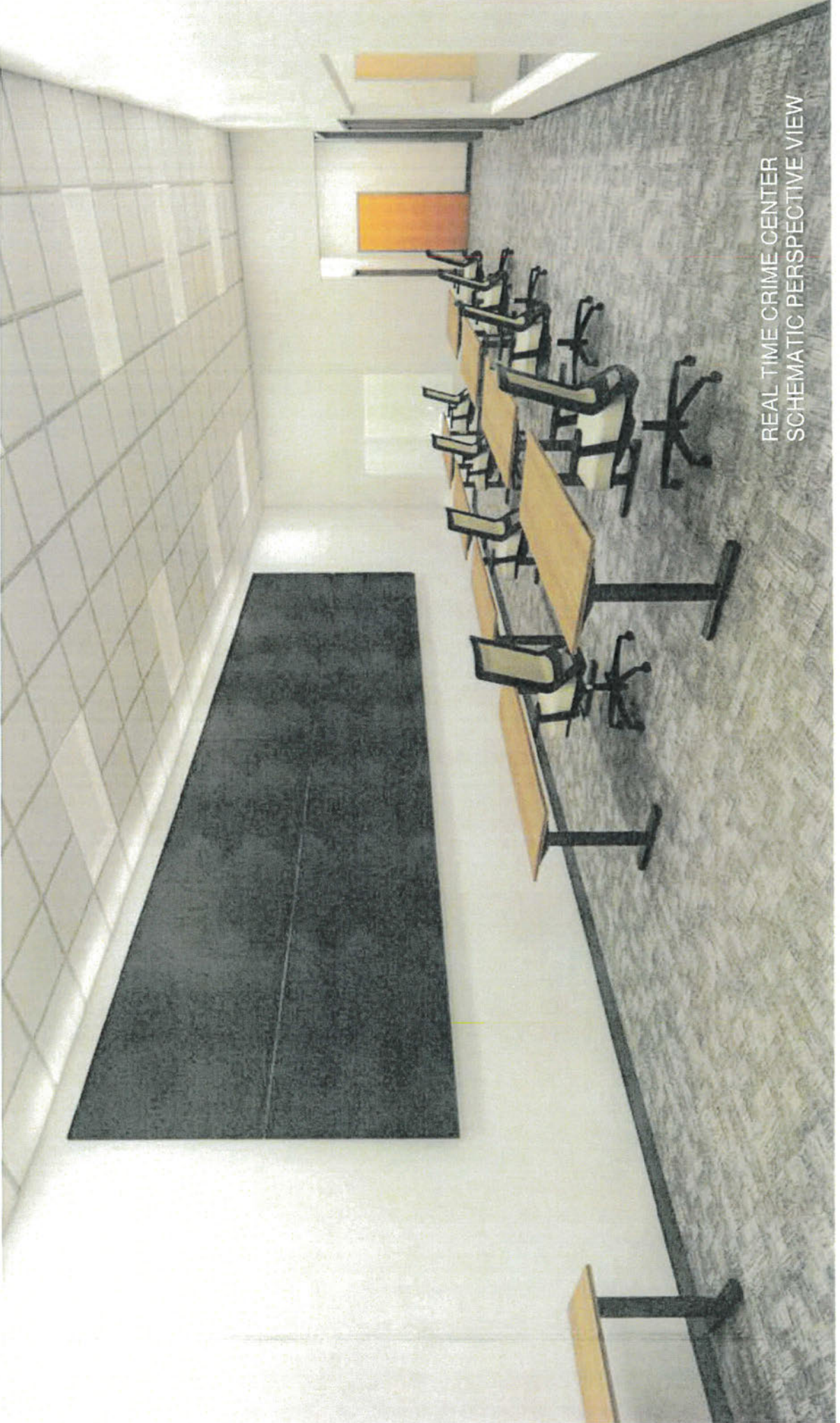
REAL TIME CRIME CENTER SCHEMATIC PERSPECTIVE VIEW