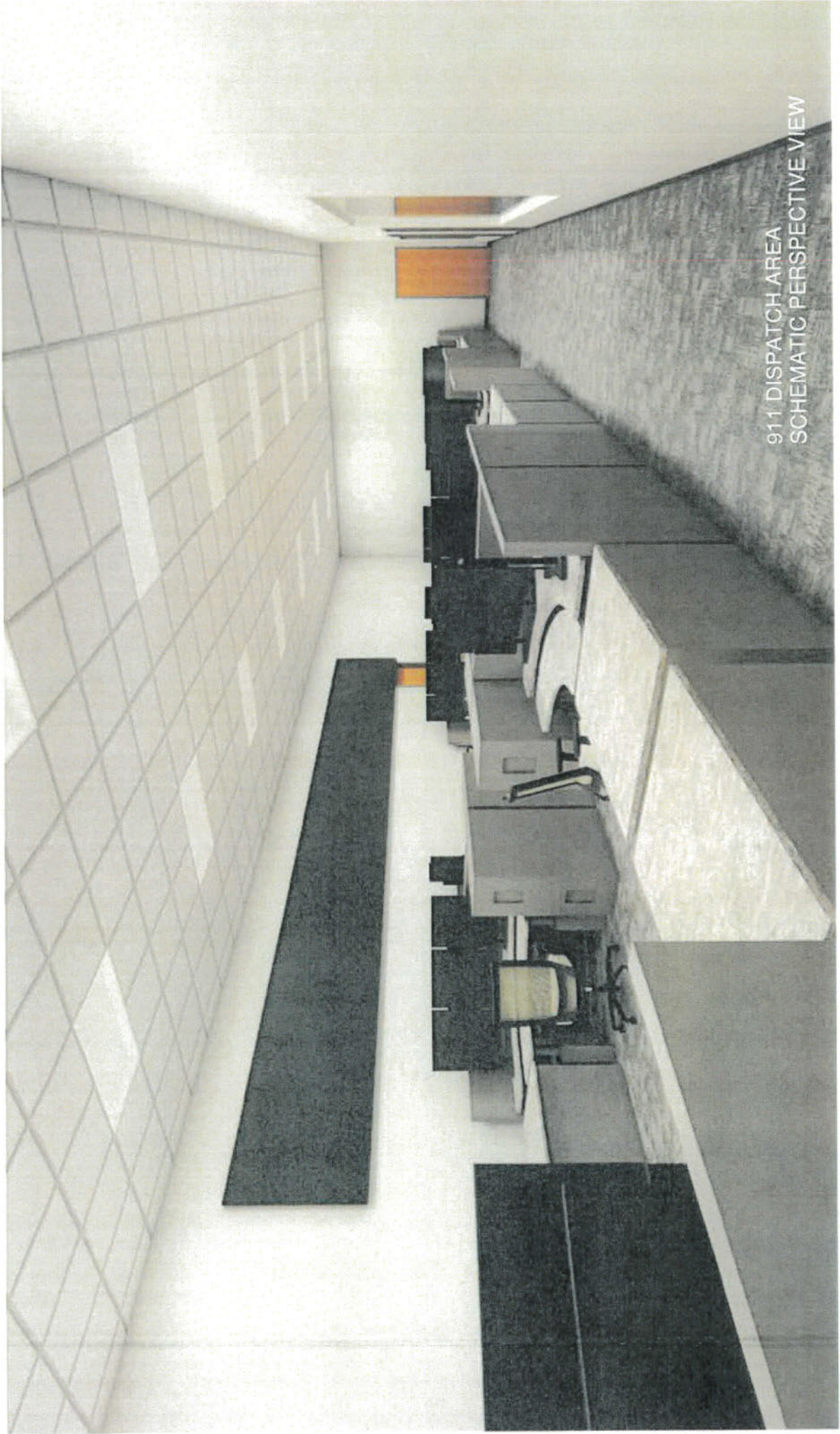
911 DISPATCH AREA SCHEMATIC PERSPECTIVE VIEW