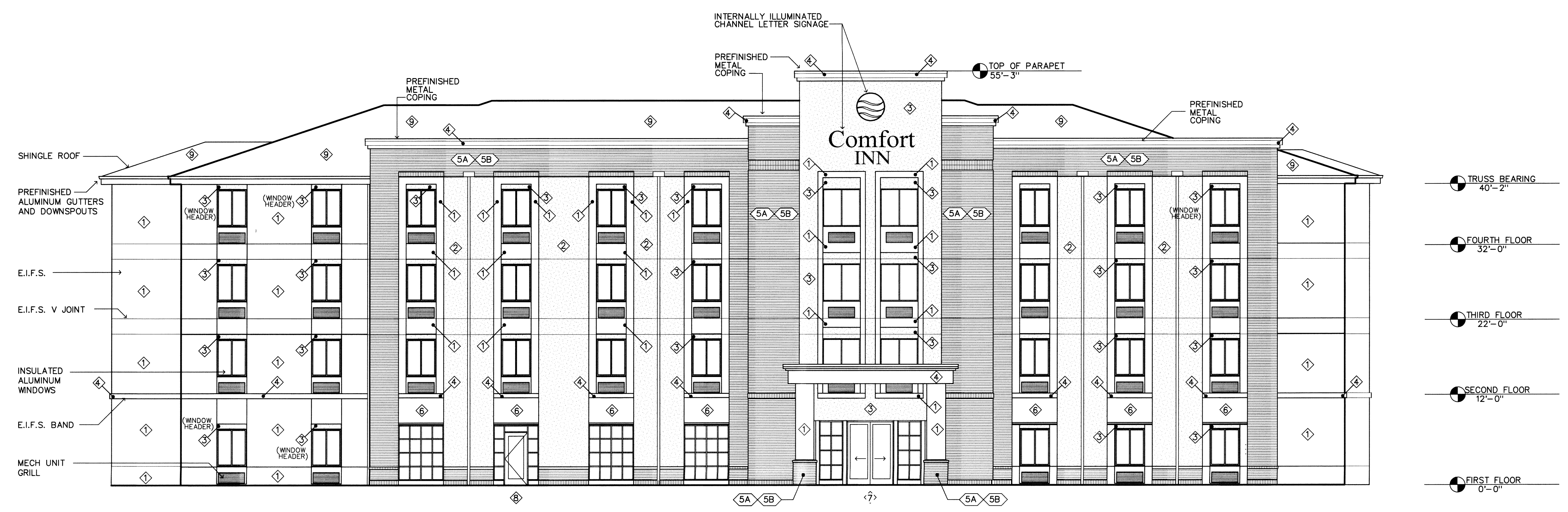
FRONT ELEVATION SCALE: 1/8" = 1'-0"

Jimmy Hudspeth/ Architect, P.A. Architecture West Memphis, Arkansas Phone 18701 736-2240 Fax 18701 736-2288 jimmyhudspeth@aol.com