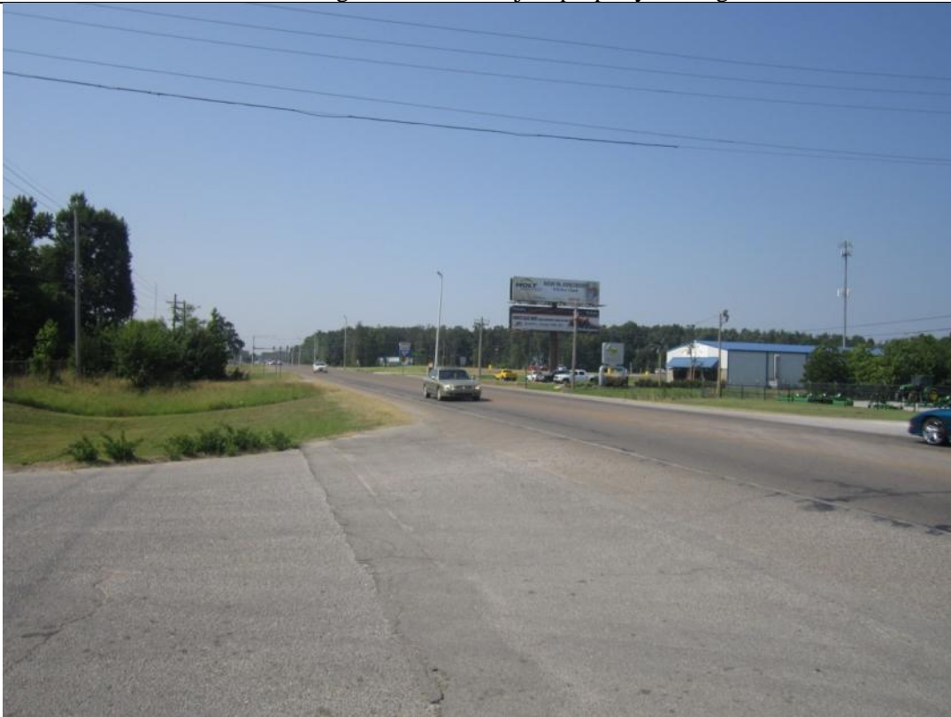
View of looking South along Stadium Blvd.