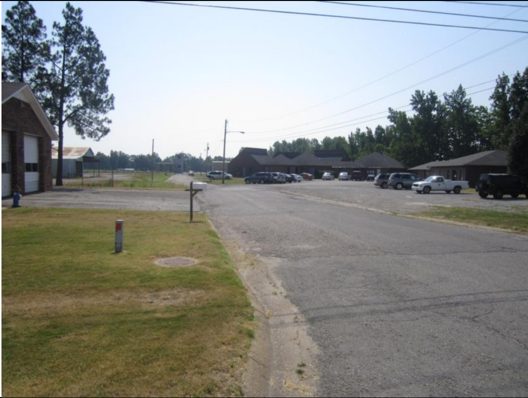
View of subject property and Fire Academy Dr.