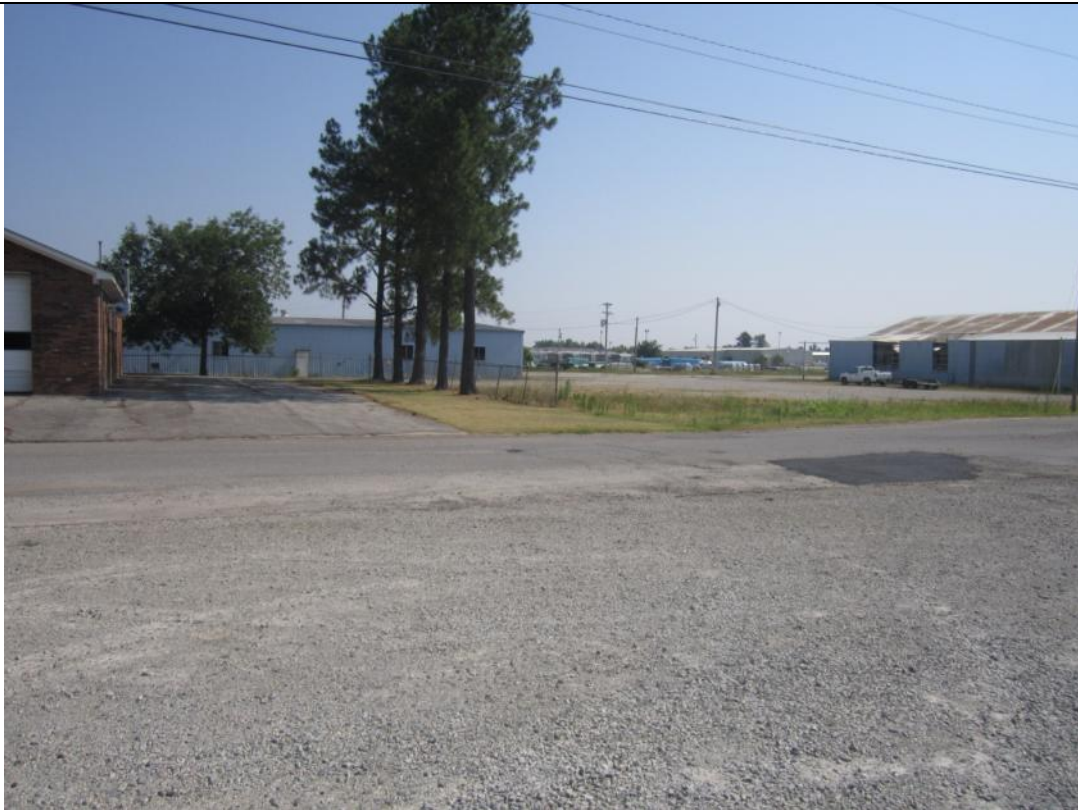
View looking Northeast of subject property and additional acreage (rear).