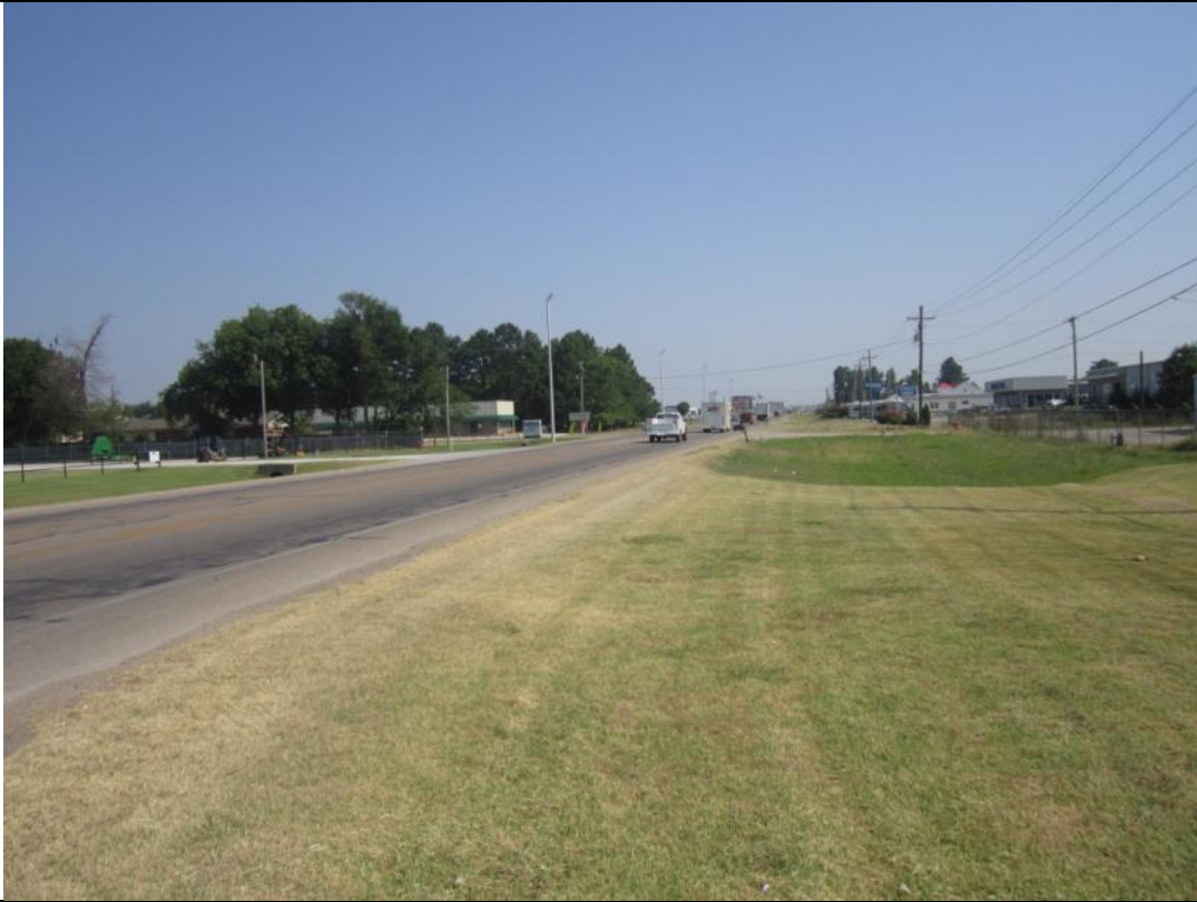
View looking North from subject property frontage.