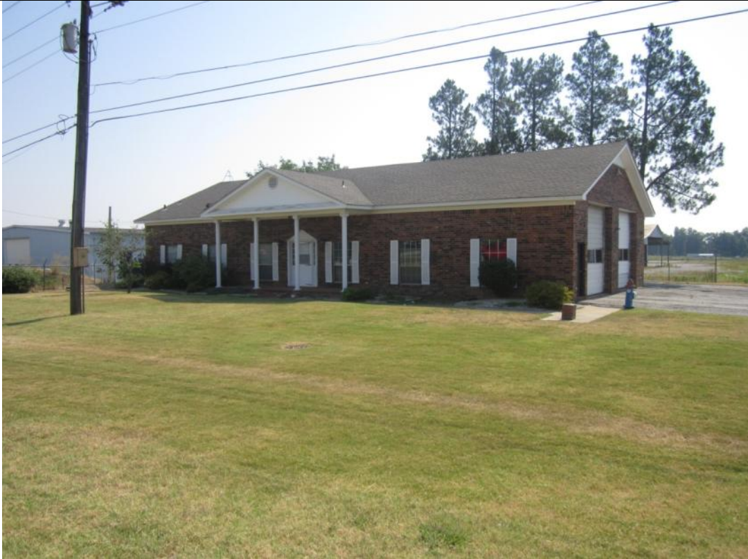
View looking East towards subject property along Stadium Blvd.