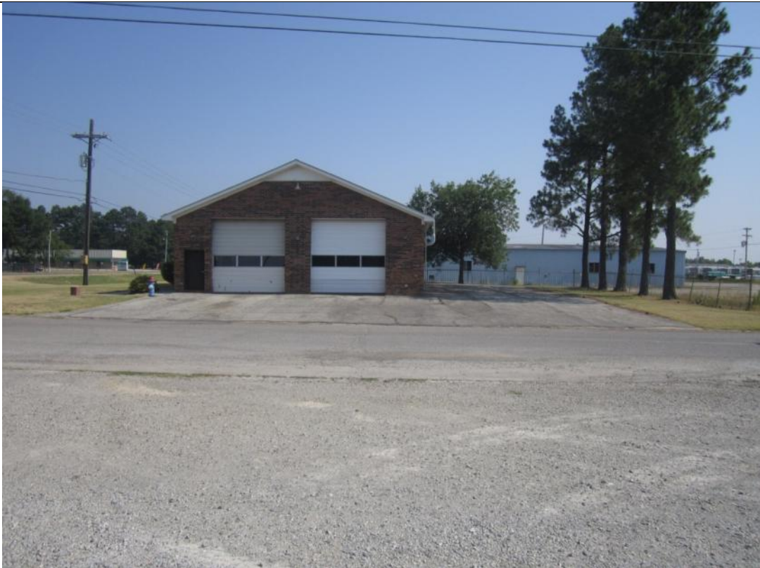
View looking North from adjacent property.