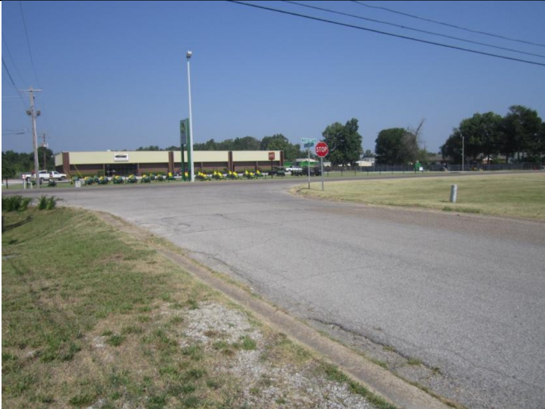
View looking West from subject property.