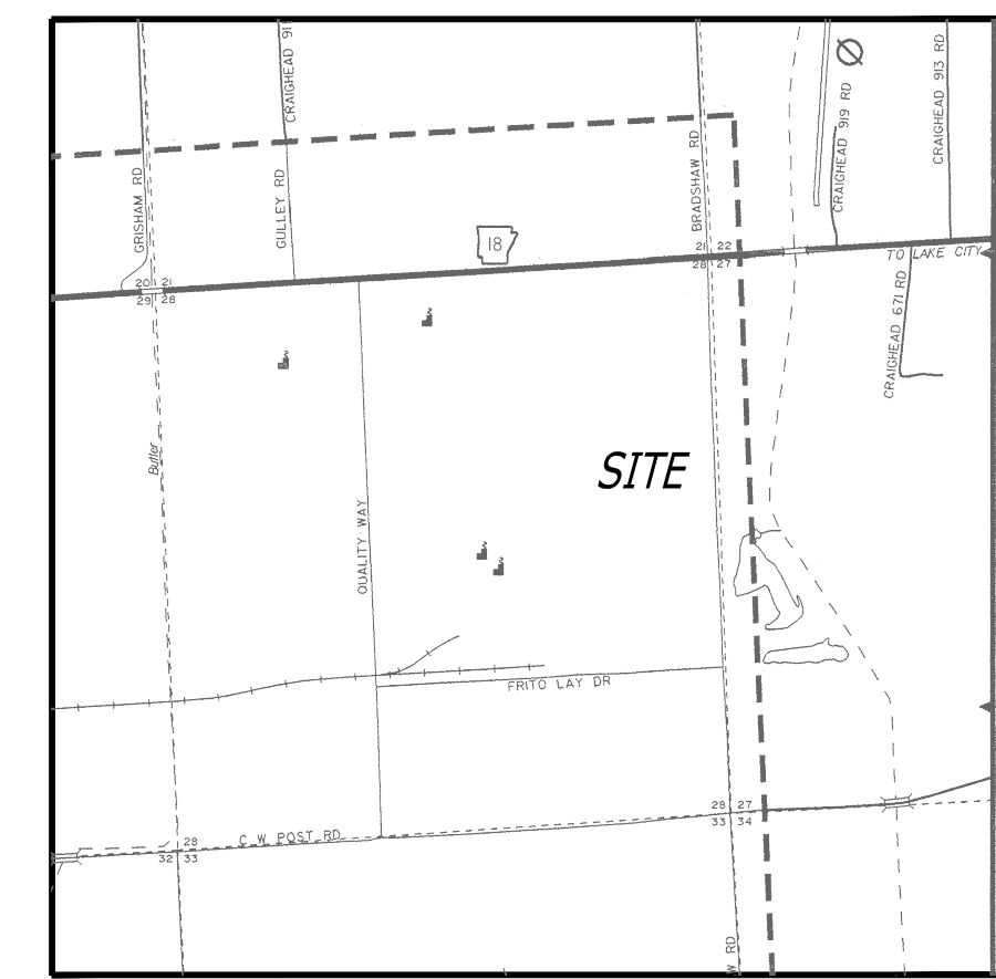
VICINITY MAP (N.T.S)