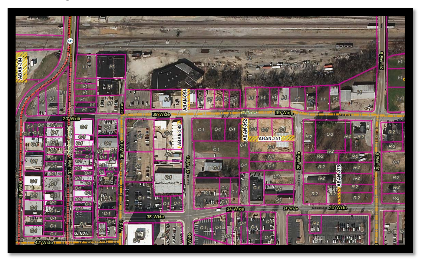
View of Larger Area Showing Current Zoning

Definition: C-1, downtown core commercial district. This district is characterized by concentrated development of permitted uses, including office and institutional, service, convenience and specialty retail, entertainment and housing. Redevelopment of the area is contemplated, with emphasis on an art and entertainment cluster. Accordingly, it is anticipated that one or more overlay or other special districts will be established to help foster transformation of the area.