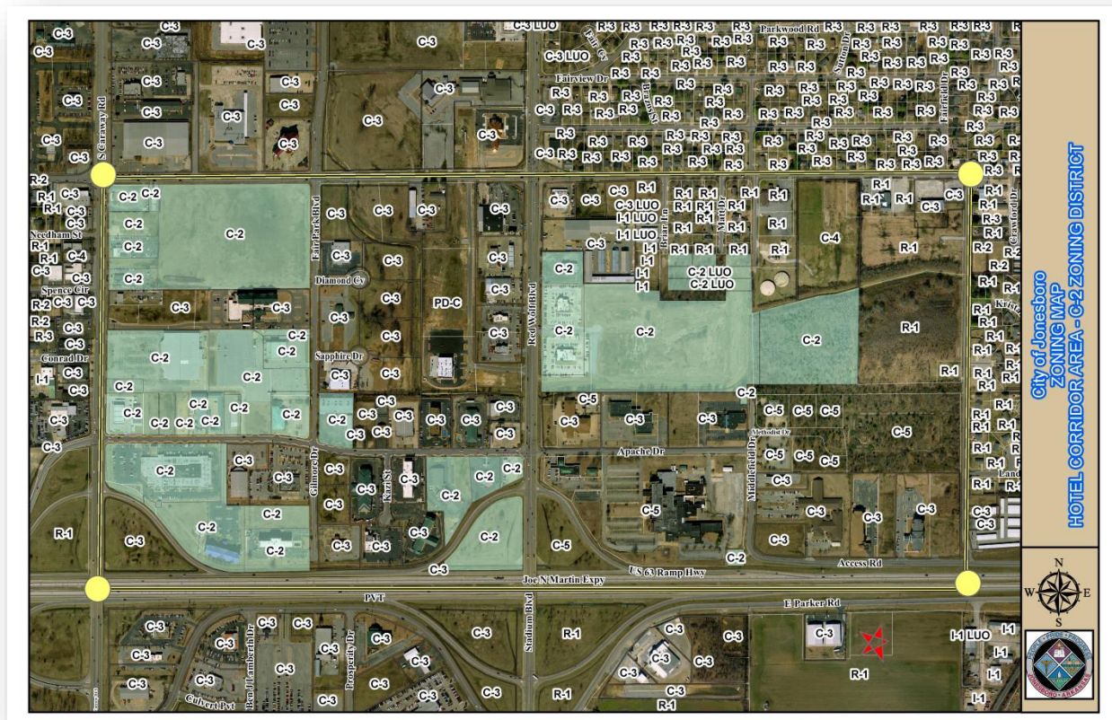
Hotel Corridor Area

Hotel/Motel Uses, while requiring a Conditional Use Review and Approval before the Metropolitan Area Planning Commission are accommodated in this area defined above as the Hotel Corridor Area (See Map next page).