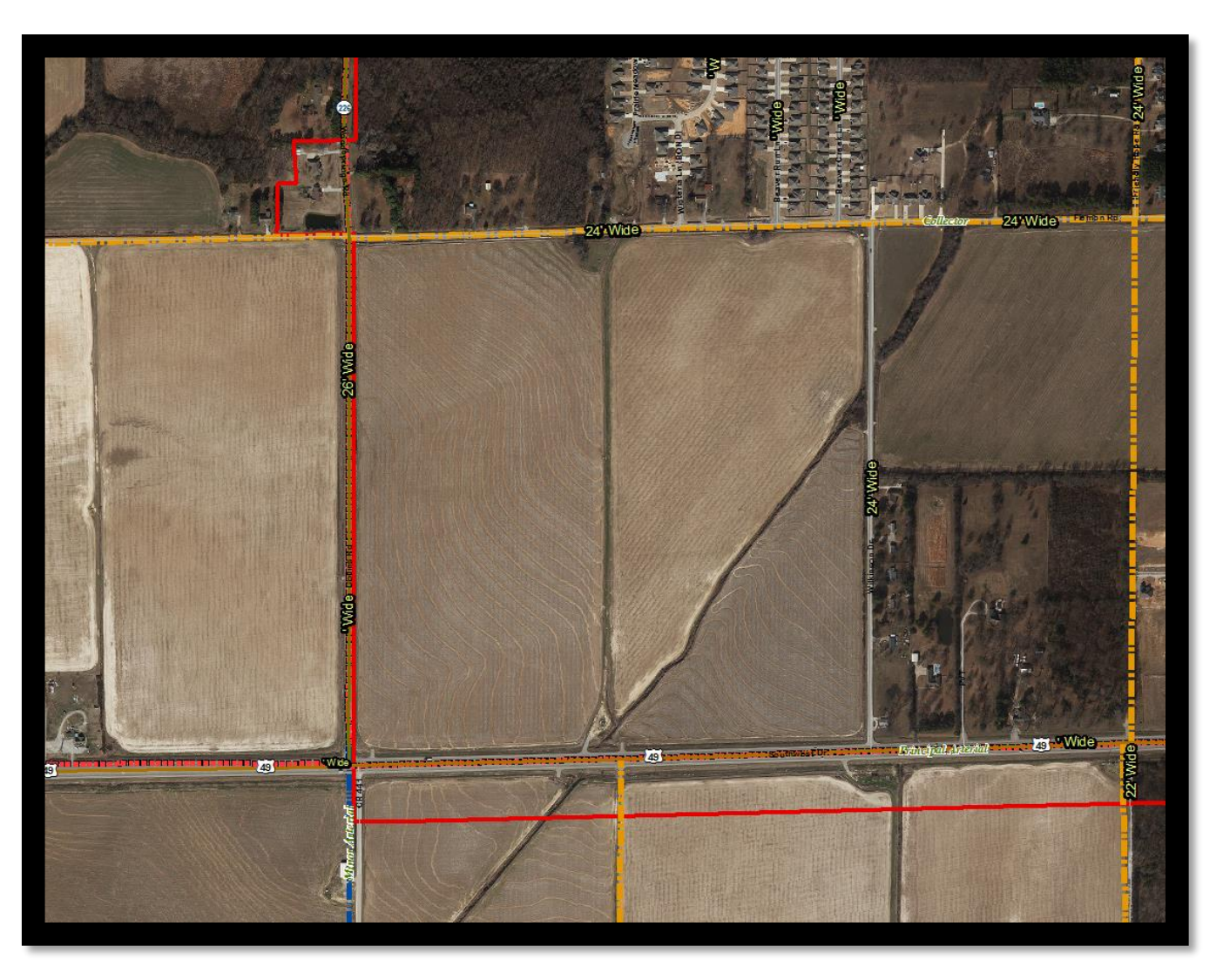
Master Street Plan