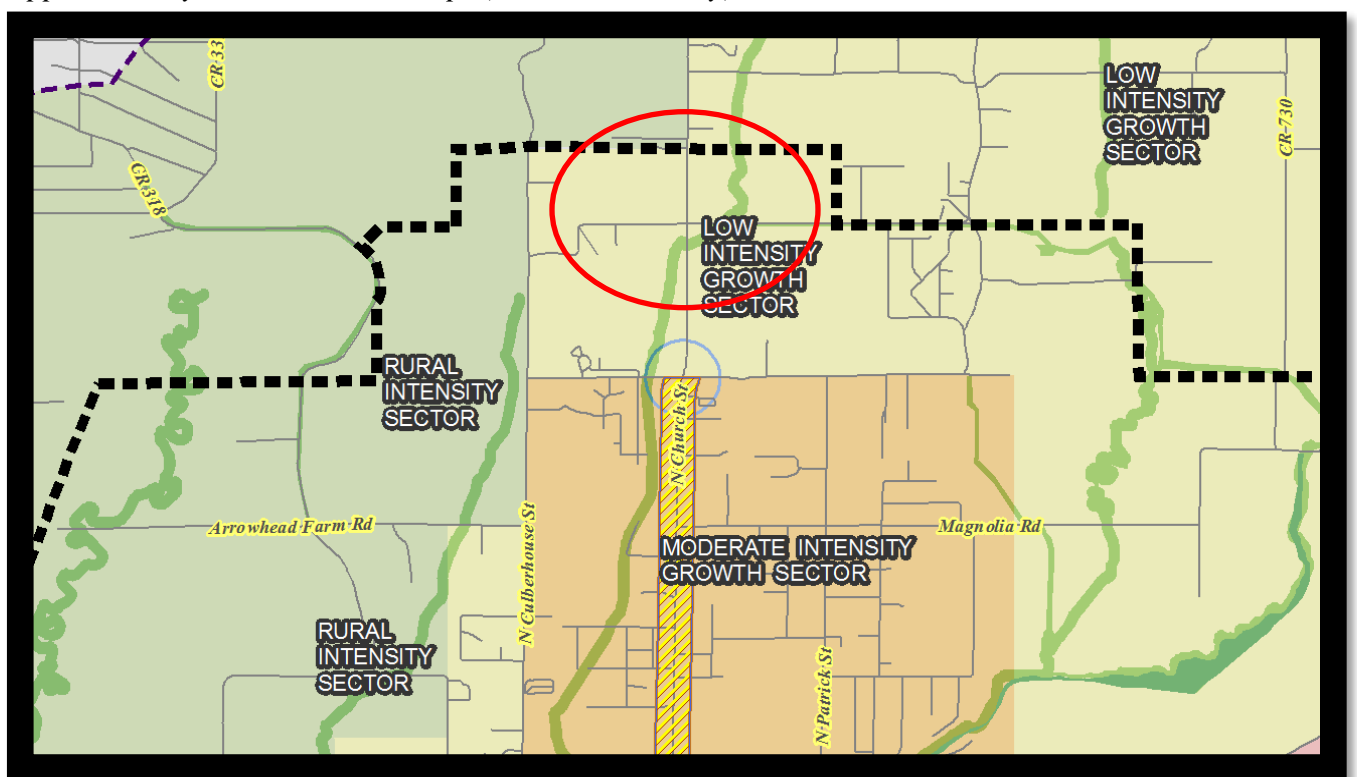
Land Use Map

Approximately 100 Peak Hour Trips (Commercial Only)