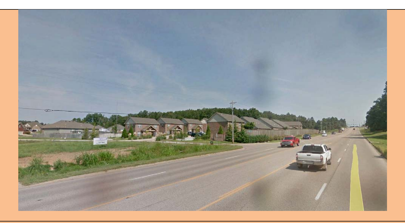
View looking North