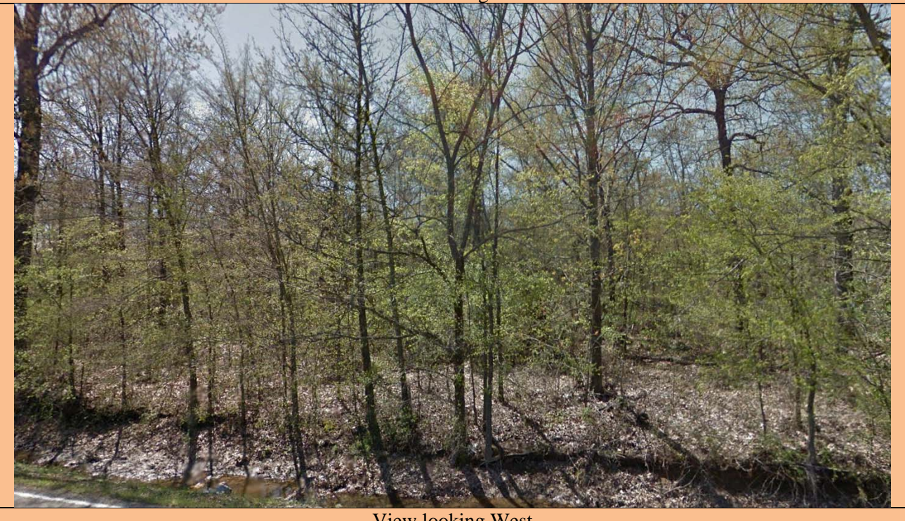
View looking West