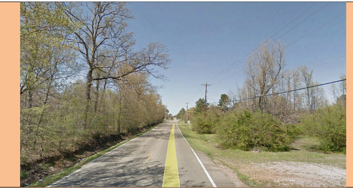
View looking North