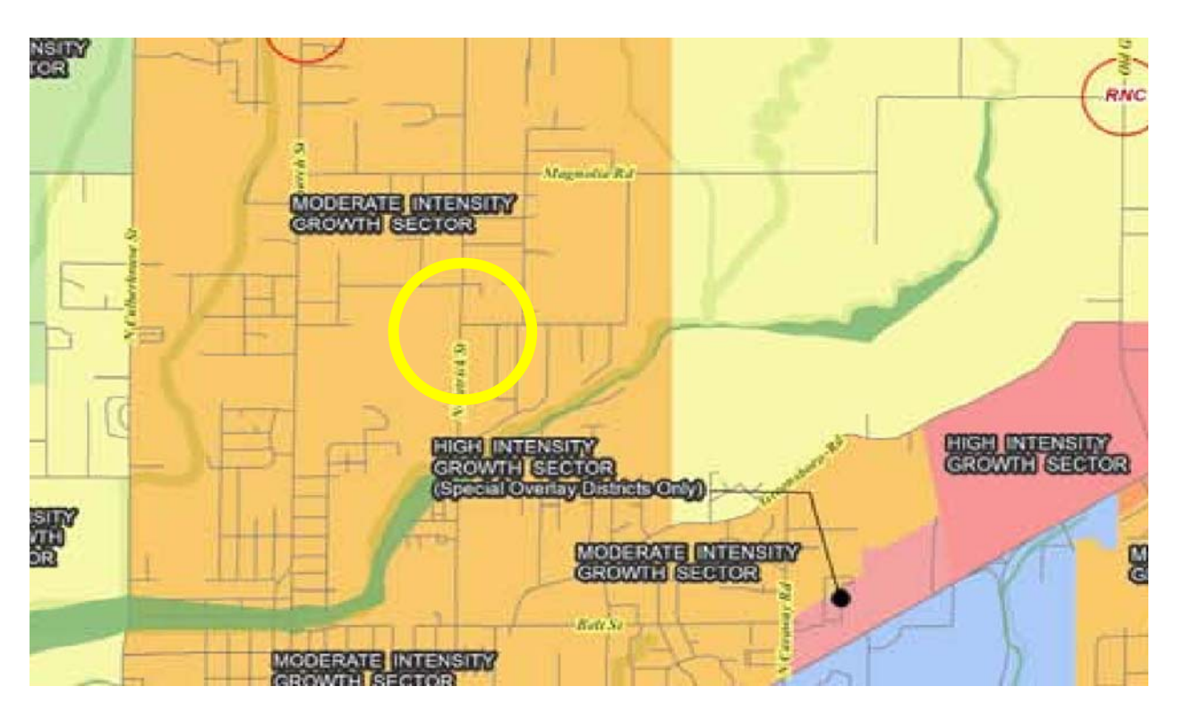
Adopted Land Use Map

The subject site is served by North Patrick Street; the street right-of-ways must adhere to the Master Street Plan.