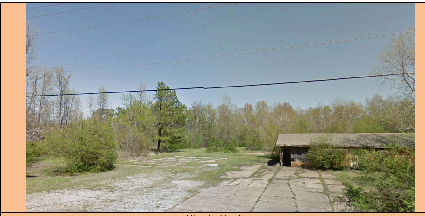
View looking East