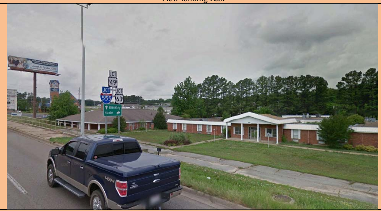
View looking West