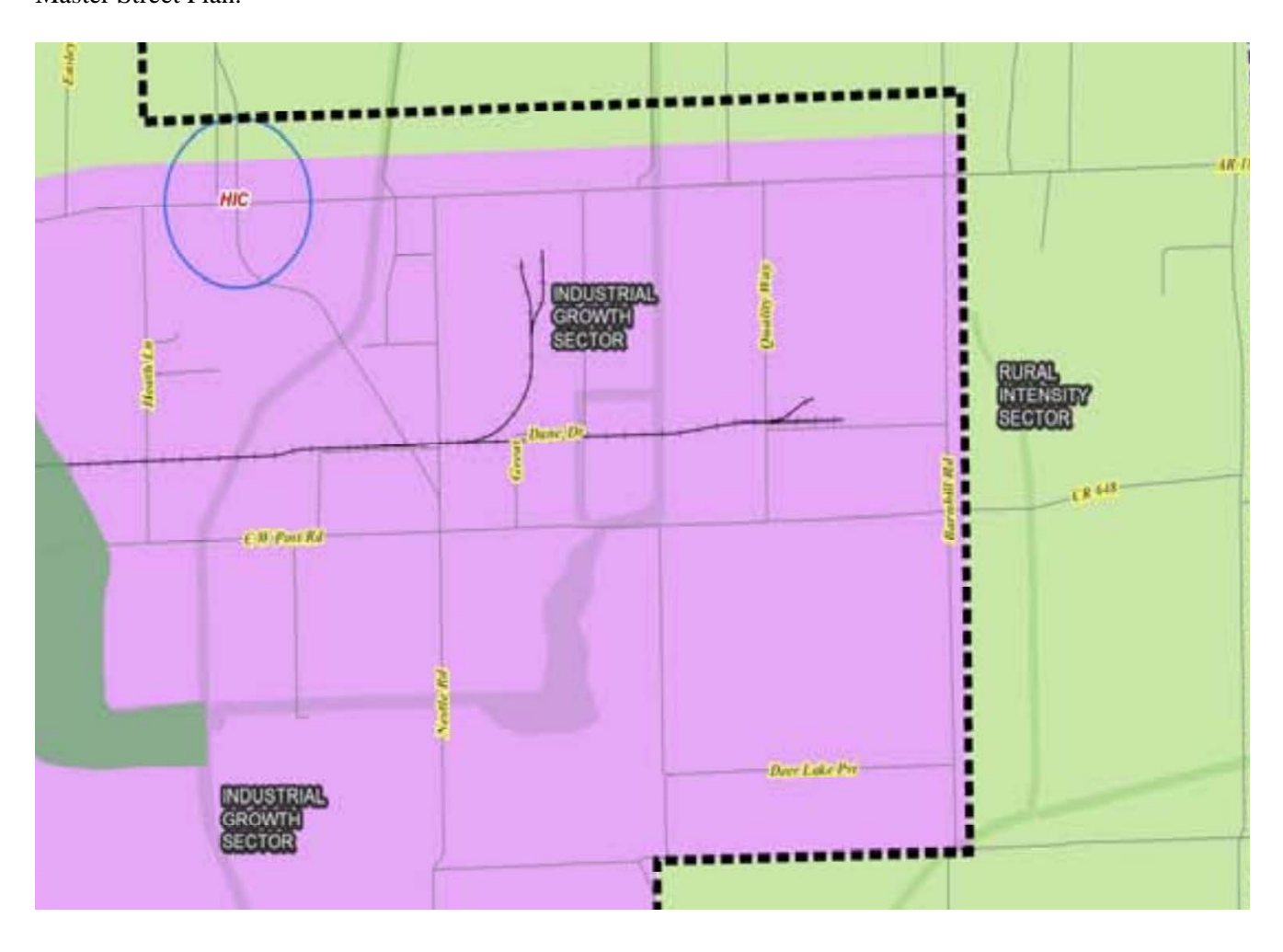
Adopted Land Use Map

The subject site is served by CW Post Road and Barnhill Road. The street right-of-ways must adhere to the Master Street Plan.