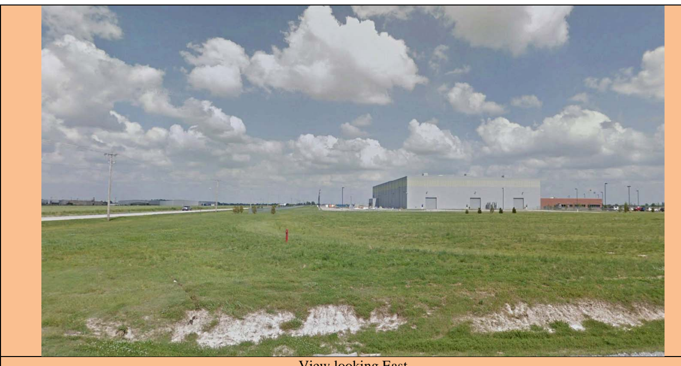
View looking East