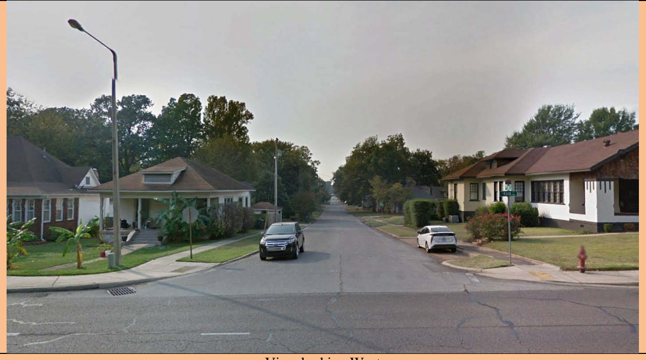
View looking West