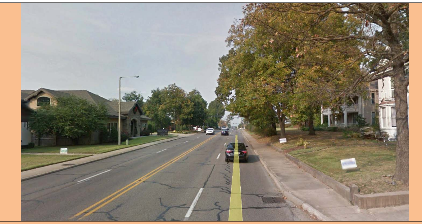
View looking North