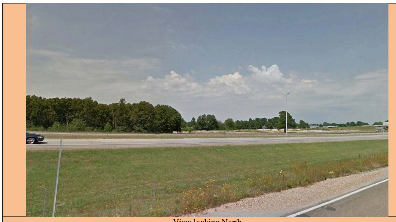
View looking North