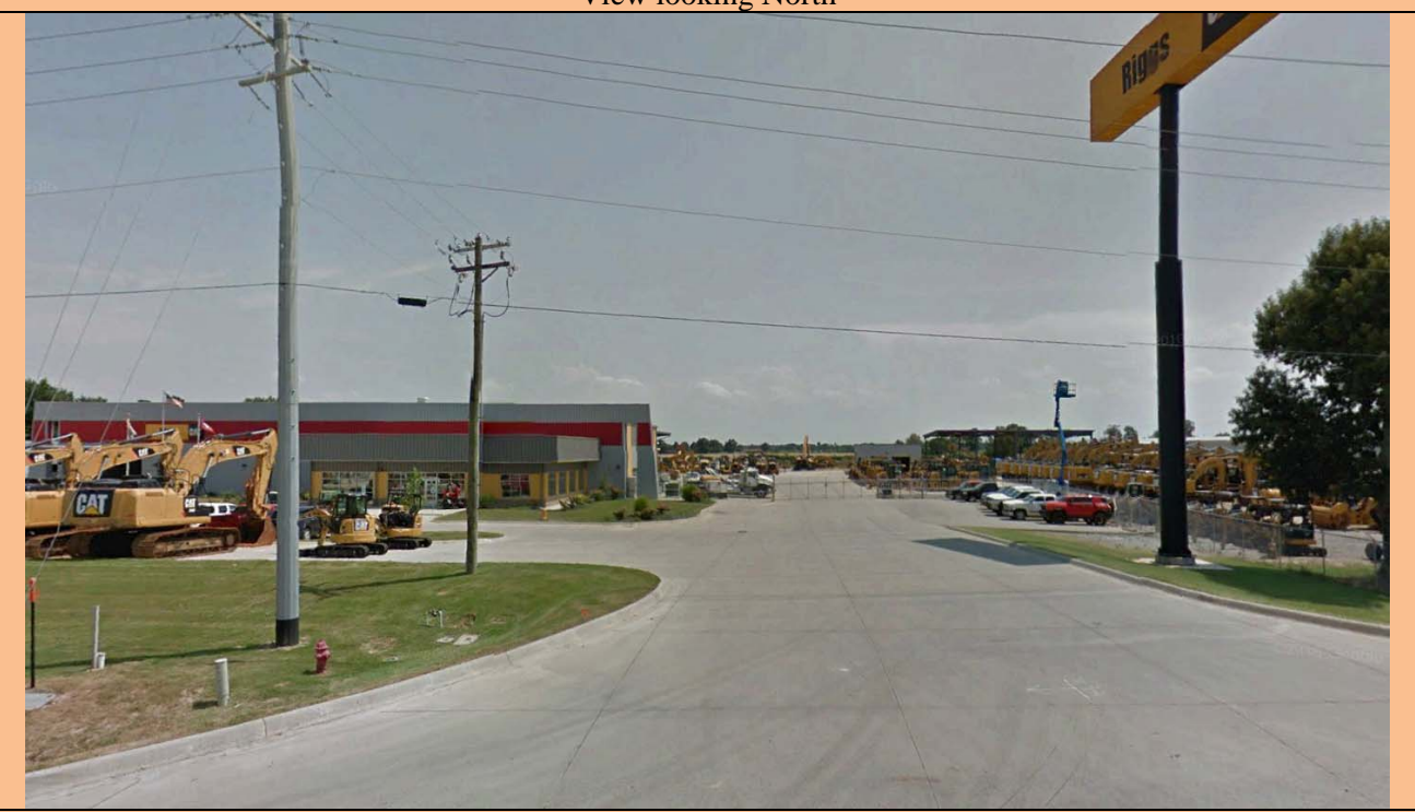
View looking South