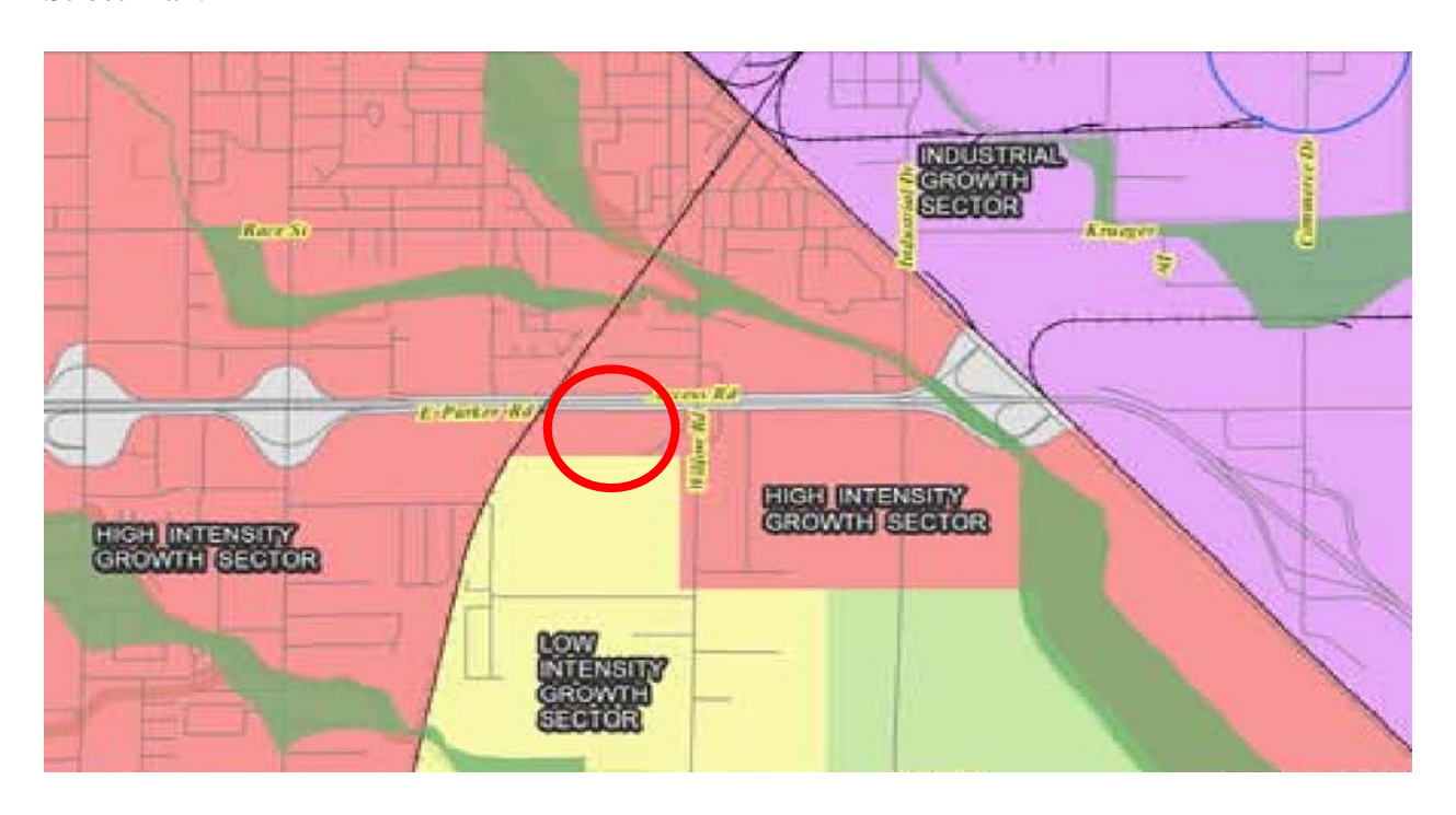
Adopted Land Use Map

<u>Master Street Plan/Transportation</u> The subject site is served by East Parker Road. The street right-of-ways must adhere to the Master Street Plan.