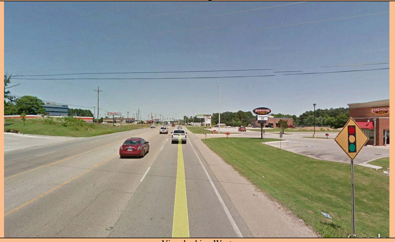
View looking West