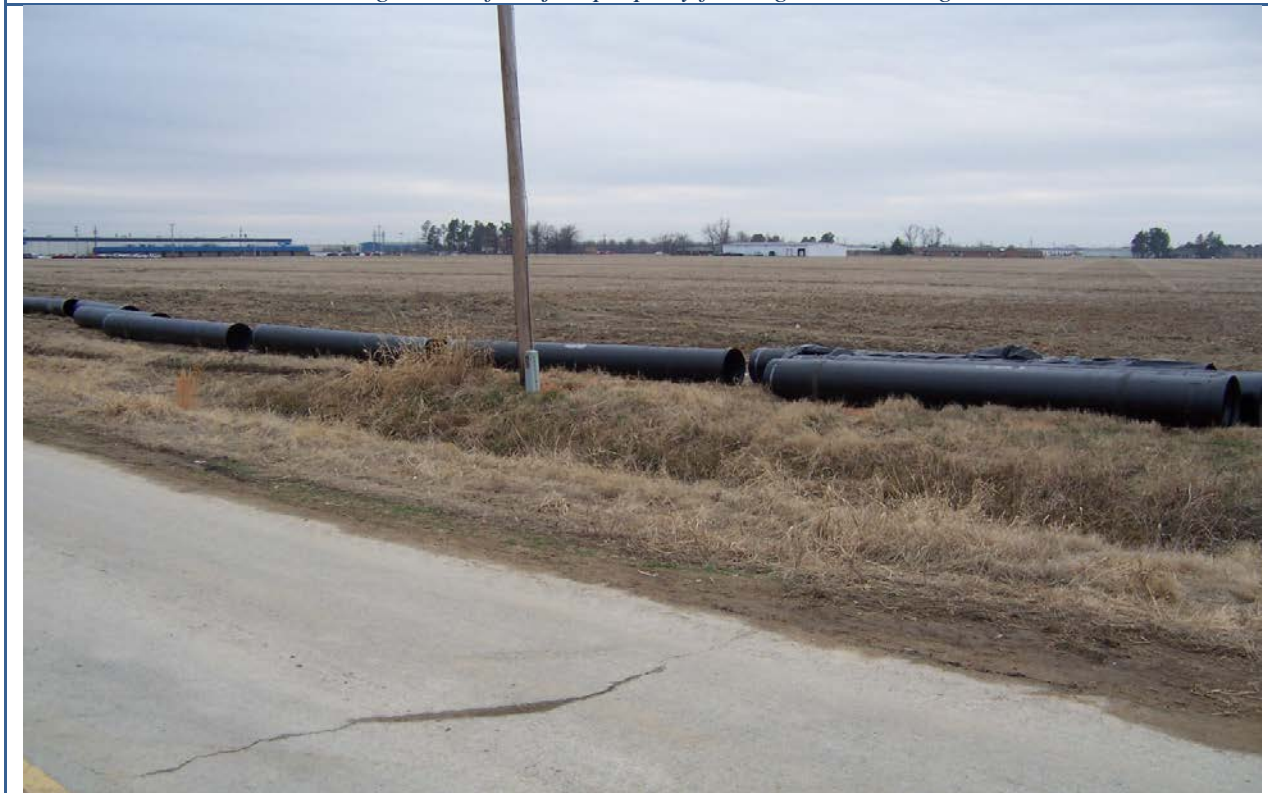
View looking Southwest of farmland and Thomas & Betts in foreground.