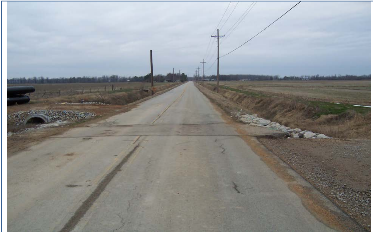
View looking North of subject property frontage and drainage ditch.