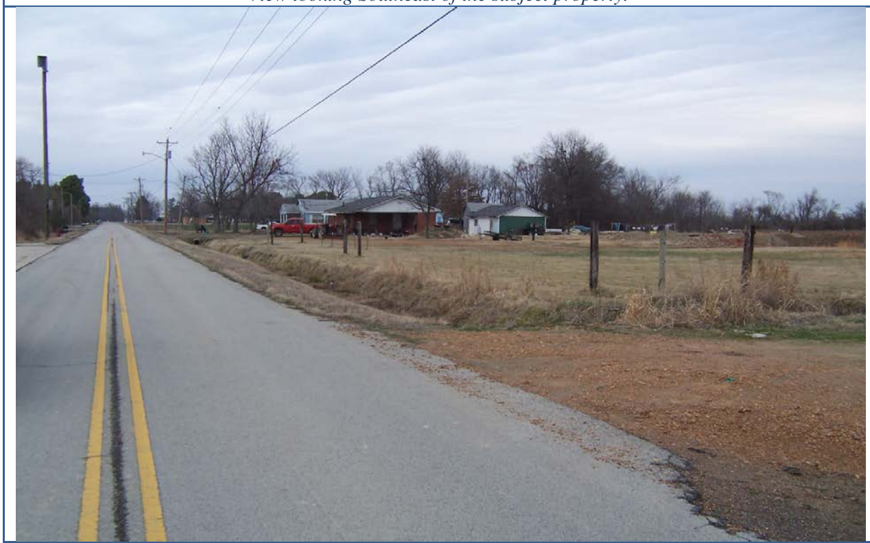
View looking North along Commerce Dr.