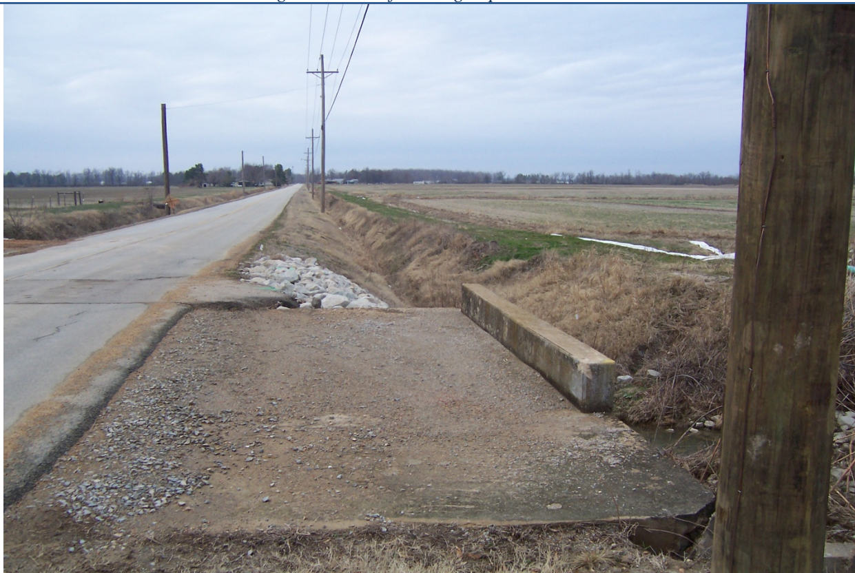
View looking North of subject property frontage and drainage ditch.