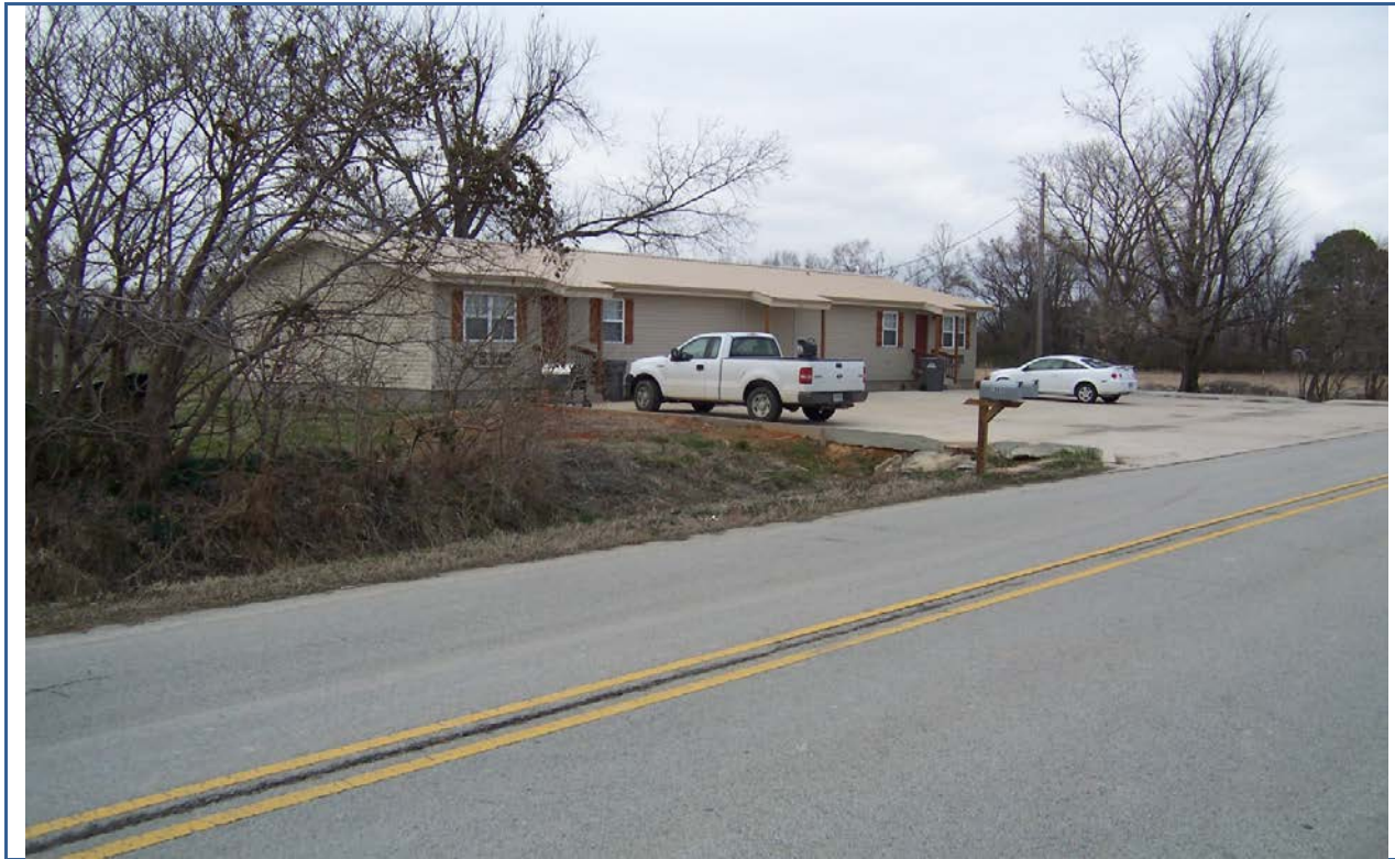
View looking Northwest of existing duplex on Commerce Dr.