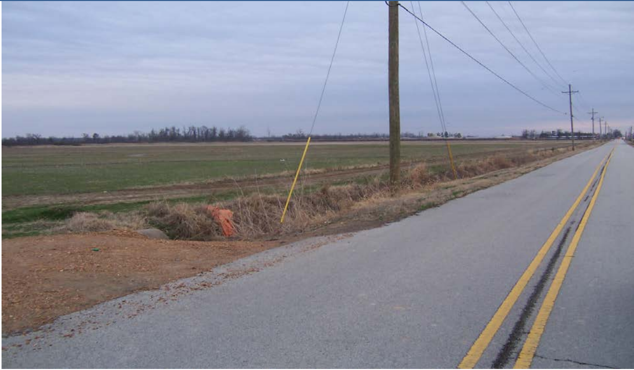
View looking Southeast along Commerce Dr.