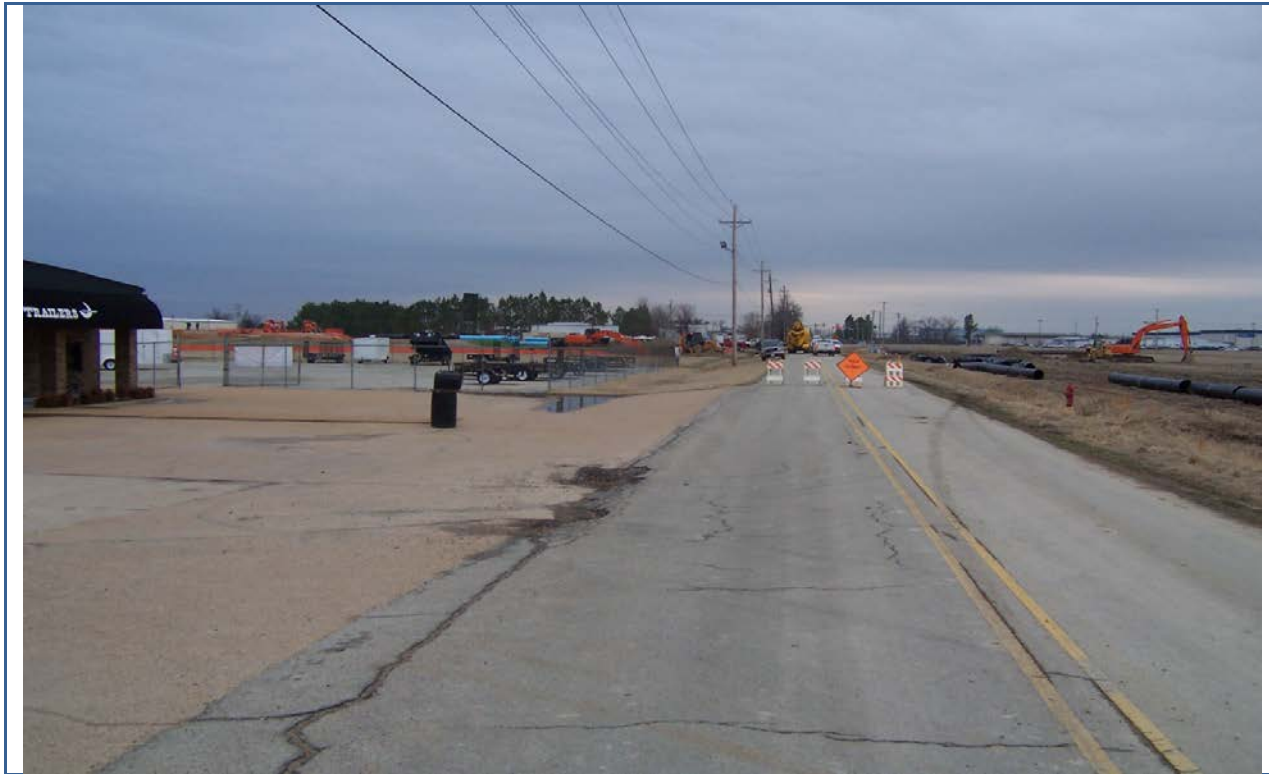
View Looking South along Commerce Rd. (CWL - installing new lines).