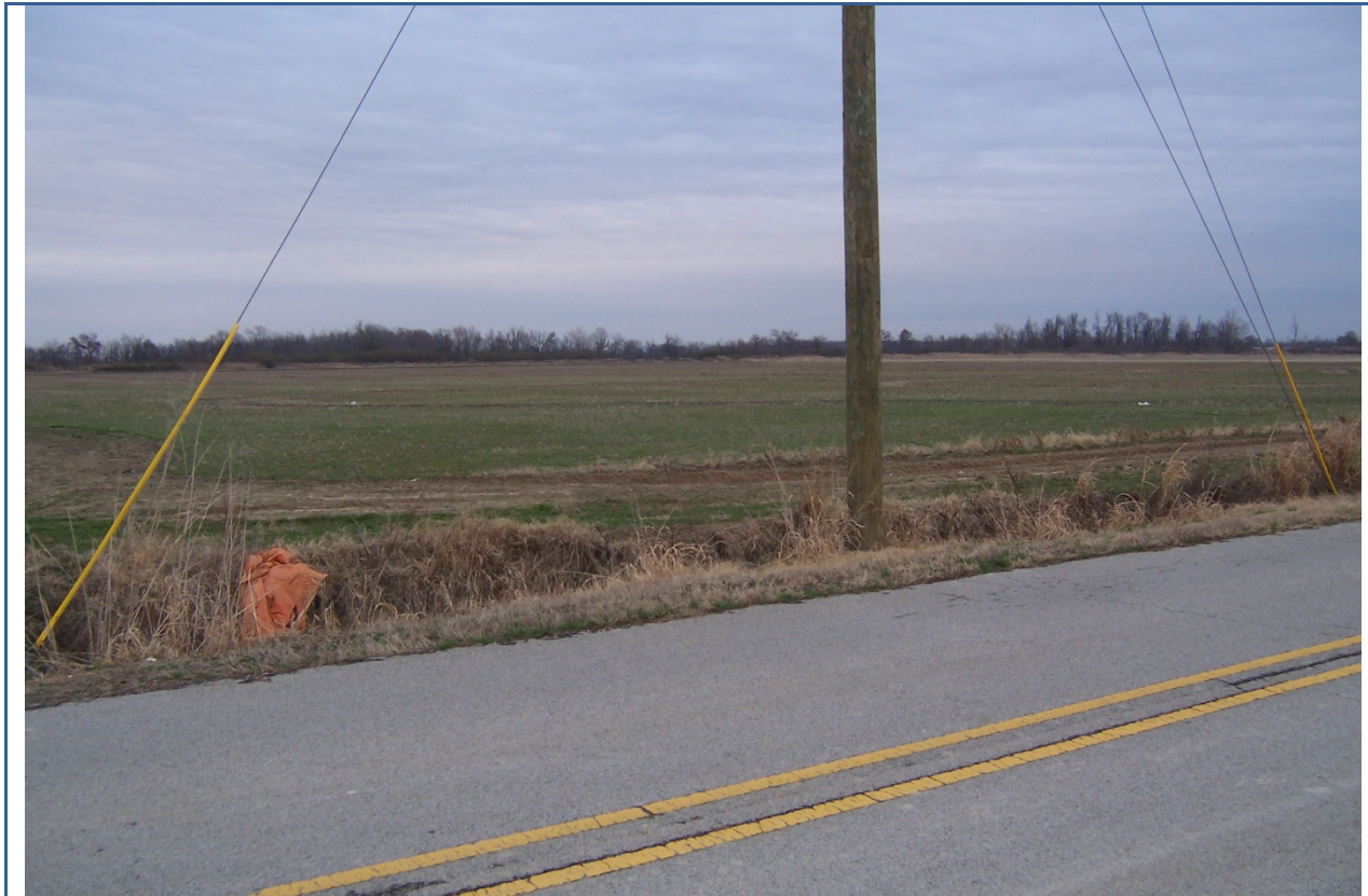
View looking Southeast of the subject property.