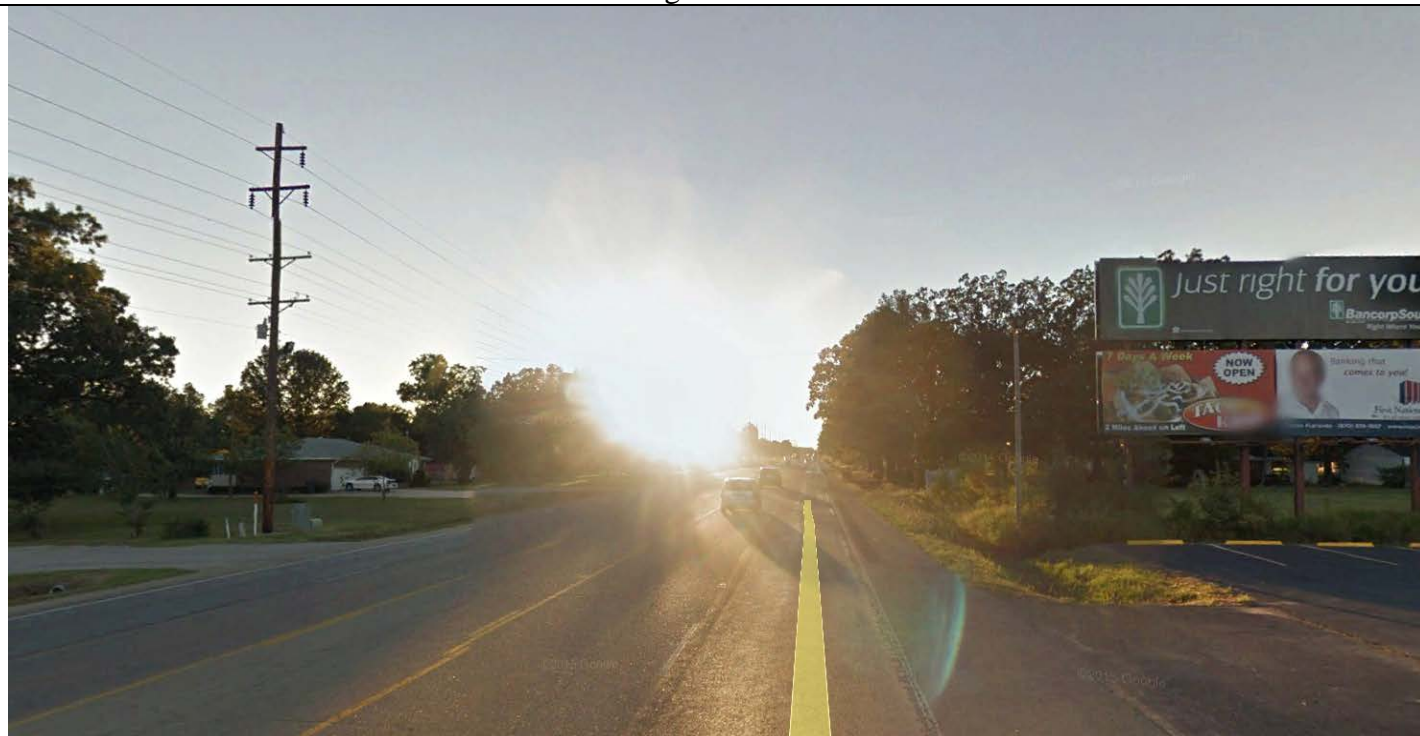
View looking West along E. Johnson Ave.