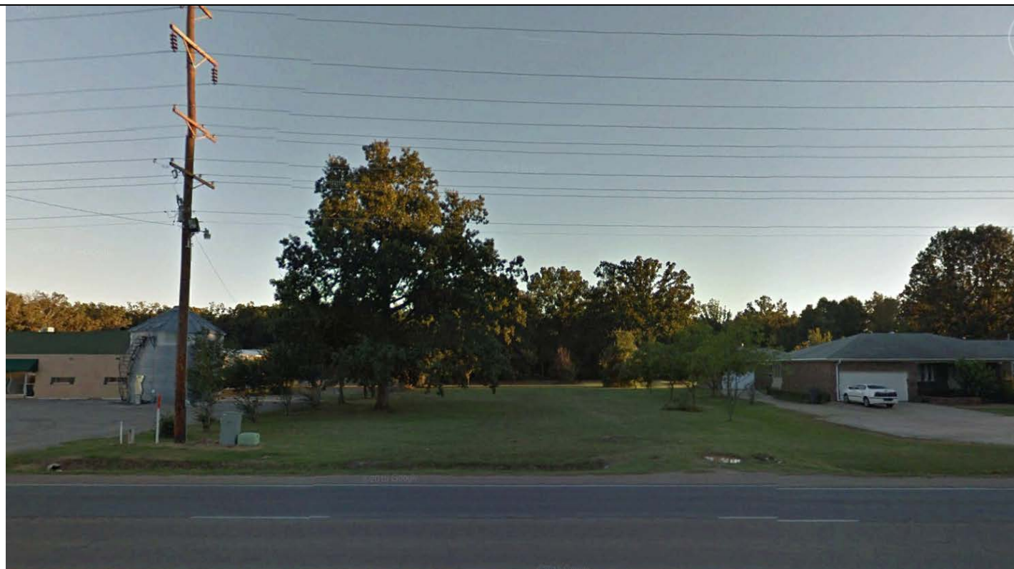
View looking South Toward Site