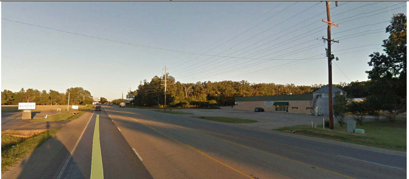
View Looking East on E. Johnson Ave.