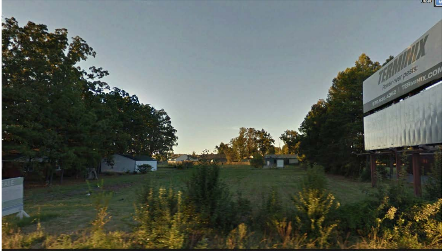
View looking North across E. Johnson Ave.