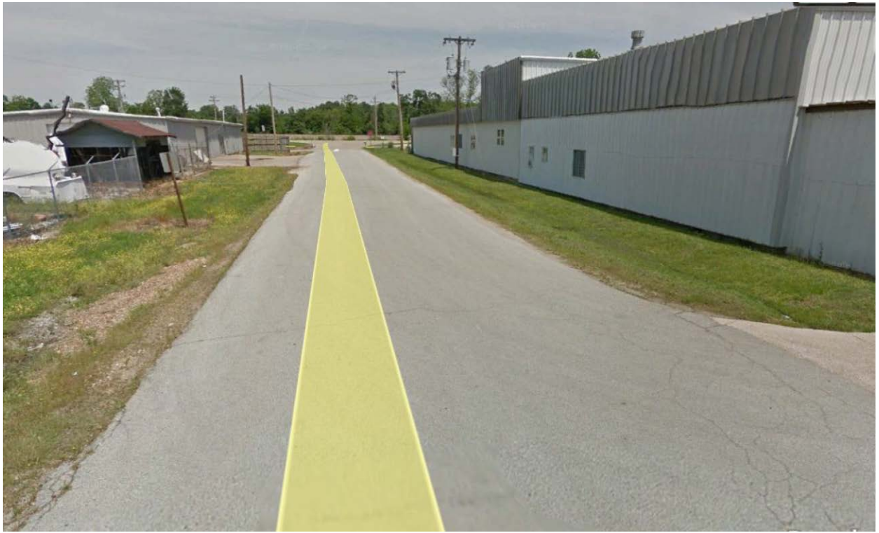
VIEW FACING NORTH ON MYETTE STREET.