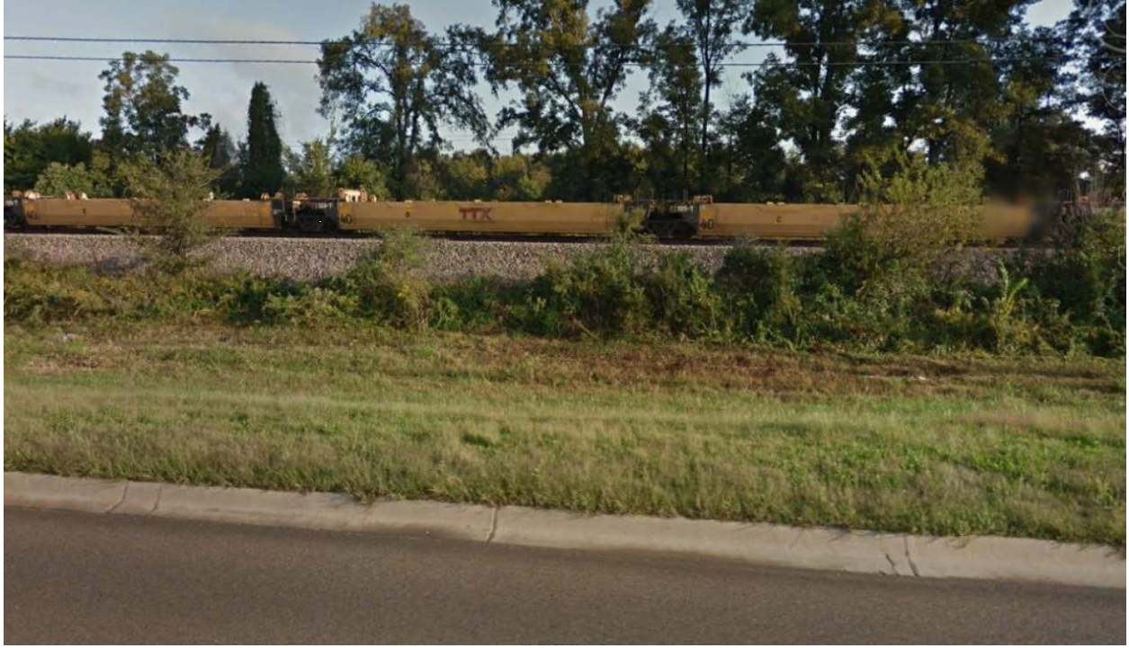
VIEW FACING NORTH DIRECTLY ACROSS THE STREET FROM PROPERTY.