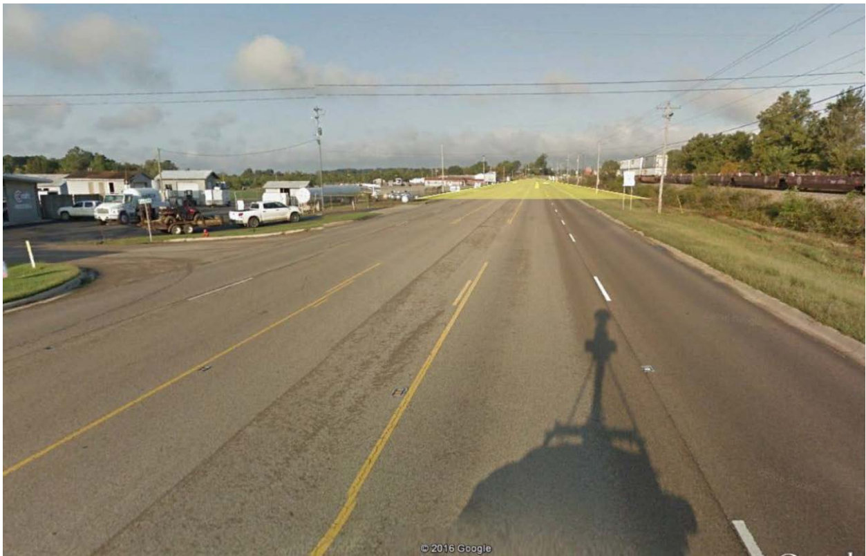
VIEW FACING WEST ON DAN AVENUE.