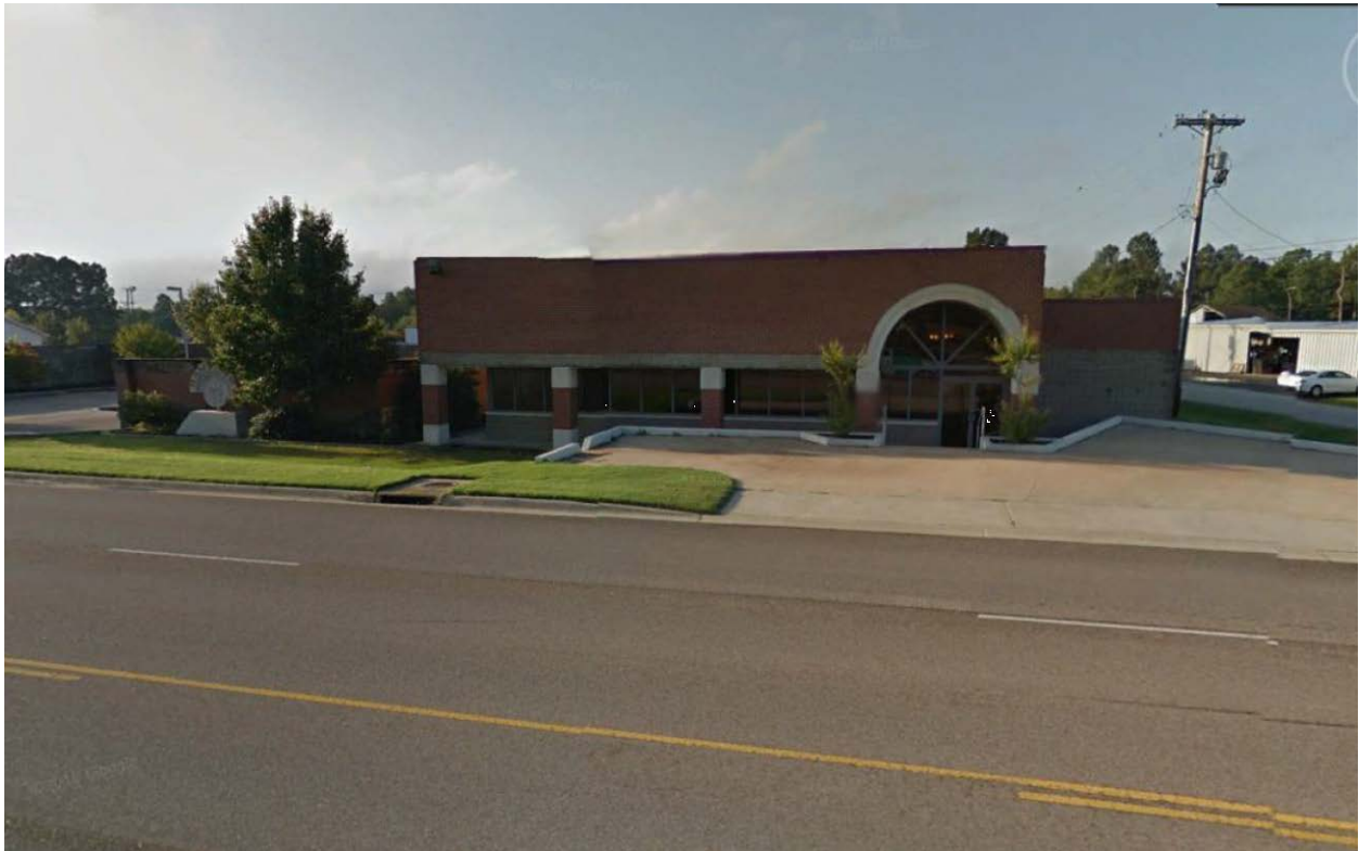
VIEW FACING SOUTH AT SUBJECT PROPERTY - 3111 DAN AVENUE