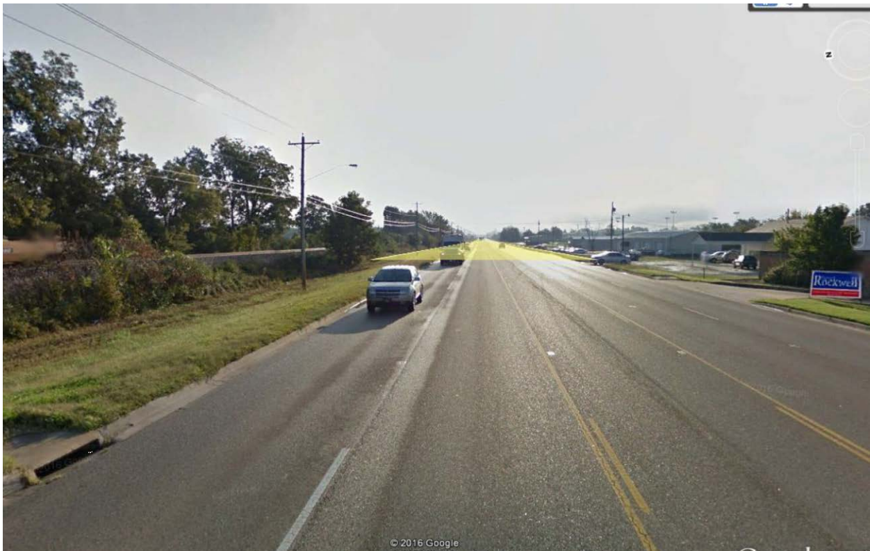
VIEW FACING EAST ON DAN AVENUE.