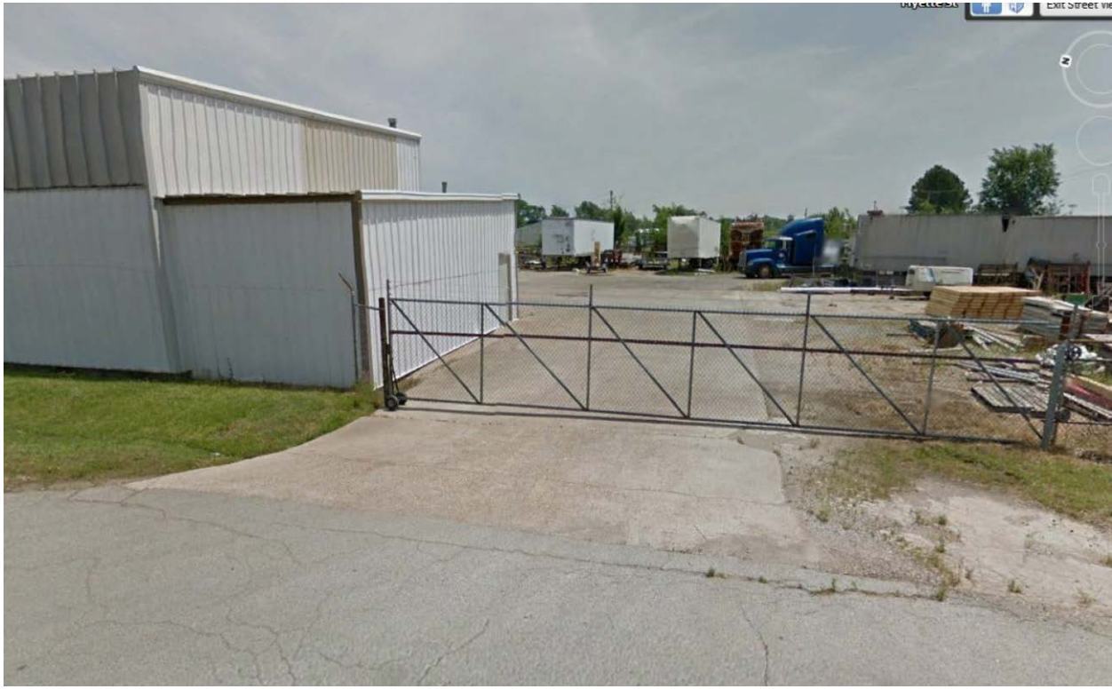
VIEW FACING EAST FROM MYETTE ST LOOKING AT SUBJECT PROPERTY.