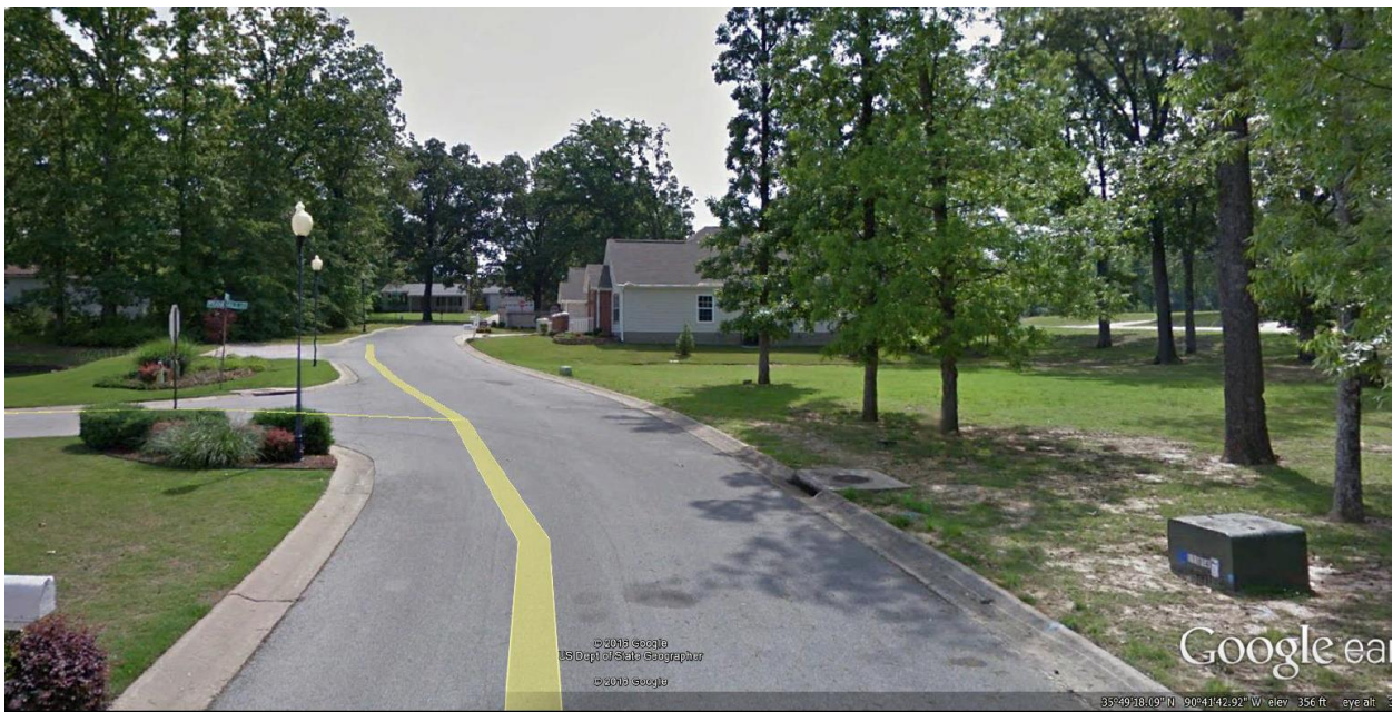
Looking East with the subject property on the right.