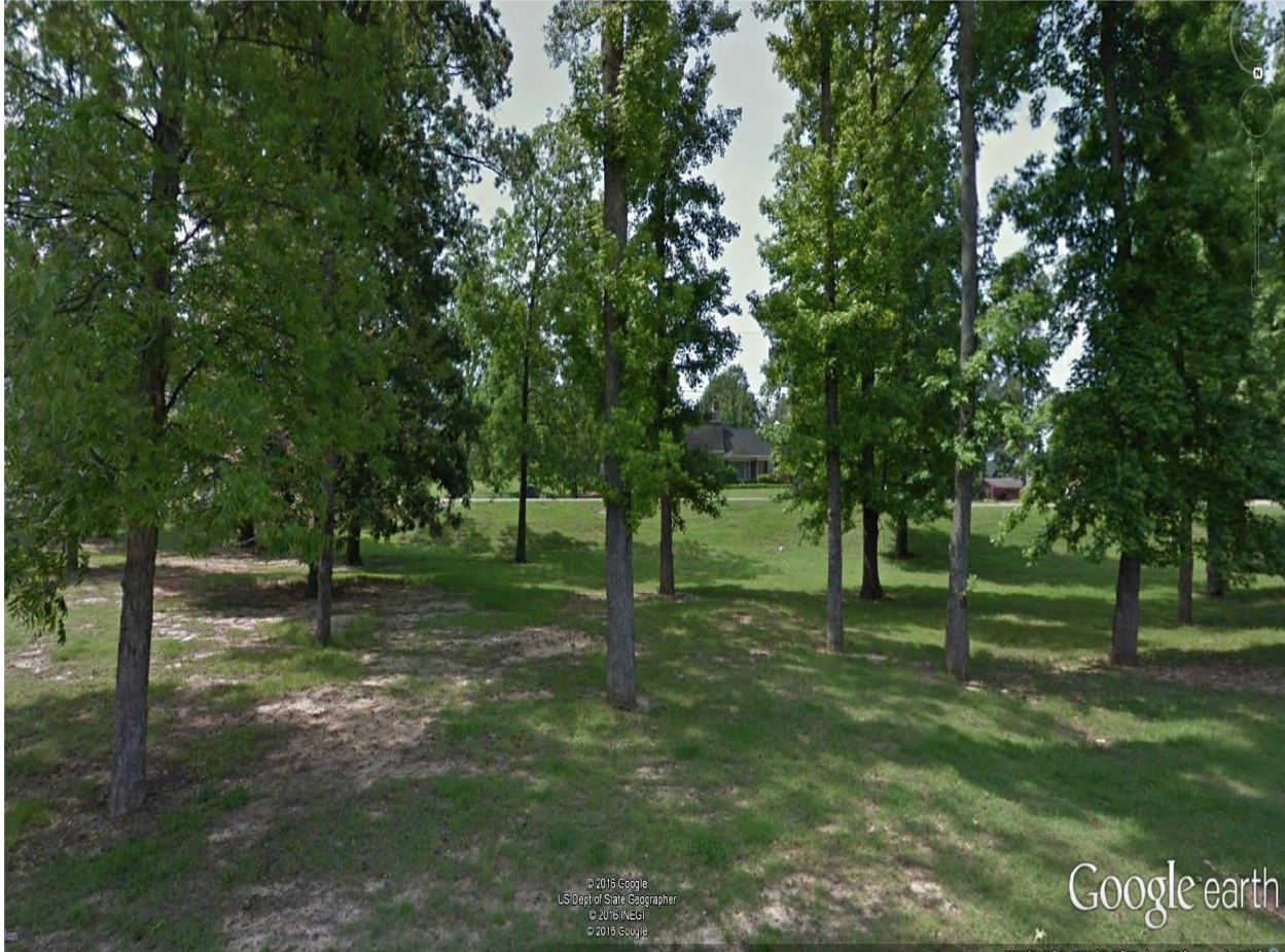
Looking directly toward the property facing north.