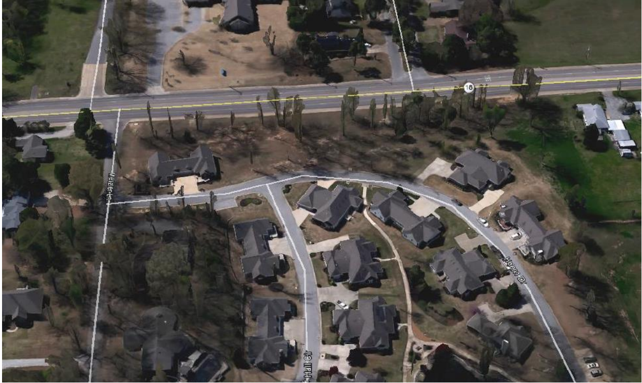
Looking South toward the property.