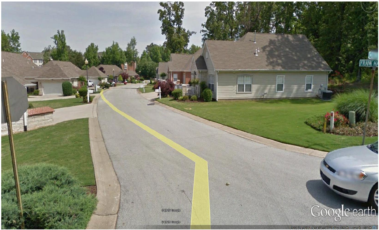
Looking directly across the street from the subject property toward the north.