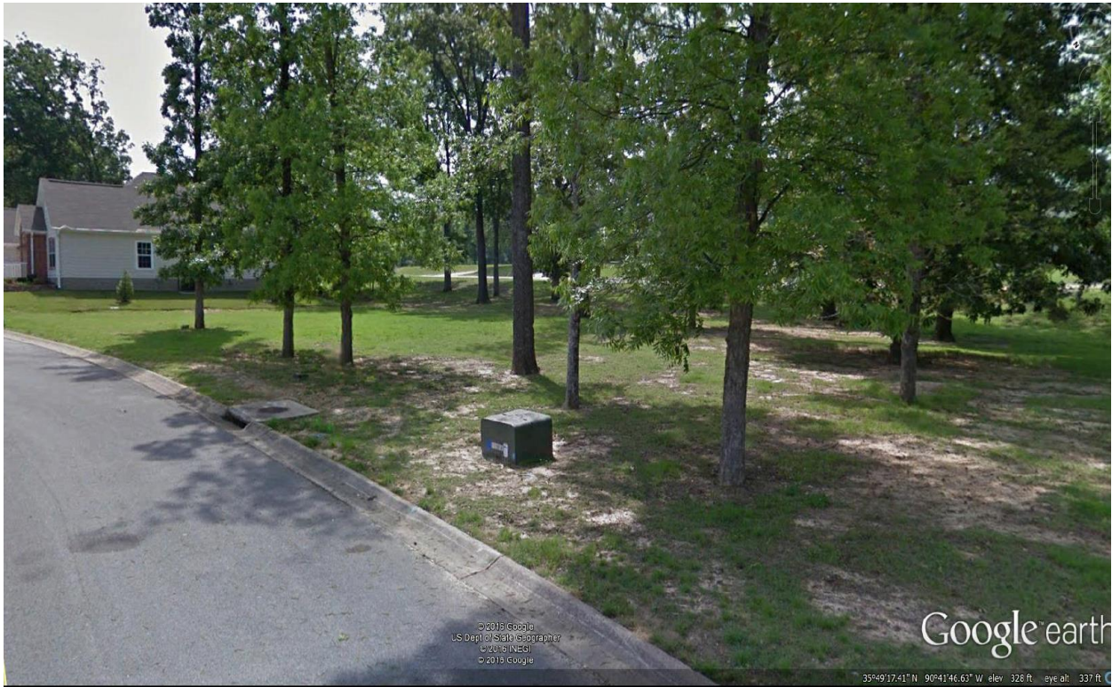
Looking southeast directly toward the subject property.