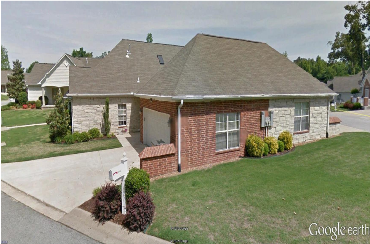
Looking toward the northwest directly from the property.