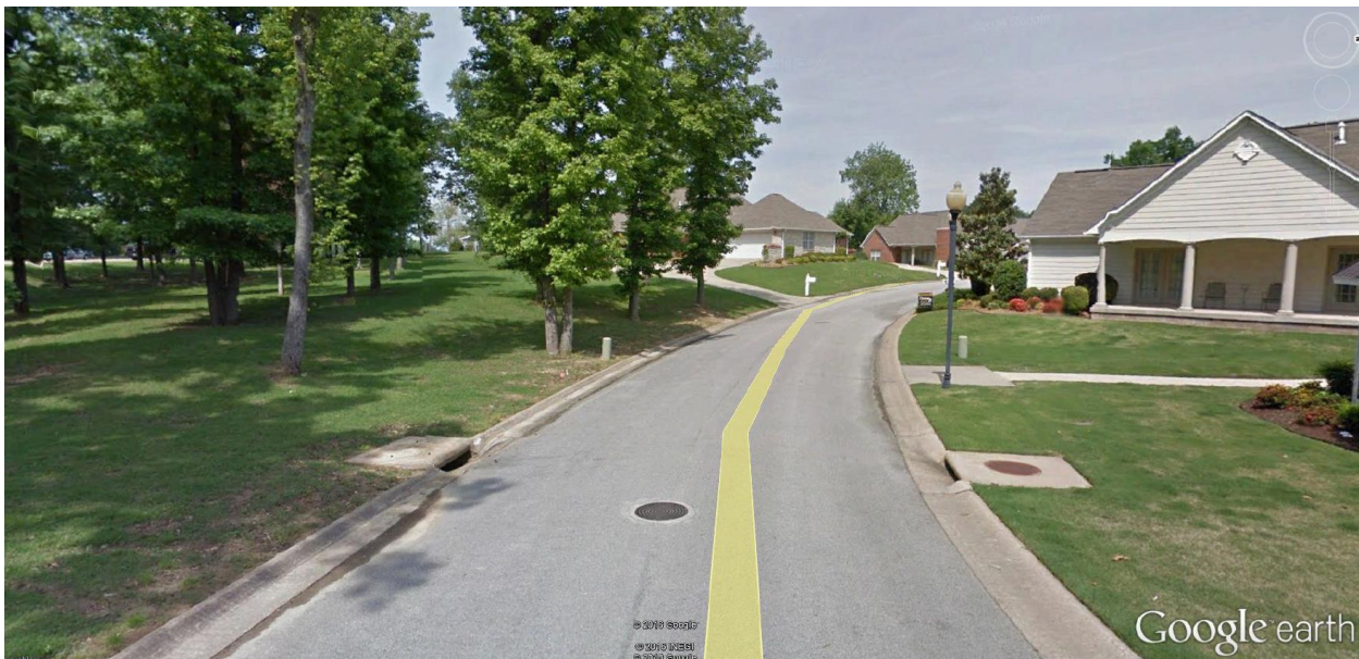
Looking directly toward the west with the property on the left.