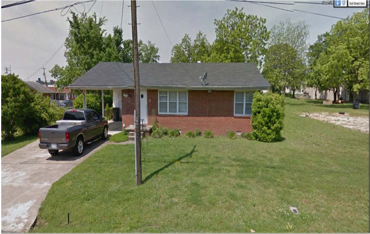
Facing directly west with the church property to the east.