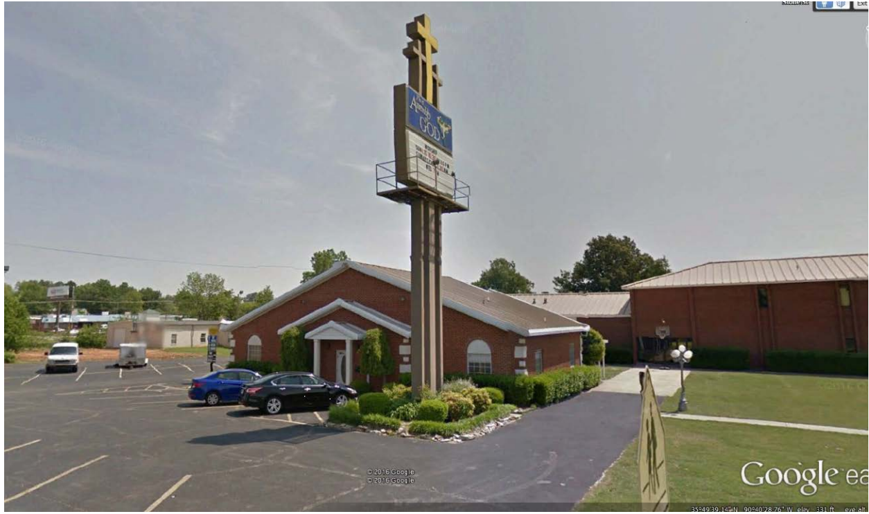
Facing directly toward the sign toward the northeast.