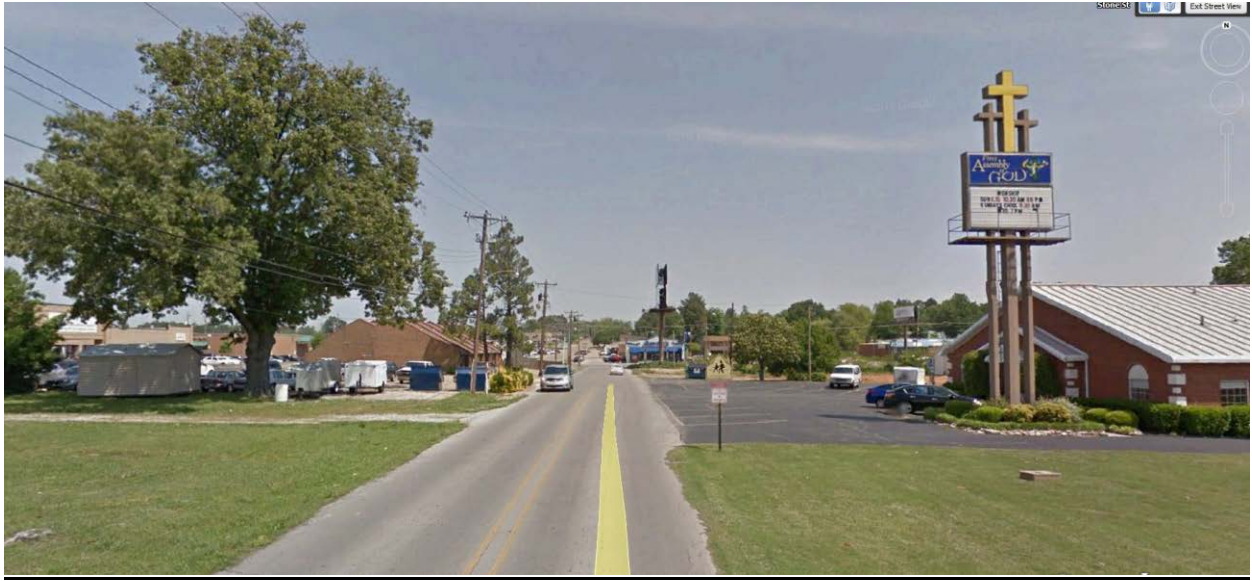
Facing directly North looking toward Nettleton with the church property on the right.