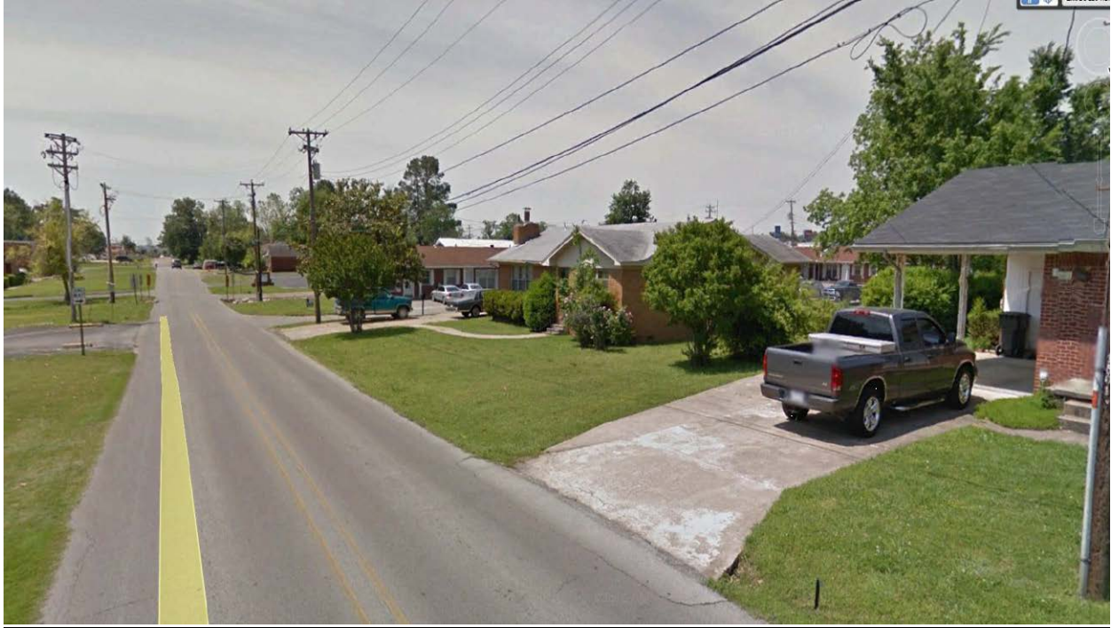
Facing Southwest with the church property on the left.