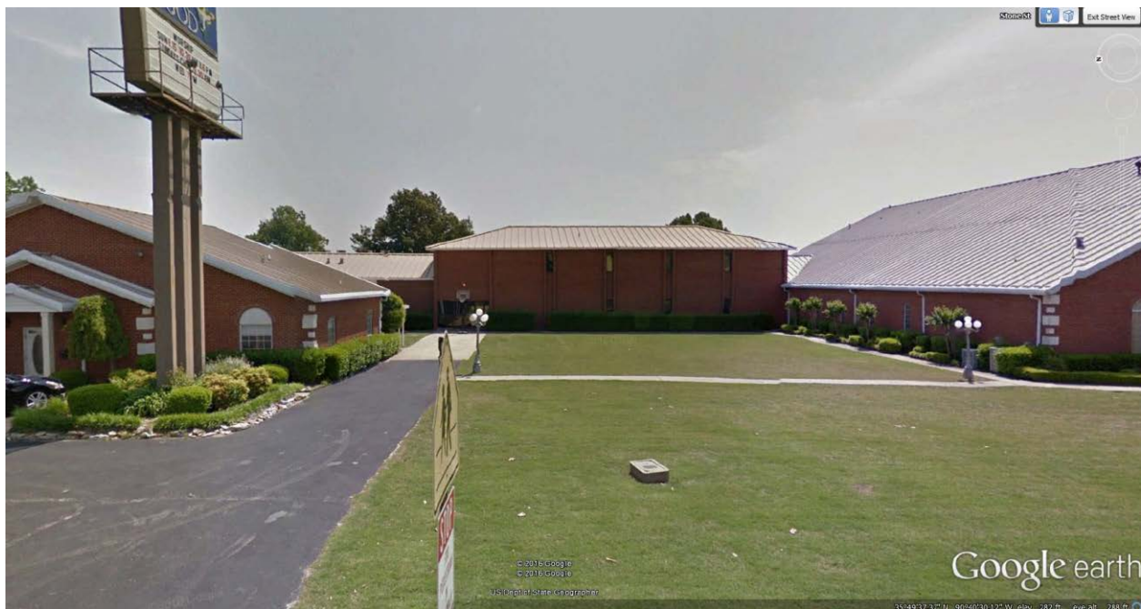
Facing directly toward the church property looking east.