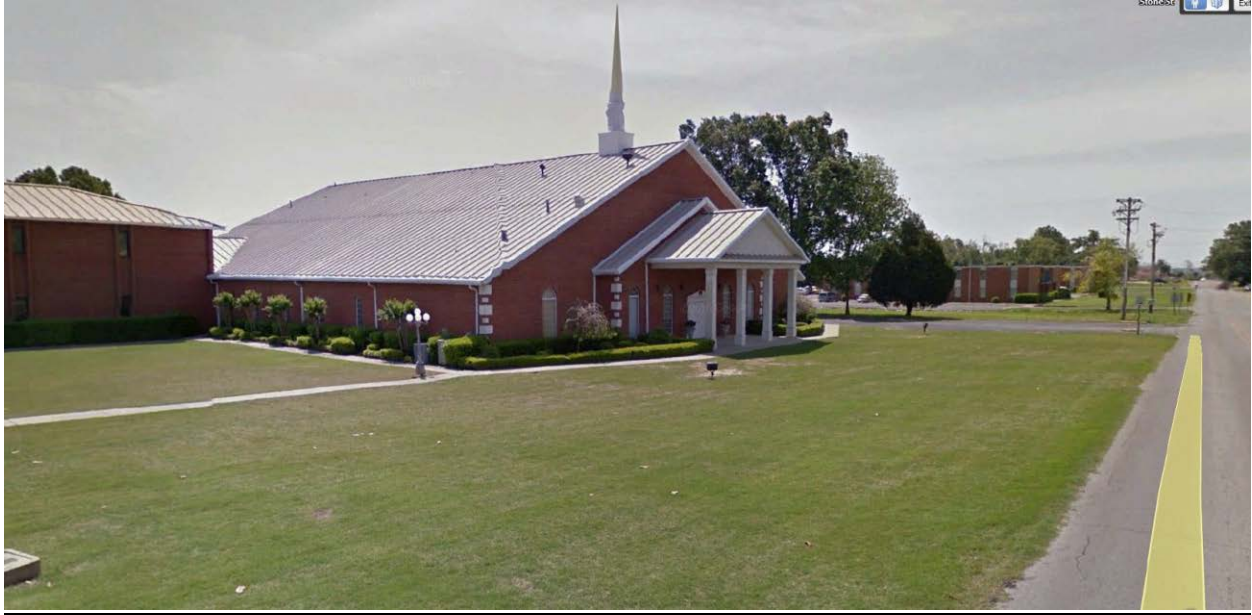
Facing church property looking southeast.