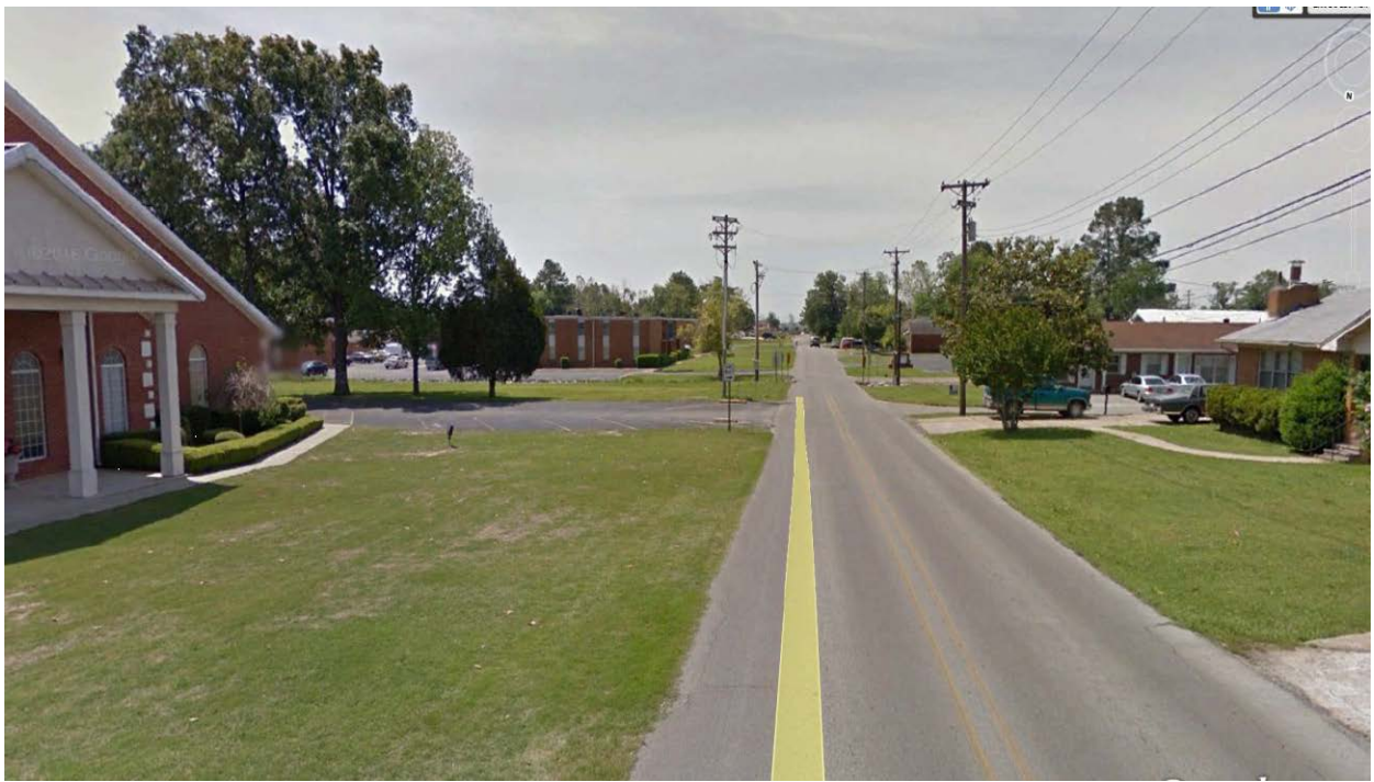
Facing directly South with church property on the left.