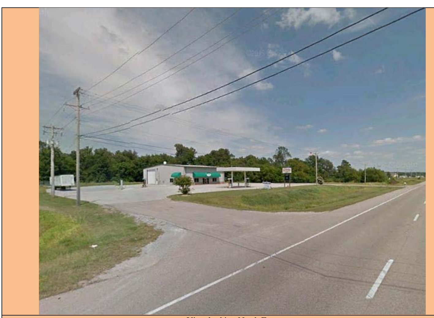
View looking North East