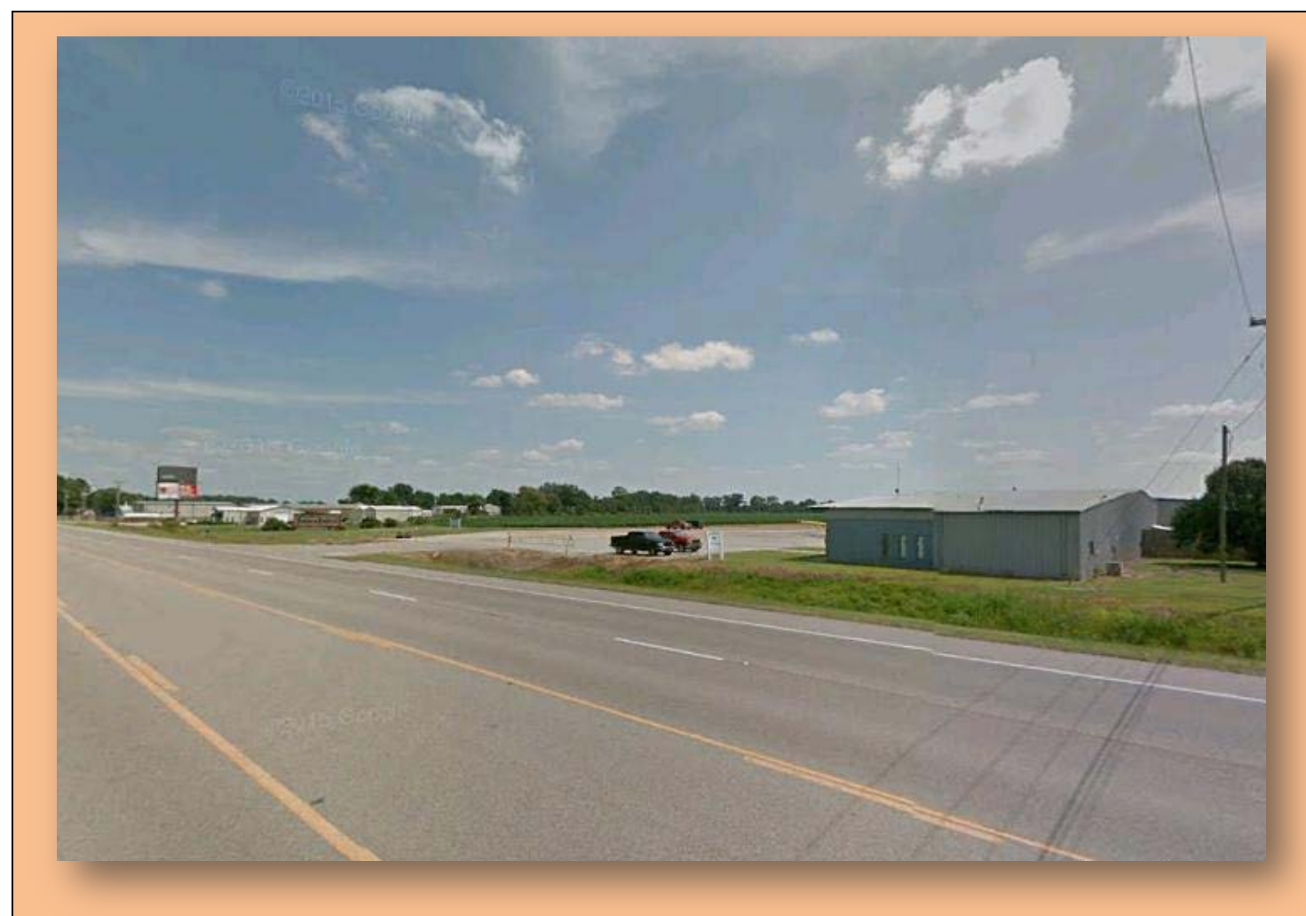
View looking south toward property site