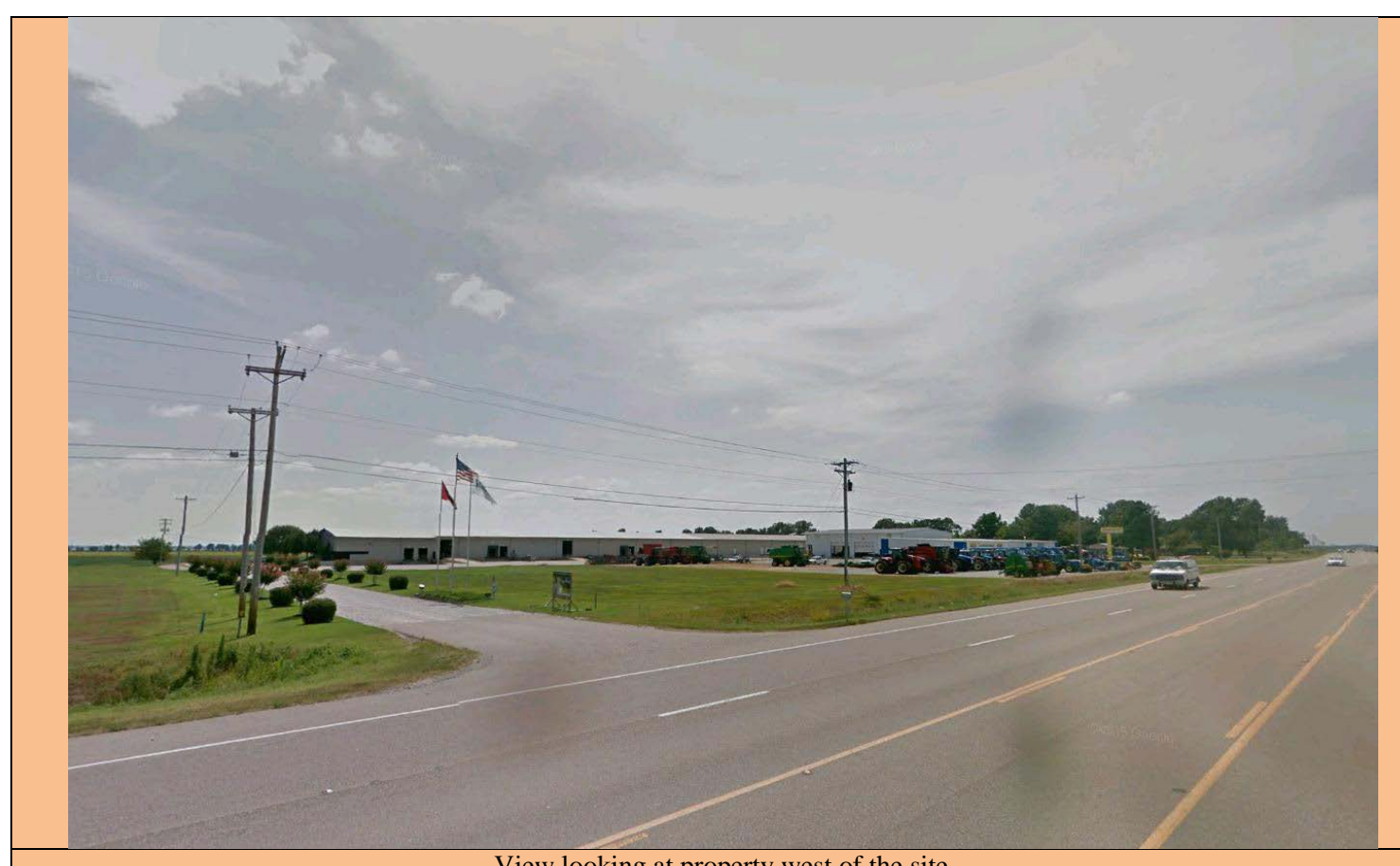
View looking at property west of the site