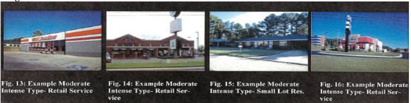
Fig. 13: Example Moderate Intense Type- Retail Service